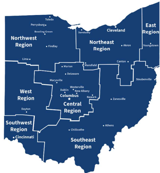
Figure 2. ODEW Career Pathway Support Network

All work in this focus area will be directed by DriveOhio, through tasks separate from the other focus areas.