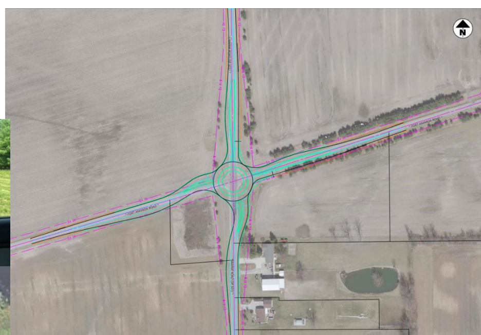
Crash Diagram ALL-SR 501 & Fort Amanda Road Analysis Years: 2019-2023