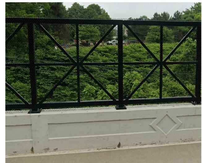
ORNAMENTAL RAILING PHOTO FROM ABBEY AVENUE OVER GCRTA