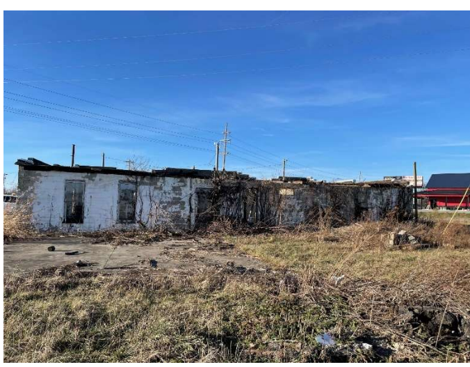
REAR (Facing North-West from Field)