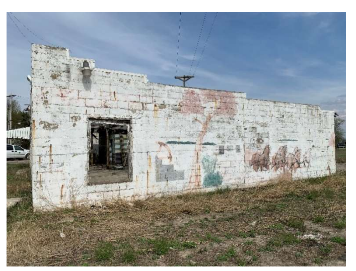
SIDE (Facing North-East from SR-37)