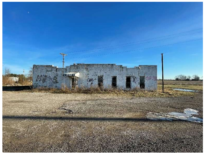
FRONT (Facing South-East from Intersection)