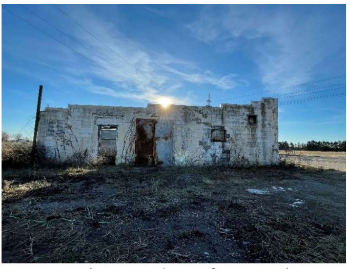
SIDE (Facing South-West from SR-256)