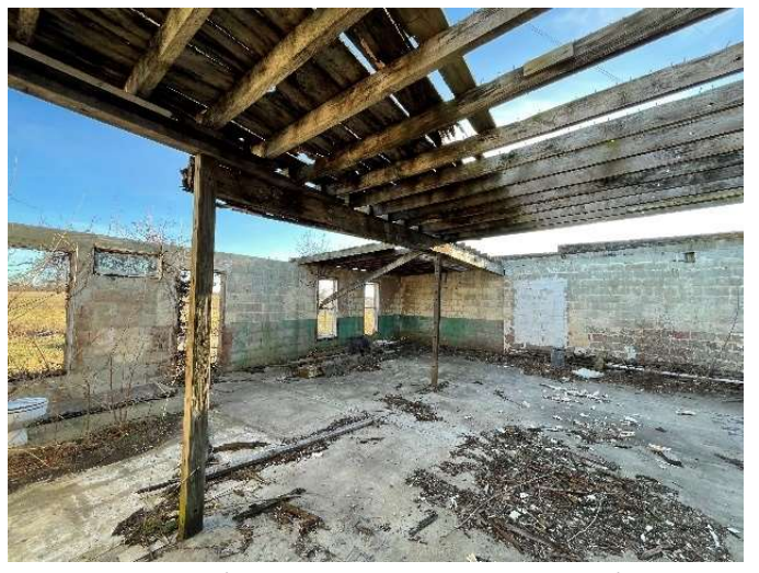
INSIDE (Facing South at Rear and Side)