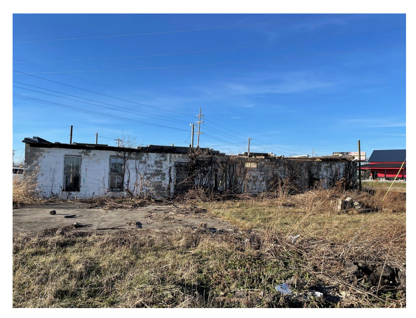
REAR (Facing North-West from Field)