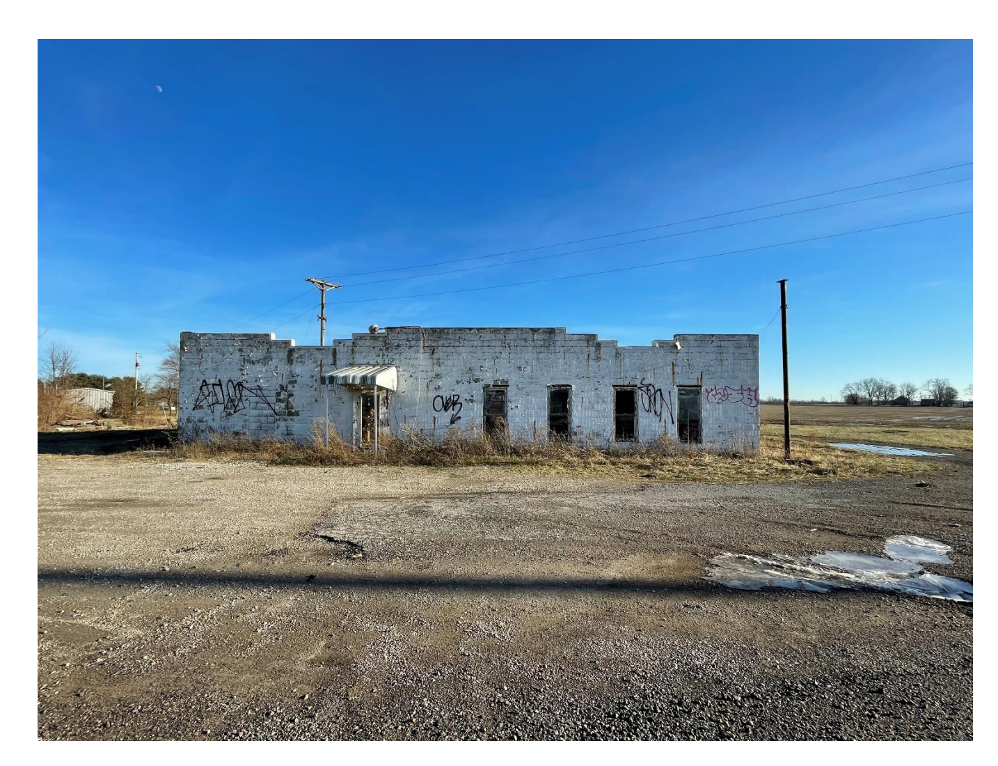
FRONT (Facing South-East from Intersection)