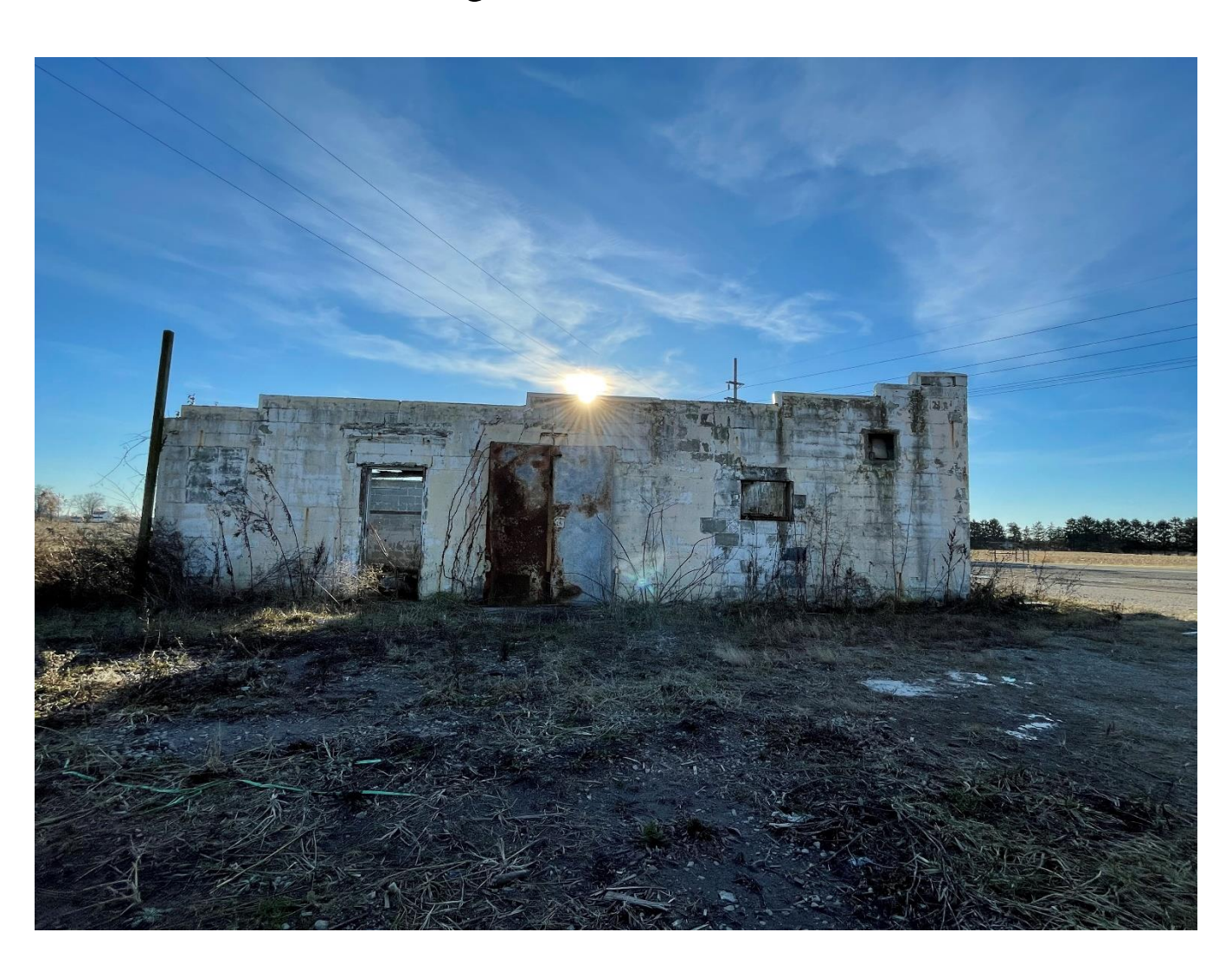
SIDE (Facing South-West from SR-256)