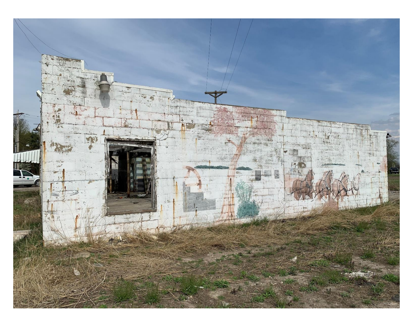
SIDE (Facing North-East from SR-37)