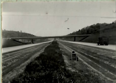
Rear Lkq. Hhd. 5-24-67