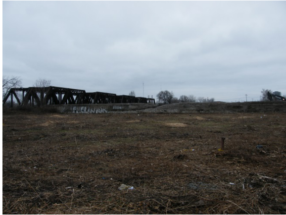
Photograph D-52: View from West Bank Looking Eastward Approximate Location of Proposed Ramp C5 Bridge