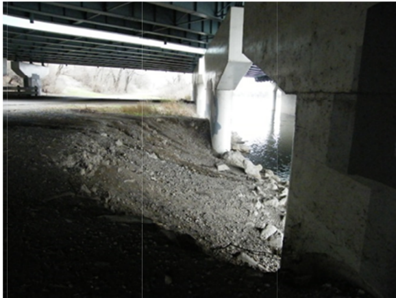
Photograph D-24: On East Bank View Looking Downstream Approximate Location of Proposed Ramp C5 Bridge