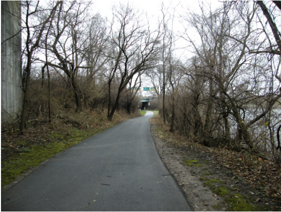
Photograph D-37: View from West Bank Looking Eastward Approximate Location of Proposed Ramp C5 Bridge