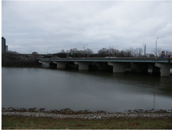
Photograph D-1: View from West Bank Looking Eastward Approximate Location of Proposed Ramp C5 Bridge