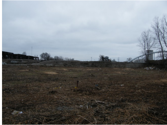
Photograph D-53: On East Bank at Approximate Location of Photographs D-3 and D-4