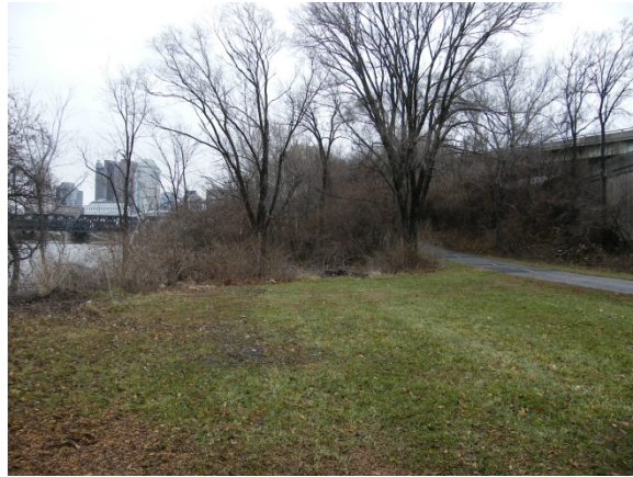
Photograph D-47: On East Bank View Looking Upstream Approximate Location of Proposed Ramp C5 Bridge