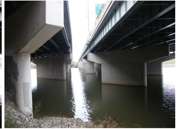
Photograph D-7: On East Bank View Looking Downstream Approximate Location of Proposed Ramp C5 Bridge