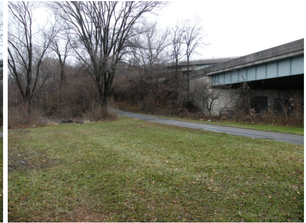
Photograph D-48: On East Bank Flap Gate on Storm Outlet Approximate Location of Proposed Ramp C5 Bridge