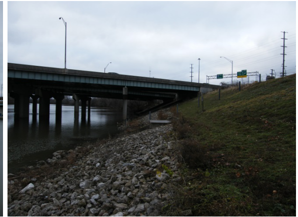
Photograph D-77: On East Bank at Approximate Location of Photographs D-3 and D-4