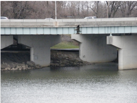
Photograph D-35: On East Bank View Looking Downstream Approximate Location of Proposed Ramp C5 Bridge