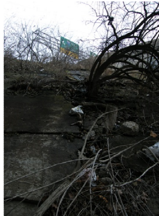
Photograph D-74: On East Bank at Approximate Location of Photographs D-3 and D-4