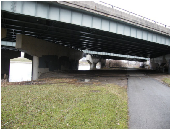
Photograph D-11: View from West Bank Looking Eastward Approximate Location of Proposed Ramp C5 Bridge