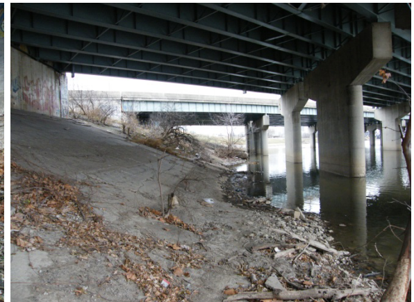
Photograph D-72: On East Bank Flap Gate on Storm Outlet Approximate Location of Proposed Ramp C5 Bridge