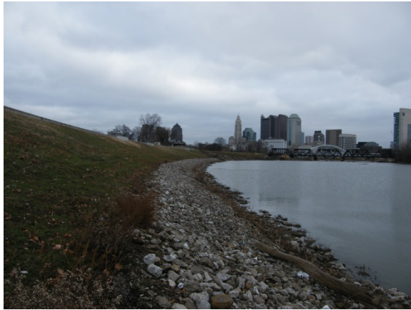
Photograph D-75: View from West Bank Looking Eastward Approximate Location of Proposed Ramp C5 Bridge