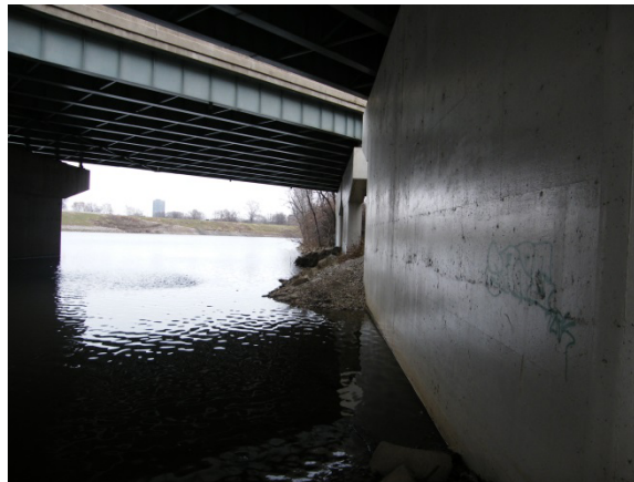
Photograph D-20: On East Bank View Looking Upstream Approximate Location of Proposed Ramp C5 Bridge