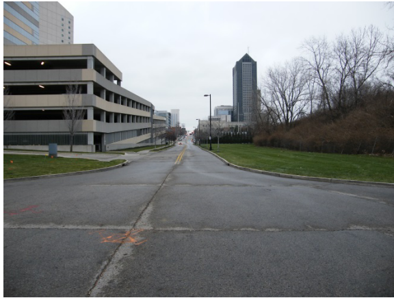
Photograph D-55: View from West Bank Looking Eastward Approximate Location of Proposed Ramp C5 Bridge