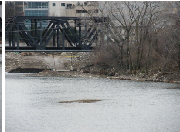
Photograph D-10: On East Bank View Looking Downstream Approximate Location of Proposed Ramp C5 Bridge