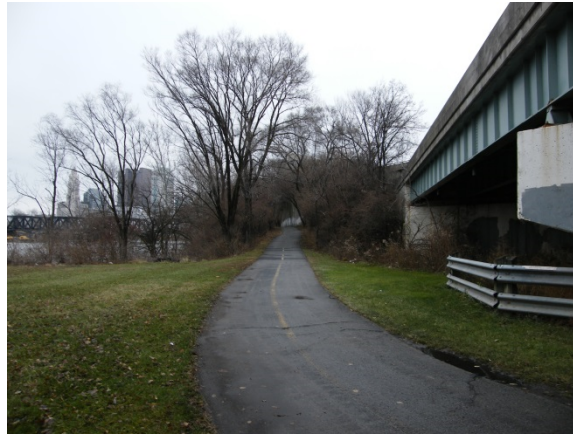
Photograph D-44: On East Bank at Approximate Location of Photographs D-3 and D-4