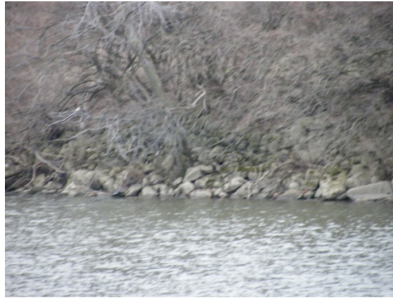
Photograph D-33: On East Bank at Approximate Location of Photographs D-3 and D-4