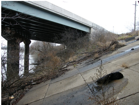
Photograph D-64: On East Bank View Looking Downstream Approximate Location of Proposed Ramp C5 Bridge