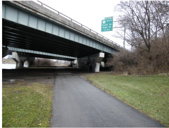
Photograph D-12: On East Bank at Approximate Location of Photographs D-3 and D-4