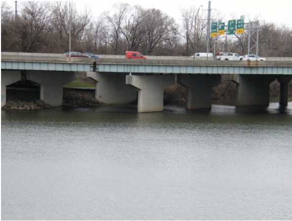
Photograph D-32: View from West Bank Looking Eastward Approximate Location of Proposed Ramp C5 Bridge