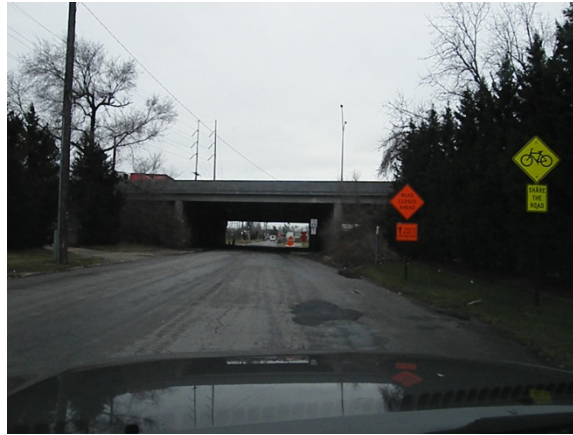
Photograph D-56: On East Bank at Approximate Location of Photographs D-3 and D-4