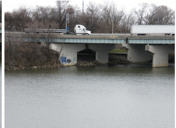
Photograph D-31: On East Bank Flap Gate on Storm Outlet Approximate Location of Proposed Ramp C5 Bridge