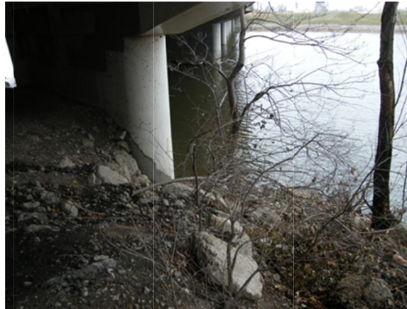
Photograph D-25: On East Bank View Looking Upstream Approximate Location of Proposed Ramp C5 Bridge