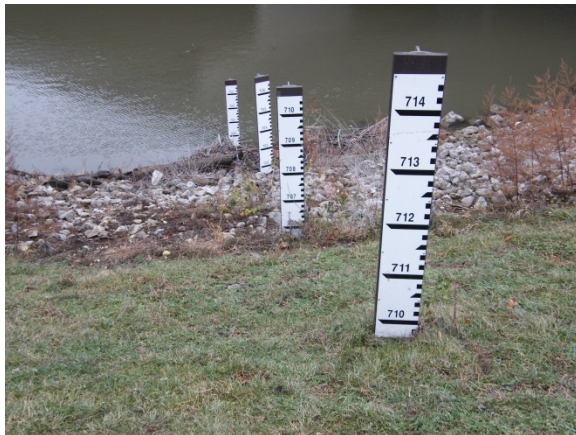
Photograph D-84: On East Bank View Looking Downstream Approximate Location of Proposed Ramp C5 Bridge