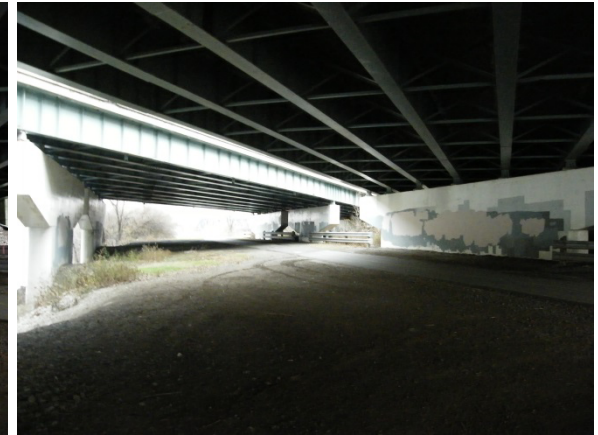
Photograph D-15: On East Bank Flap Gate on Storm Outlet Approximate Location of Proposed Ramp C5 Bridge