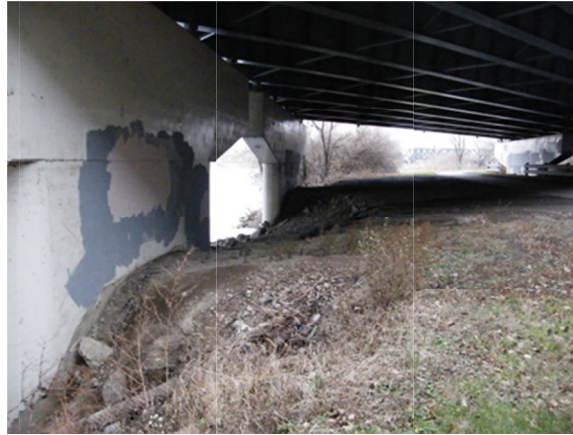
Photograph D-22: On East Bank at Approximate Location of Photographs D-3 and D-4