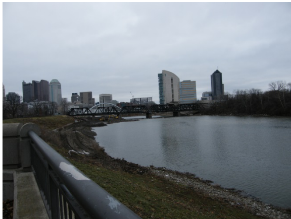
Photograph D-90: On East Bank View Looking Downstream Approximate Location of Proposed Ramp C5 Bridge