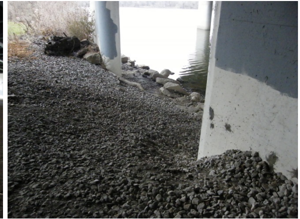
Photograph D-18: On East Bank View Looking Downstream Approximate Location of Proposed Ramp C5