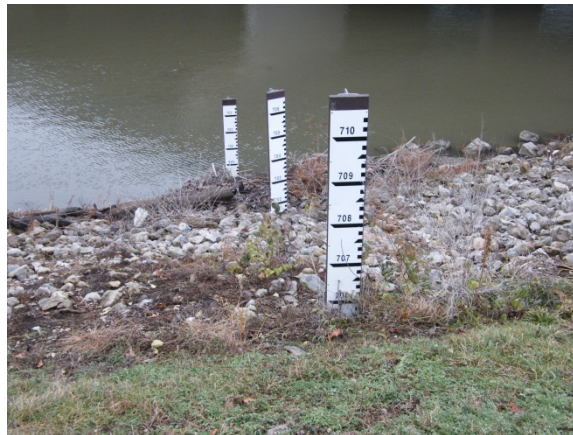
Photograph D-85: On East Bank View Looking Upstream Approximate Location of Proposed Ramp C5 Bridge