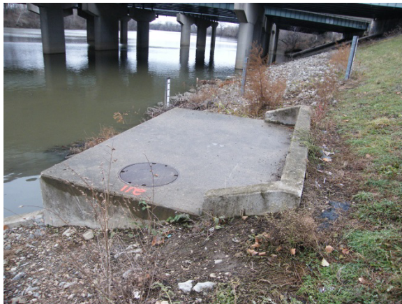
Photograph D-78: On East Bank View Looking Downstream Approximate Location of Proposed Ramp C5 Bridge