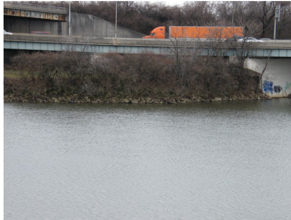
Photograph D-30: On East Bank View Looking Upstream Approximate Location of Proposed Ramp C5 Bridge