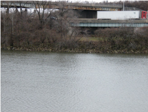
Photograph D-29: On East Bank View Looking Downstream Approximate Location of Proposed Ramp C5 Bridge