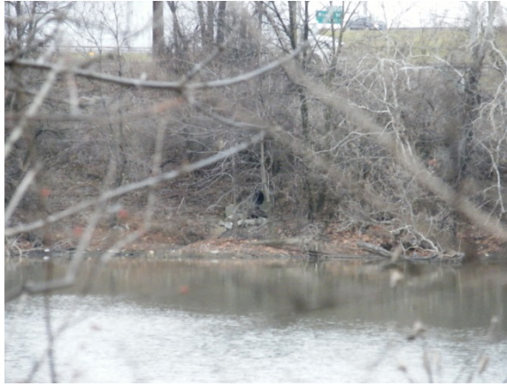
Photograph D-60: On East Bank at Approximate Location of Photographs D-3 and D-4