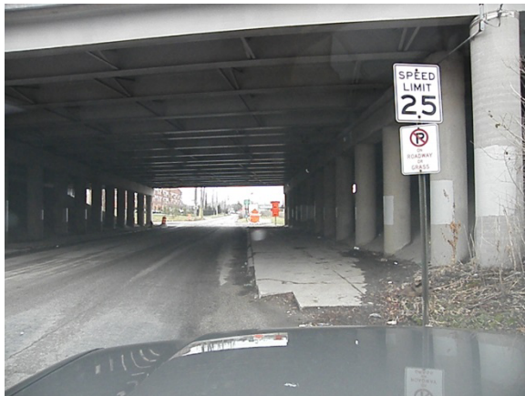
Photograph D-58: On East Bank View Looking Downstream Approximate Location of Proposed Ramp C5 Bridge