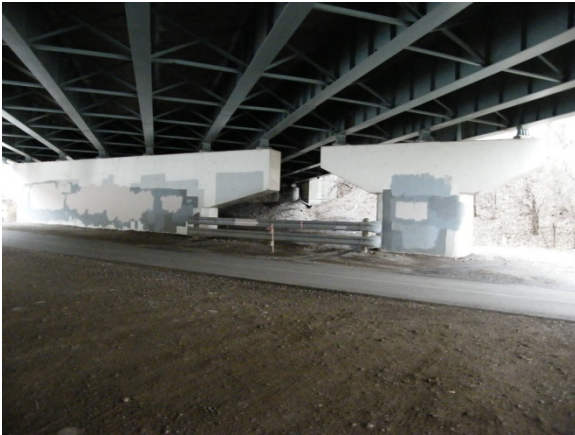
Photograph D-13: On East Bank View Looking Downstream Approximate Location of Proposed Ramp C5 Bridge