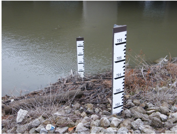
Photograph D-87: View from West Bank Looking Eastward Approximate Location of Proposed Ramp C5 Bridge