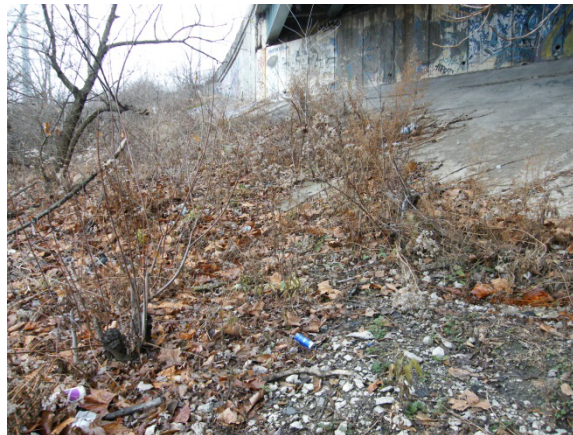
Photograph D-71: On East Bank View Looking Upstream Approximate Location of Proposed Ramp C5 Bridge