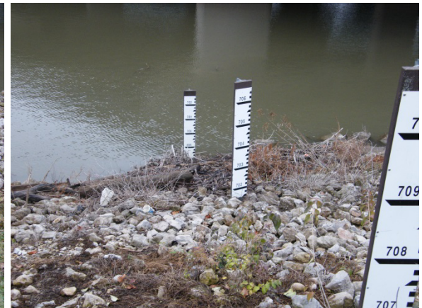
Photograph D-86: On East Bank Flap Gate on Storm Outlet Approximate Location of Proposed Ramp C5 Bridge