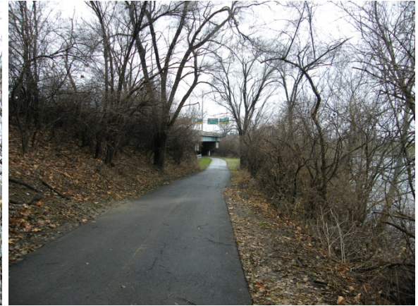
Photograph D-39: On East Bank at Approximate Location of Photographs D-3 and D-4