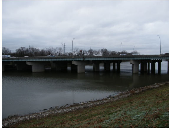
Photograph D-2: On East Bank at Approximate Location of Photographs D-3 and D-4