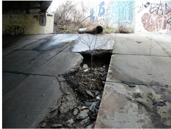
Photograph D-62: On East Bank at Approximate Location of Photographs D-3 and D-4