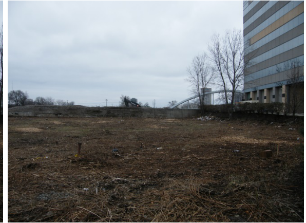
Photograph D-54: On East Bank Flap Gate on Storm Outlet Approximate Location of Proposed Ramp C5 Bridge