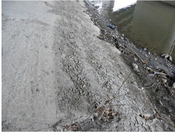
Photograph D-73: View from West Bank Looking Eastward Approximate Location of Proposed Ramp C5 Bridge