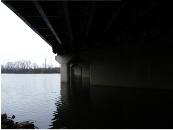
Photograph D-5: View from West Bank Looking Eastward Approximate Location of Proposed Ramp C5 Bridge