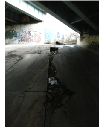
Photograph D-63: On East Bank Flap Gate on Storm Outlet Approximate Location of Proposed Ramp C5 Bridge