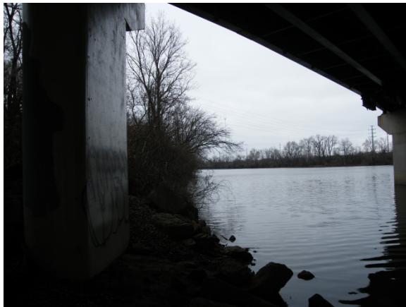
Photograph D-19: On East Bank View Looking Downstream Approximate Location of Proposed Ramp C5 Bridge