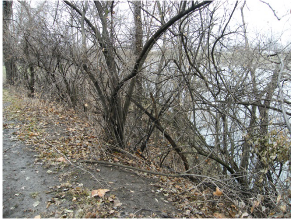
Photograph D-38: On East Bank at Approximate Location of Photographs D-3 and D-4