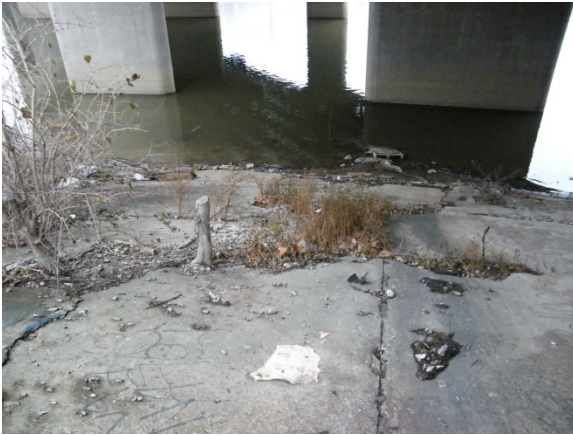
Photograph D-67: View from West Bank Looking Eastward Approximate Location of Proposed Ramp C5 Bridge