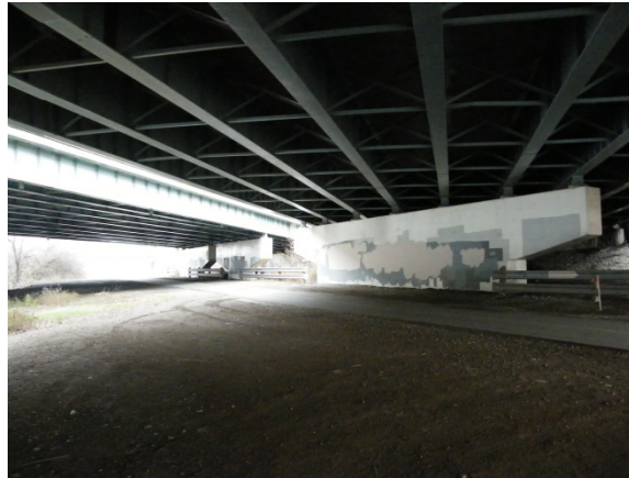
Photograph D-44: On East Bank View Looking Upstream Approximate Location of Proposed Ramp C5 Bridge