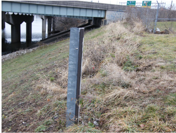
Photograph D-81: View from West Bank Looking Eastward Approximate Location of Proposed Ramp C5 Bridge