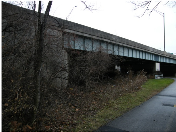
Photograph D-43: View from West Bank Looking Eastward Approximate Location of Proposed Ramp C5 Bridge