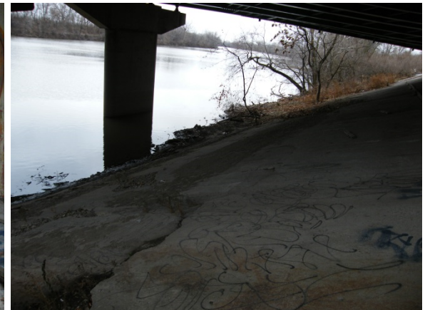
Photograph D-66: On East Bank Flap Gate on Storm Outlet Approximate Location of Proposed Ramp C5 Bridge