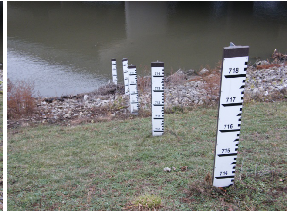
Photograph D-83: On East Bank at Approximate Location of Photographs D-3 and D-4