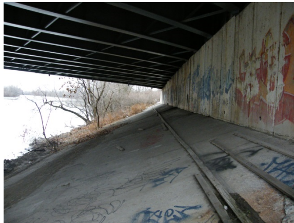
Photograph D-65: On East Bank View Looking Upstream Approximate Location of Proposed Ramp C5 Bridge