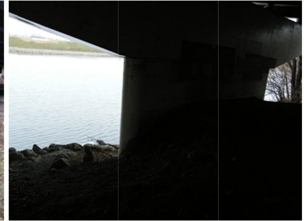
Photograph D-23: On East Bank Flap Gate on Storm Outlet Approximate Location of Proposed Ramp C5 Bridge