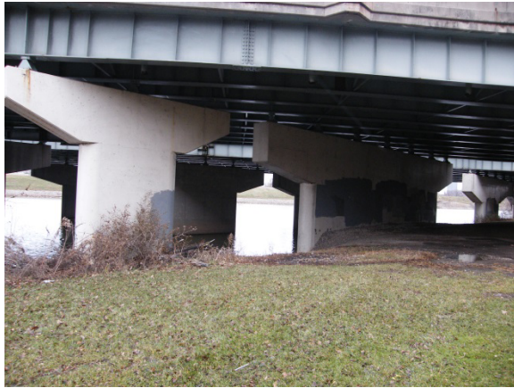
Photograph D-16: View from West Bank Looking Eastward Approximate Location of Proposed Ramp C5 Bridge