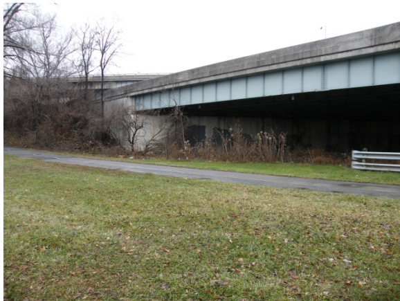
Photograph D-49: View from West Bank Looking Eastward Approximate Location of Proposed Ramp C5 Bridge