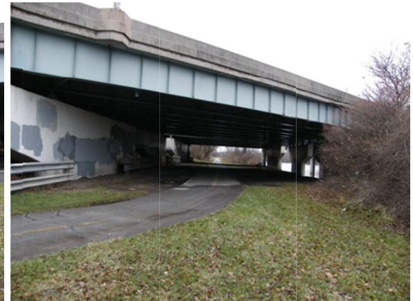
Photograph D-51: On East Bank Flap Gate on Storm Outlet Approximate Location of Proposed Ramp C5