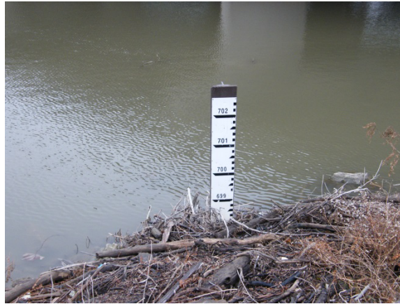
Photograph D-88: On East Bank at Approximate Location of Photographs D-3 and D-4