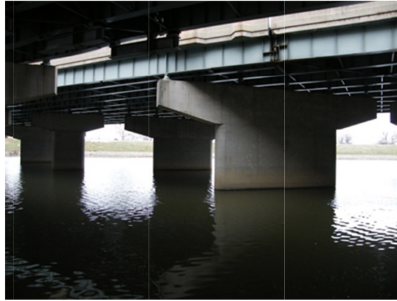
Photograph D-6: On East Bank at Approximate Location of Photographs D-3 and D-4