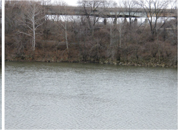
Photograph D-28: On East Bank View Looking Downstream Approximate Location of Proposed Ramp C5 Bridge