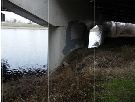
Photograph D-21: View from West Bank Looking Eastward Approximate Location of Proposed Ramp C5 Bridge