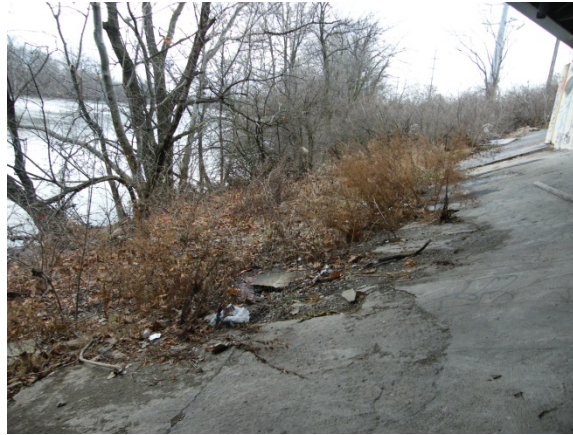
Photograph D-68: On East Bank at Approximate Location of Photographs D-3 and D-4