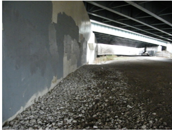
Photograph D-17: On East Bank at Approximate Location of Photographs D-3 and D-4