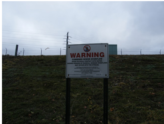
Photograph D-79: On East Bank View Looking Upstream Approximate Location of Proposed Ramp C5 Bridge