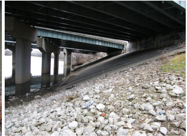
Photograph D-89: On East Bank at Approximate Location of Photographs D-3 and D-4