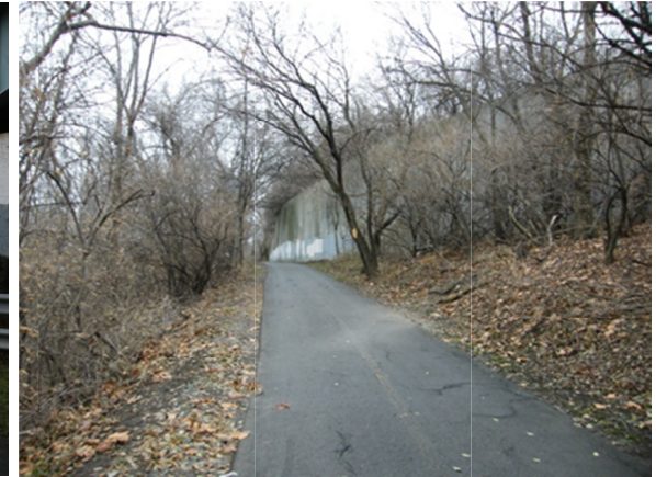
Photograph D-45: On East Bank at Approximate Location of Photographs D-3 and D-4