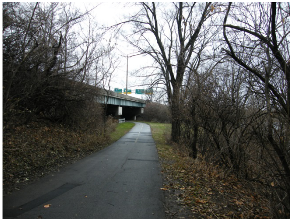
Photograph D-41: On East Bank View Looking Upstream Approximate Location of Proposed Ramp C5 Bridge