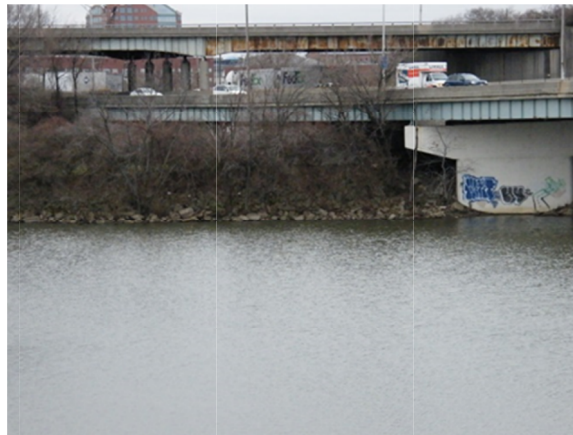
Photograph D-36: On East Bank View Looking Upstream Approximate Location of Proposed Ramp C5 Bridge