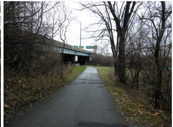
Photograph D-42: On East Bank Flap Gate on Storm Outlet Approximate Location of Proposed Ramp C5 Bridge