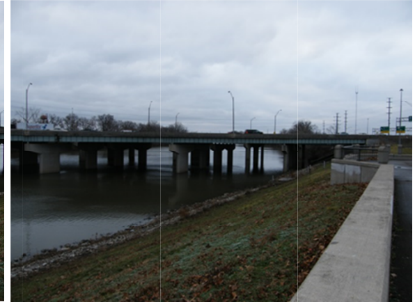
Photograph D-3: On East Bank Flap Gate on Storm Outlet Approximate Location of Proposed Ramp C5 Bridge