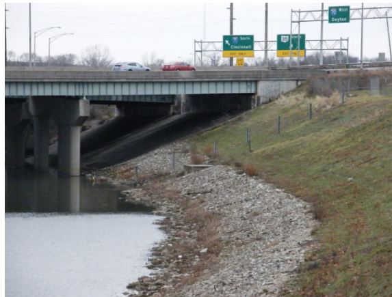
Photograph D-91: On East Bank View Looking Upstream Approximate Location of Proposed Ramp C5 Bridge