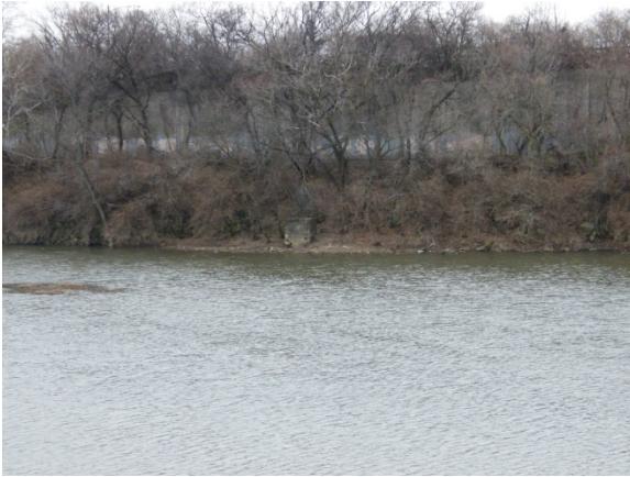
Photograph D-26: View from West Bank Looking Eastward Approximate Location of Proposed Ramp C5 Bridge