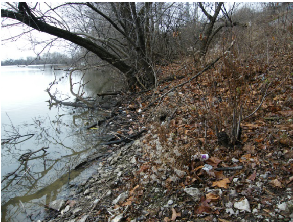
Photograph D-70: On East Bank View Looking Downstream Approximate Location of Proposed Ramp C5 Bridge