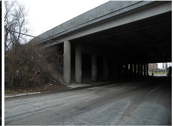
Photograph D-57: On East Bank Flap Gate on Storm Outlet Approximate Location of Proposed Ramp C5 Bridge