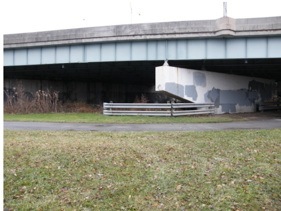
Photograph D-50: On East Bank at Approximate Location of Photographs D-3 and D-4