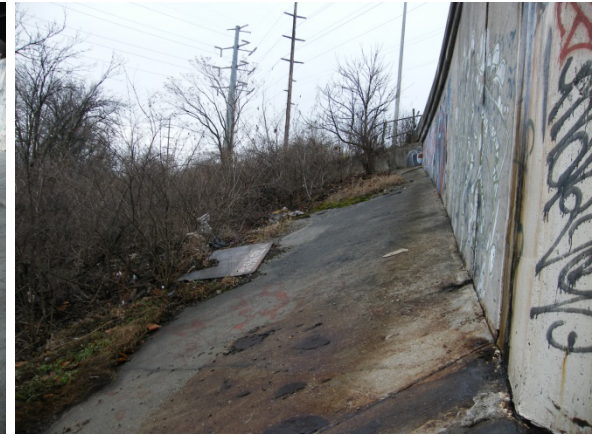
Photograph D-69: On East Bank Flap Gate on Storm Outlet Approximate Location of Proposed Ramp C5 Bridge