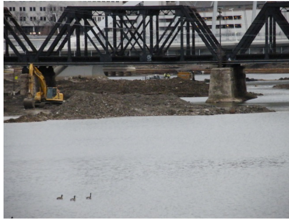
Photograph D-9: On East Bank at Approximate Location of Photographs D-3 and D-4