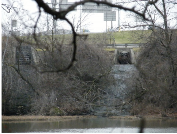
Photograph D-59: View from West Bank Looking Eastward Approximate Location of Proposed Ramp C5 Bridge