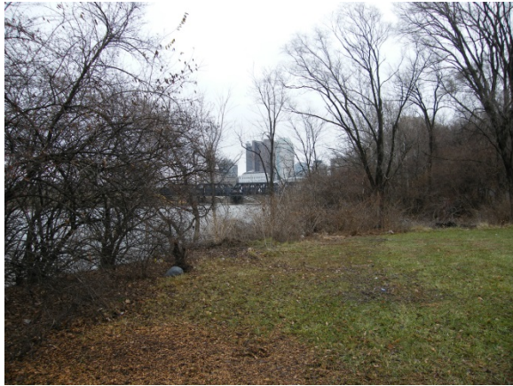
Photograph D-46: On East Bank View Looking Downstream Approximate Location of Proposed Ramp C5 Bridge