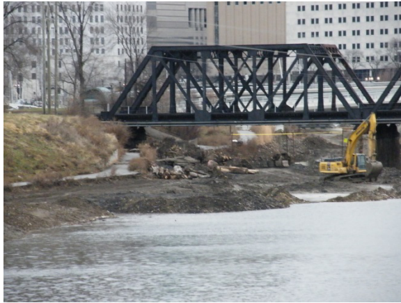
Photograph D-8: View from West Bank Looking Eastward Approximate Location of Proposed Ramp C5 Bridge