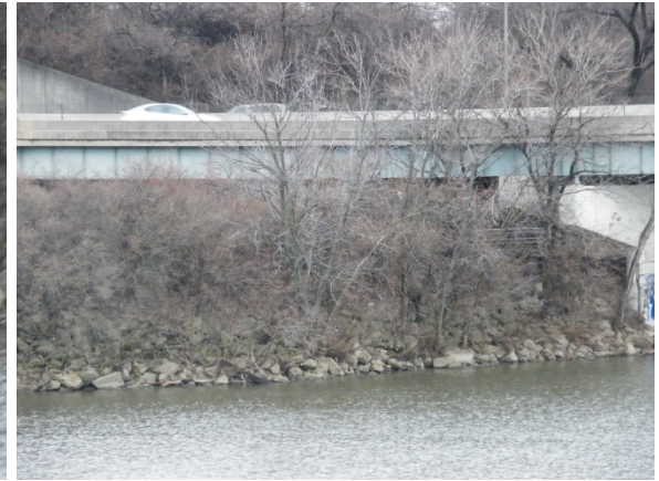
Photograph D-34: On East Bank View Looking Downstream Approximate Location of Proposed Ramp C5 Bridge