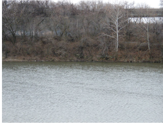
Photograph D-27: On East Bank at Approximate Location of Photographs D-3 and D-4