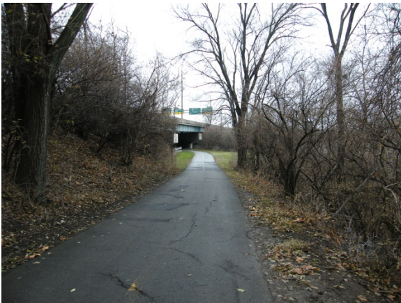
Photograph D-40: On East Bank View Looking Downstream Approximate Location of Proposed Ramp C5 Bridge