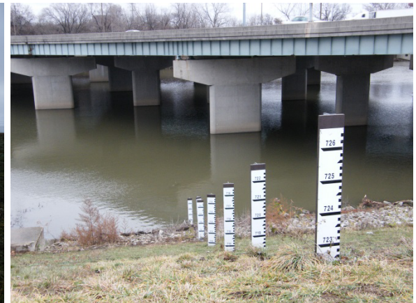
Photograph D-80: On East Bank Flap Gate on Storm Outlet Approximate Location of Proposed Ramp C5 Bridge