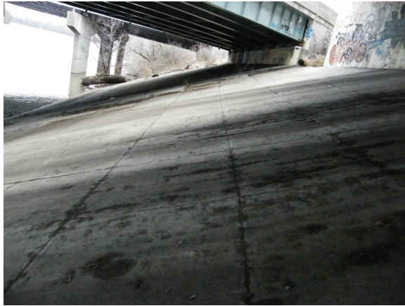
Photograph D-61: View from West Bank Looking Eastward Approximate Location of Proposed Ramp C5 Bridge