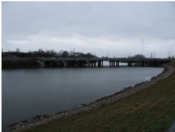
Photograph D-4: On East Bank View Looking Downstream Approximate Location of Proposed Ramp C5 Bridge

Note: All photographs are available on the CD-ROM / DVD for closer viewing.