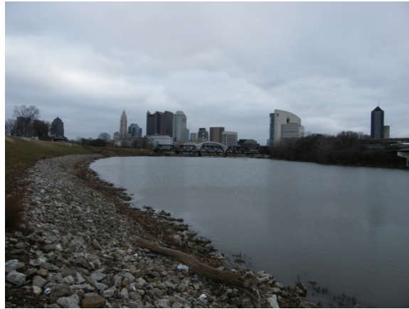
Photograph D-76: On East Bank at Approximate Location of Photographs D-3 and D-4