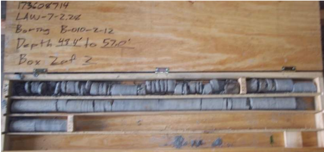
Figure 5 – Boring B-010-2-12, Box 2 of 2. Depth 48.4' to 57.0'.