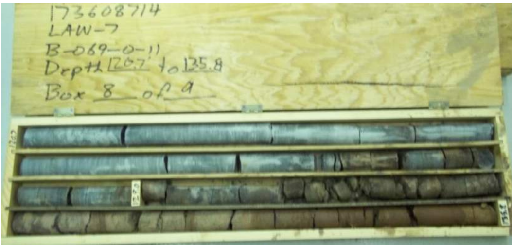
Figure 50 – Boring B-069-0-11, Box 8 of 9. Depth 120.7' to 135.8'.