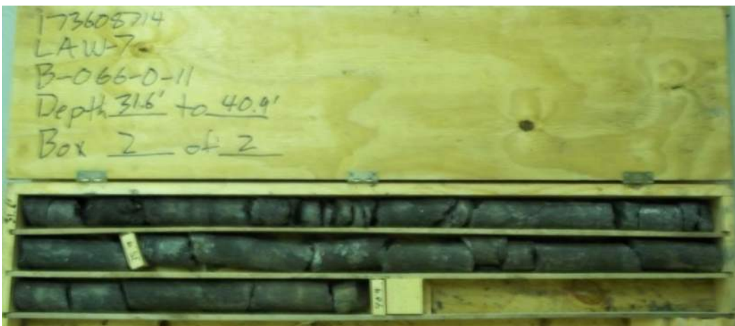
Figure 42 – Boring B-066-0-11, Box 2 of 2. Depth 31.6' to 40.9'.