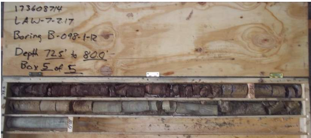
Figure 78 – Boring B-098-1-12, Box 5 of 5. Depth 72.5' to 80.0'.