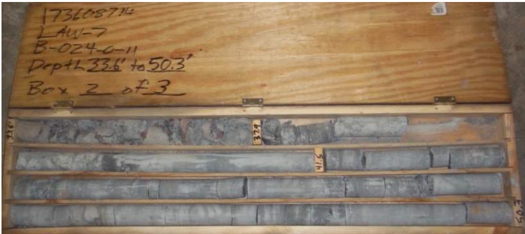
Figure 7 – Boring B-024-0-11, Box 2 of 3. Depth 33.6' to 50.3'.