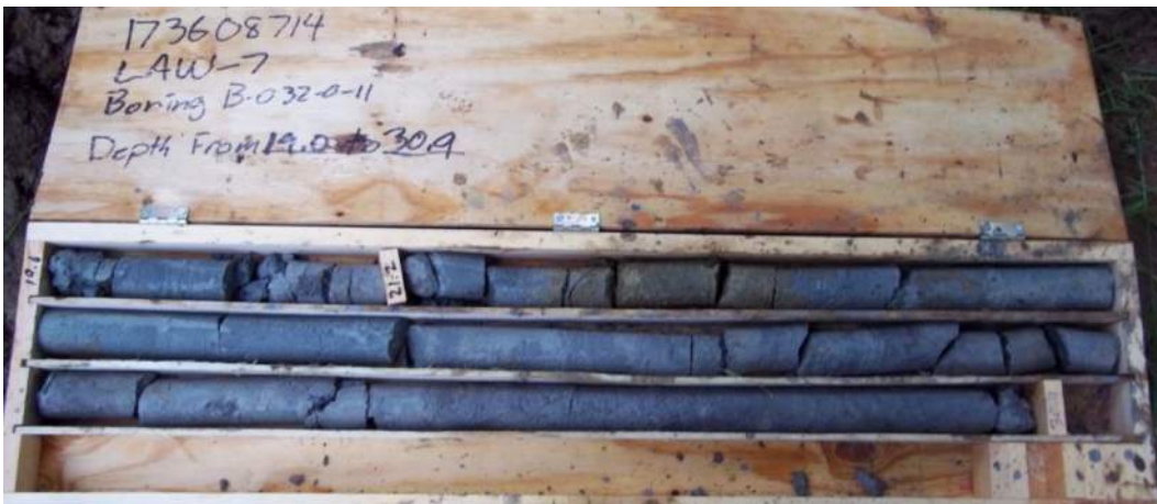
Figure 11 – Boring B-032-0-11, Box 1 of 1. Depth 19.0' to 30.9'.