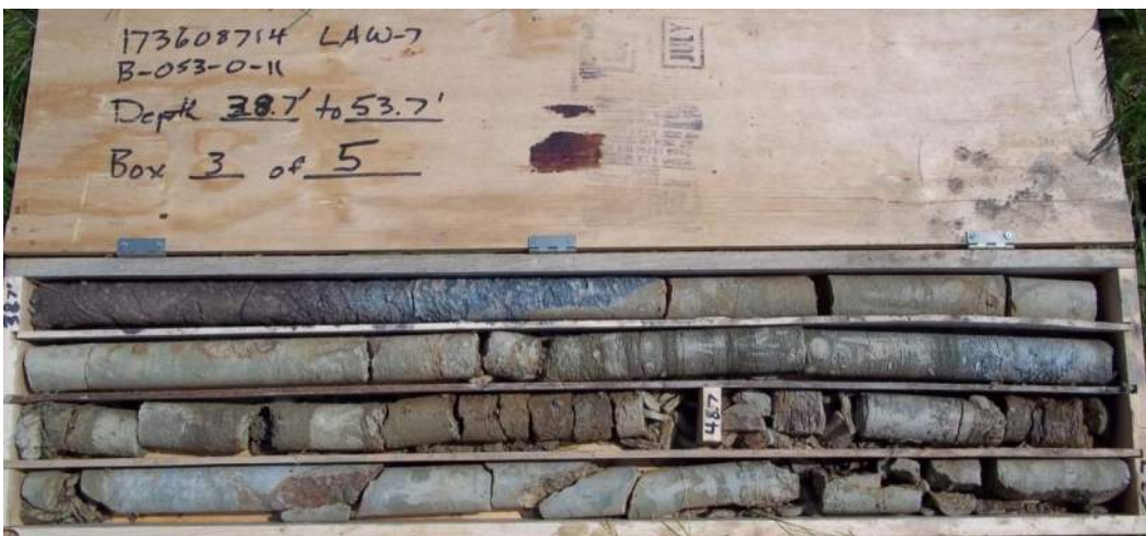
Figure 30 – Boring B-053-0-11, Box 3 of 5. Depth 38.7' to 53.7'.