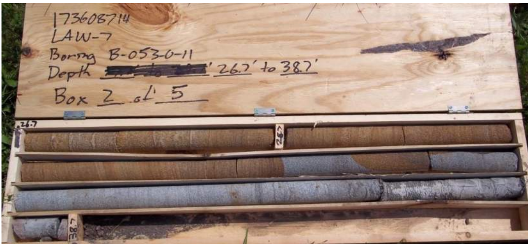
Figure 29 – Boring B-053-0-11, Box 2 of 5. Depth 26.7' to 38.7'.