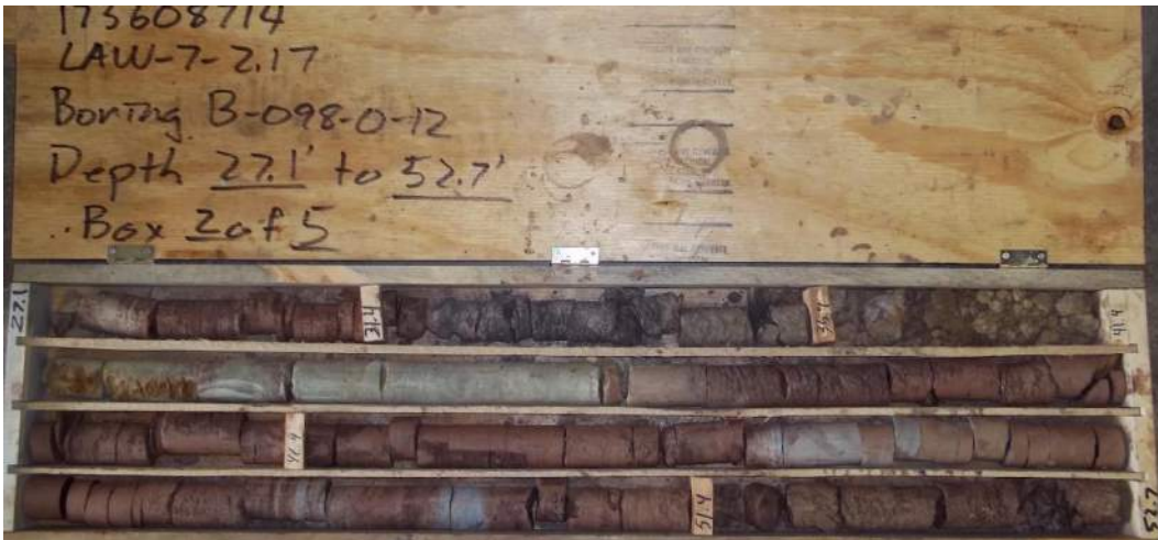
Figure 70 – Boring B-098-0-12, Box 2 of 5. Depth 27.1' to 52.7'.