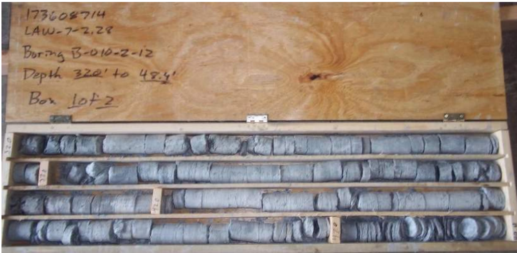
Figure 4 – Boring B-010-2-12, Box 1 of 2. Depth 32.0' to 48.4'.