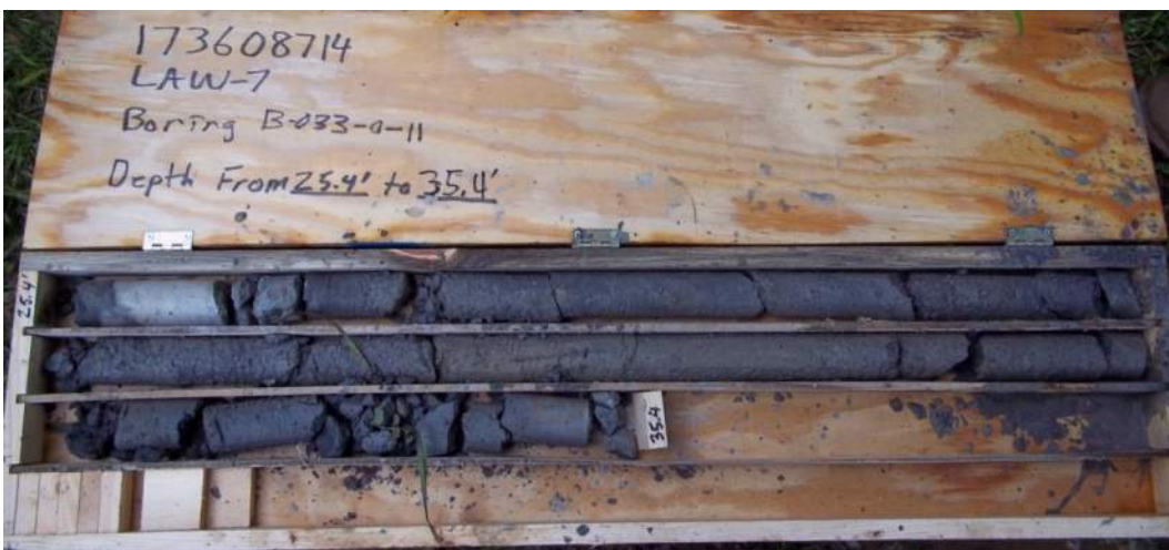
Figure 12 – Boring B-033-0-11, Box 1 of 1. Depth 25.4' to 35.4'.