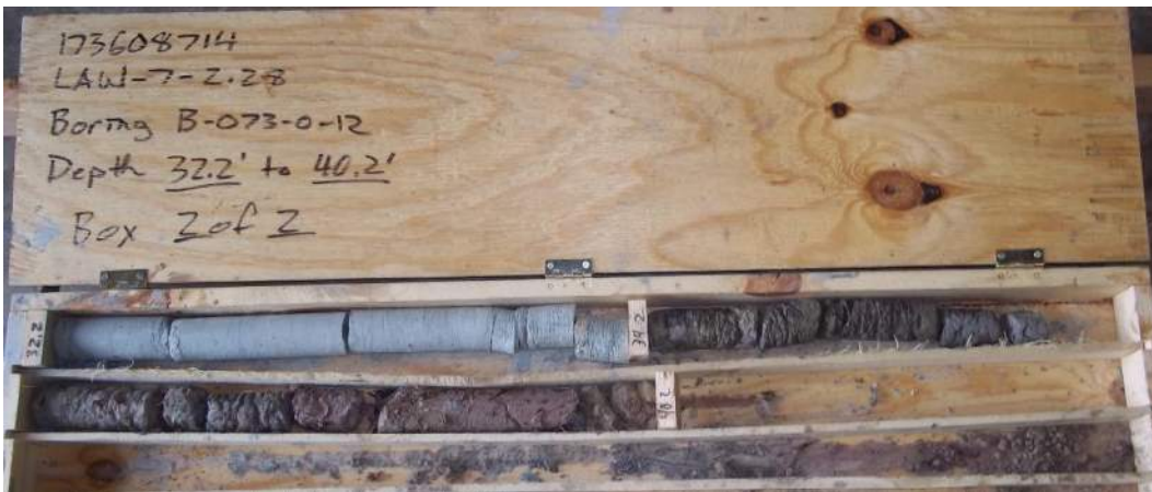
Figure 53 – Boring B-073-0-12, Box 2 of 2. Depth 32.2' to 40.2'.