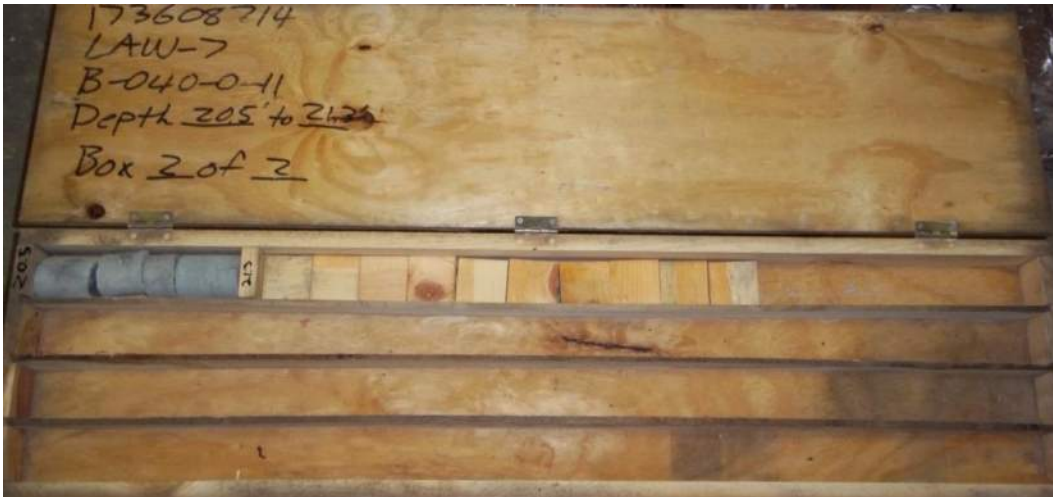
Figure 22 – Boring B-040-0-11, Box 2 of 2. Depth 20.5' to 21.3'.