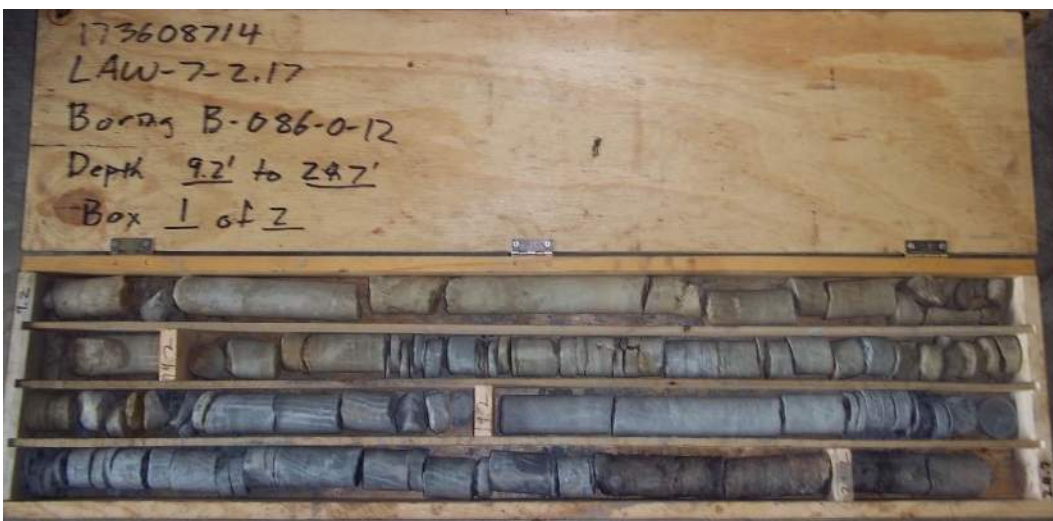
Figure 54 – Boring B-086-0-12, Box 1 of 2. Depth 9.2' to 24.7'.