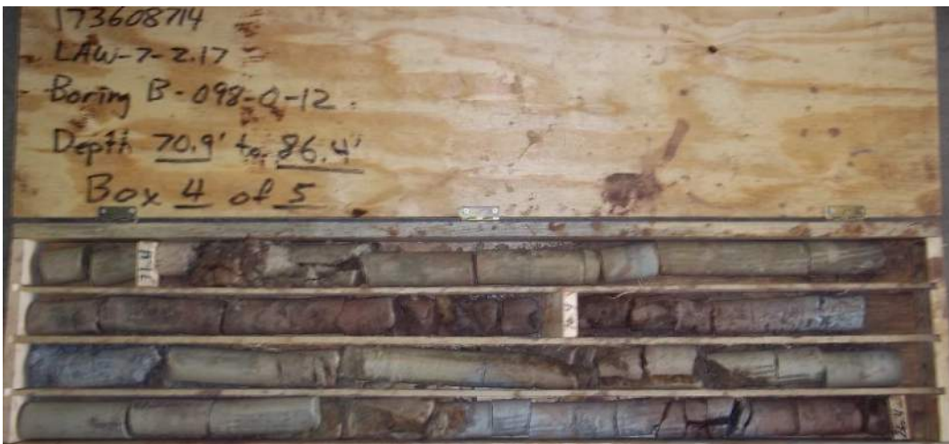
Figure 72 – Boring B-098-0-12, Box 4 of 5. Depth 70.9' to 86.4'.