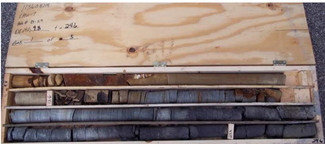
Figure 36 – Boring B-059-0-11, Box 1 of 5. Depth 9.8' to 24.6'.