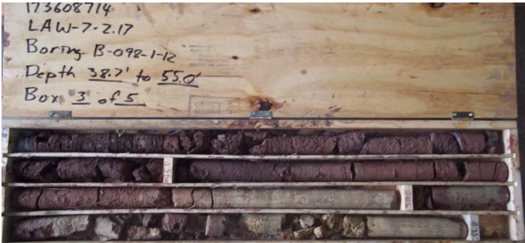
Figure 76 – Boring B-098-1-12, Box 3 of 5. Depth 38.7' to 55.0'.