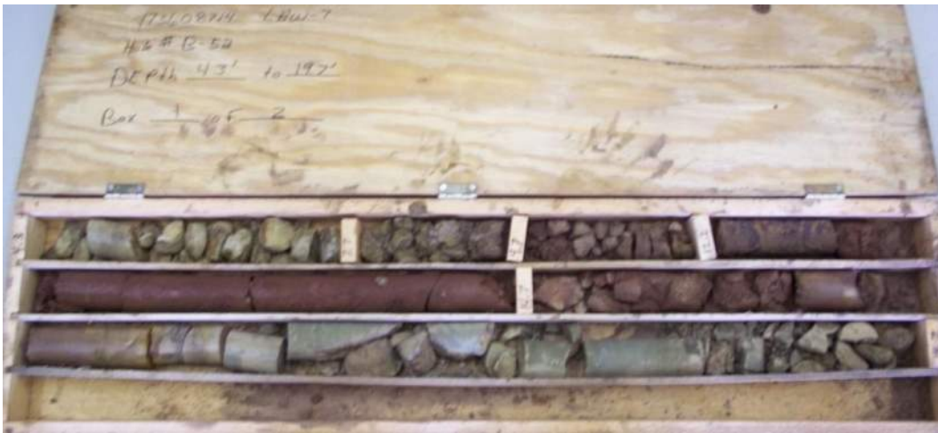
Figure 26 – Boring B-052-0-11, Box 1 of 2. Depth 4.3' to 19.7'.