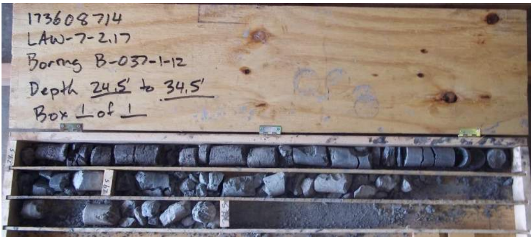
Figure 17 – Boring B-037-1-12, Box 1 of 1. Depth 24.5' to 34.5'.