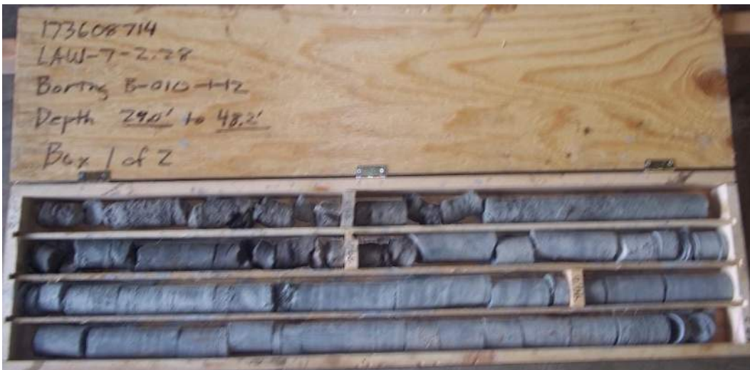
Figure 2 – Boring B-010-1-12, Box 1 of 2. Depth 29.0' to 48.2'.