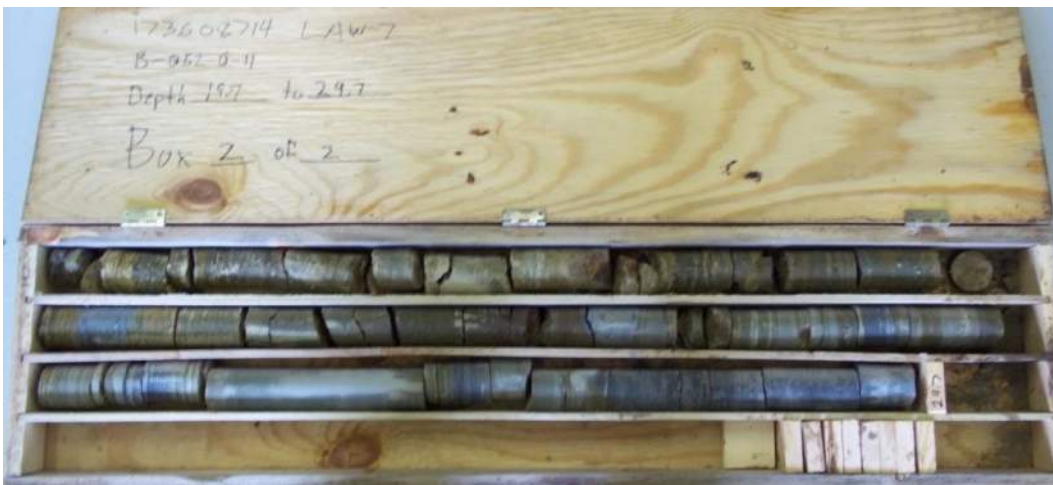
Figure 27 – Boring B-052-0-11, Box 2 of 2. Depth 19.7' to 29.7'.