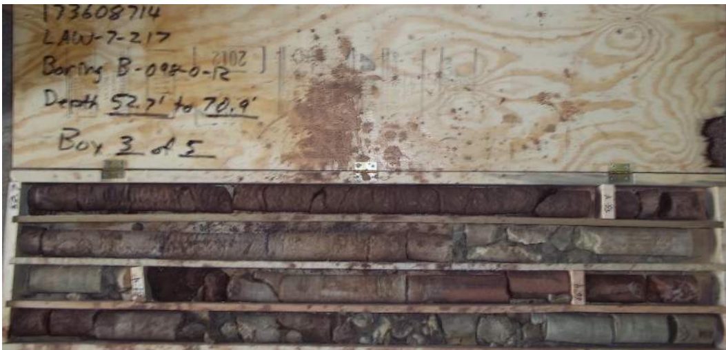
Figure 71 – Boring B-098-0-12, Box 3 of 5. Depth 52.7' to 70.9'.