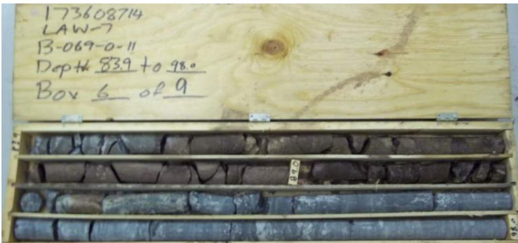
Figure 48 – Boring B-069-0-11, Box 6 of 9. Depth 83.9' to 98.0'.