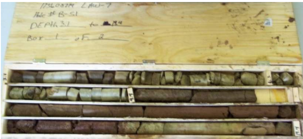
Figure 24 – Boring B-051-0-11, Box 1 of 2. Depth 3.1' to 19.4'.