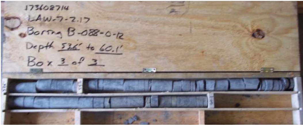
Figure 65 – Boring B-088-0-12, Box 3 of 3. Depth 53.6' to 60.1'.