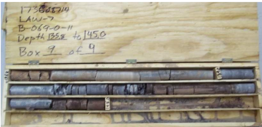
Figure 51 – Boring B-069-0-11, Box 9 of 9. Depth 135.8' to 145.0'.