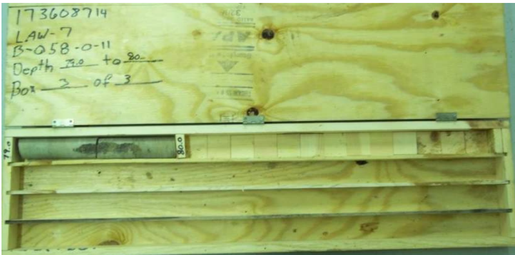
Figure 35 – Boring B-058-0-11, Box 3 of 3. Depth 79.0' to 80.0'.