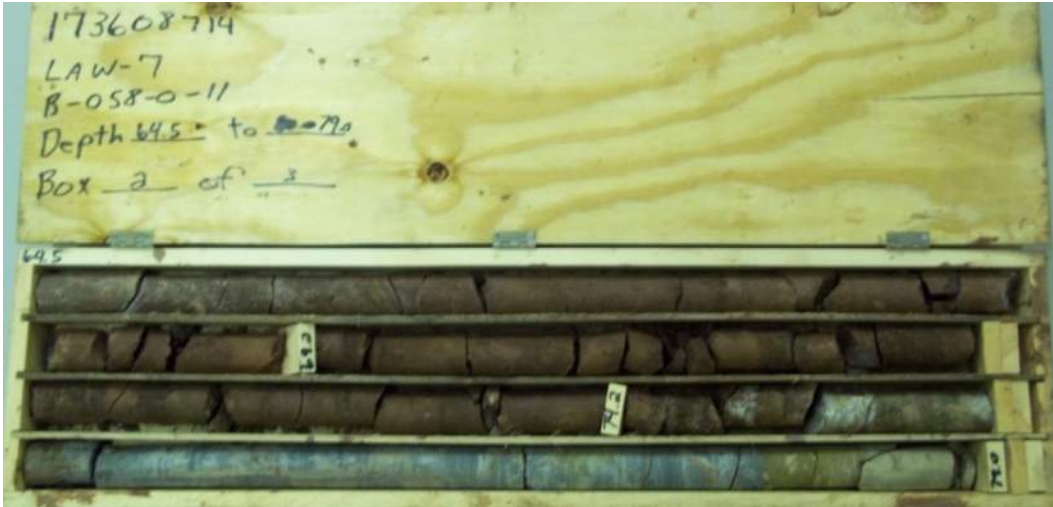
Figure 34 – Boring B-058-0-11, Box 2 of 3. Depth 64.5' to 79.0'.