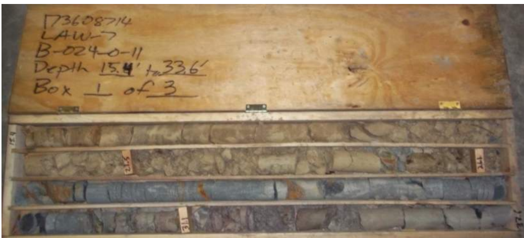
Figure 6 – Boring B-024-0-11, Box 1 of 3. Depth 15.4' to 33.6'.