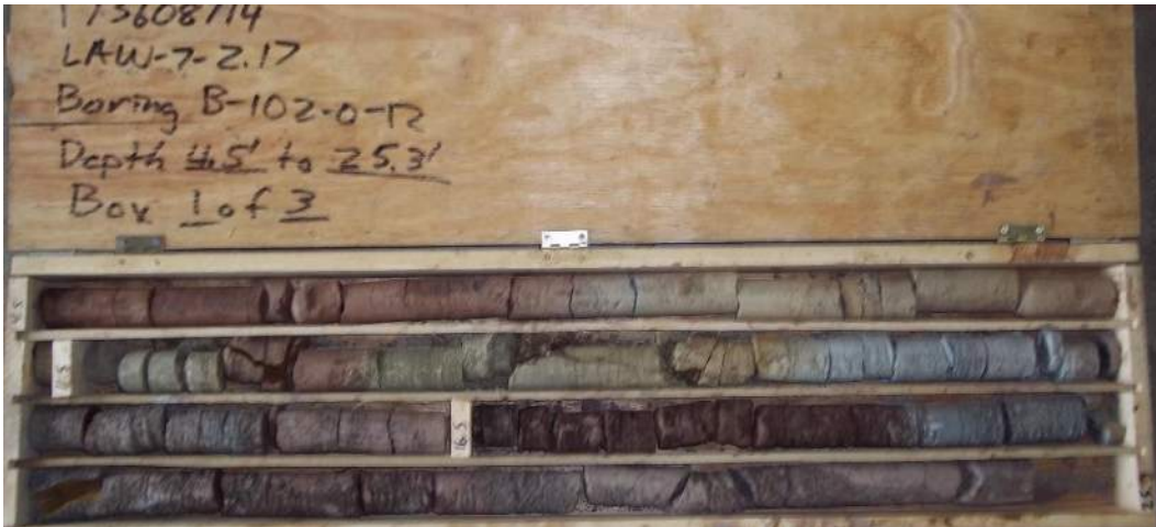
Figure 79 – Boring B-102-0-12, Box 1 of 3. Depth 4.5' to 25.3'.