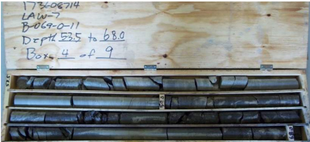
Figure 46 – Boring B-069-0-11, Box 4 of 9. Depth 53.5' to 68.0'.