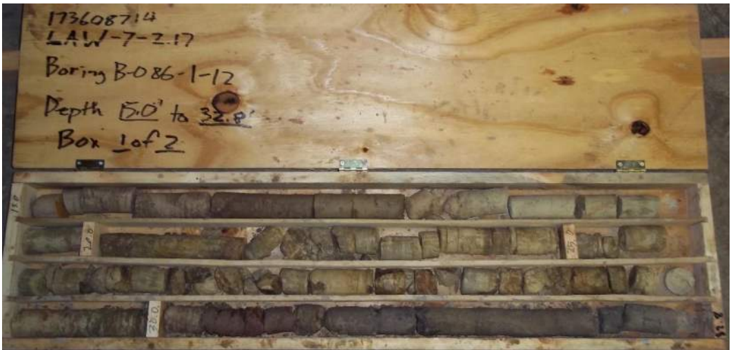
Figure 56 – Boring B-086-1-12, Box 1 of 2. Depth 15.0' to 32.8'.