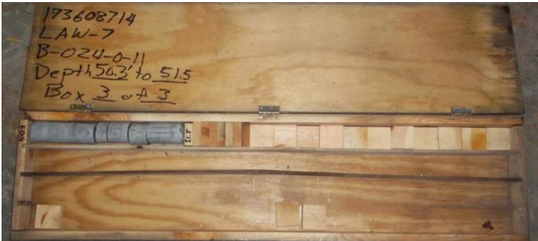
Figure 8 – Boring B-024-0-11, Box 3 of 3. Depth 50.3' to 51.5'.