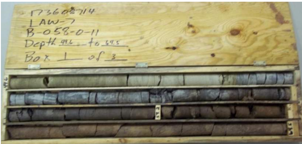
Figure 33 – Boring B-058-0-11, Box 1 of 3. Depth 49.6' to 64.5'.