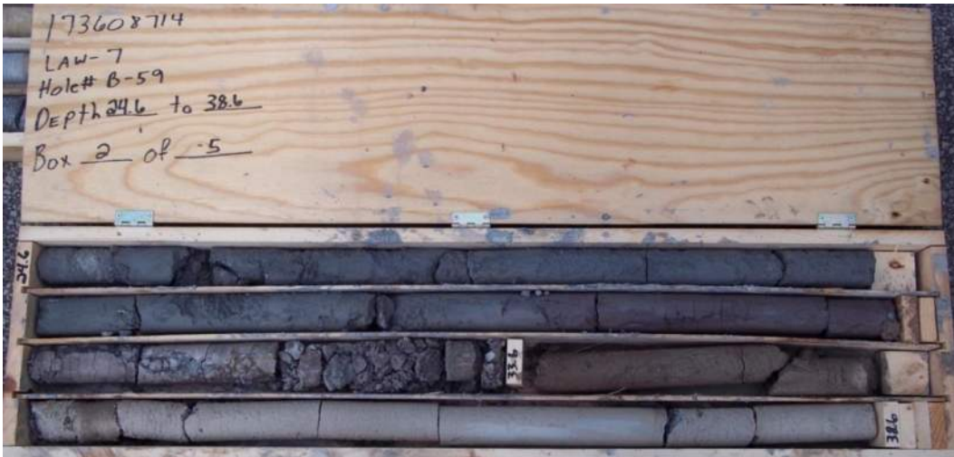
Figure 37 – Boring B-059-0-11, box 2 of 5. Depth 24.6' to 38.6'.