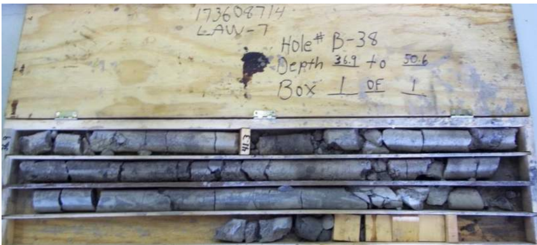
Figure 18 – Boring B-038-0-11, Box 1 of 1. Depth 36.9' to 50.6'.