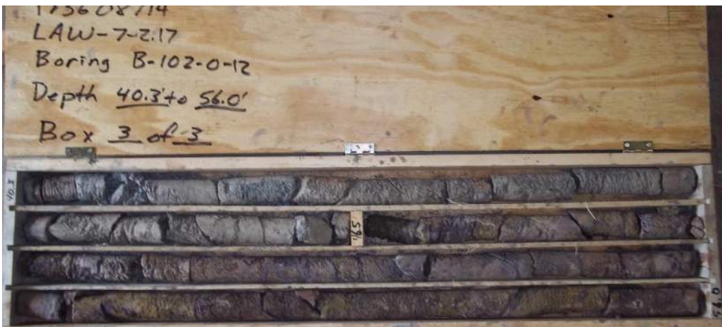
Figure 81 – Boring B-102-0-12, Box 3 of 3. Depth 40.3' to 56.0'.