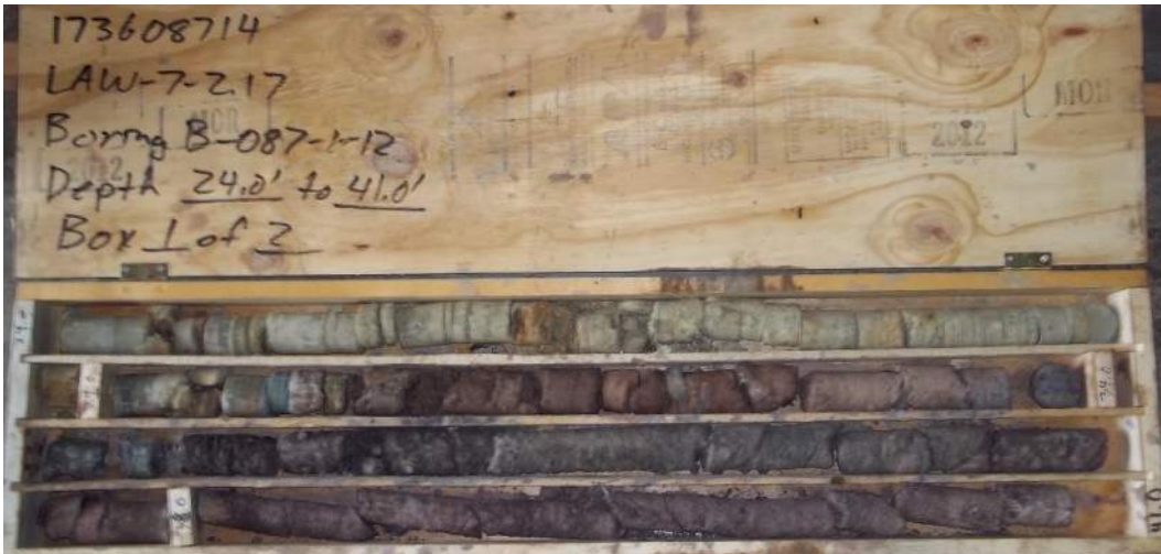
Figure 61 – Boring B-087-1-12, Box 1 of 2. Depth 24.0' to 41.0'.