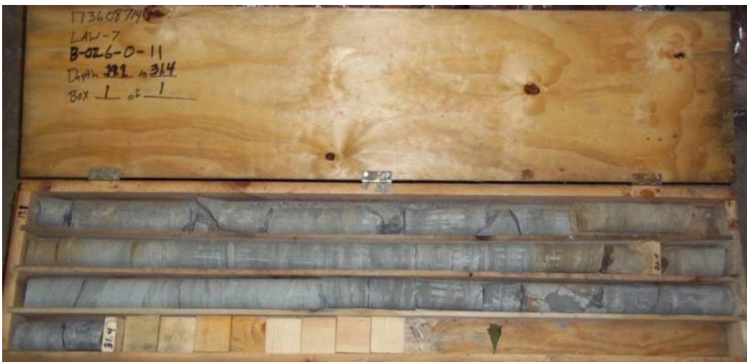
Figure 9 – Boring B-026-0-11, Box 1 of 1. Depth 19.1' to 31.4'.