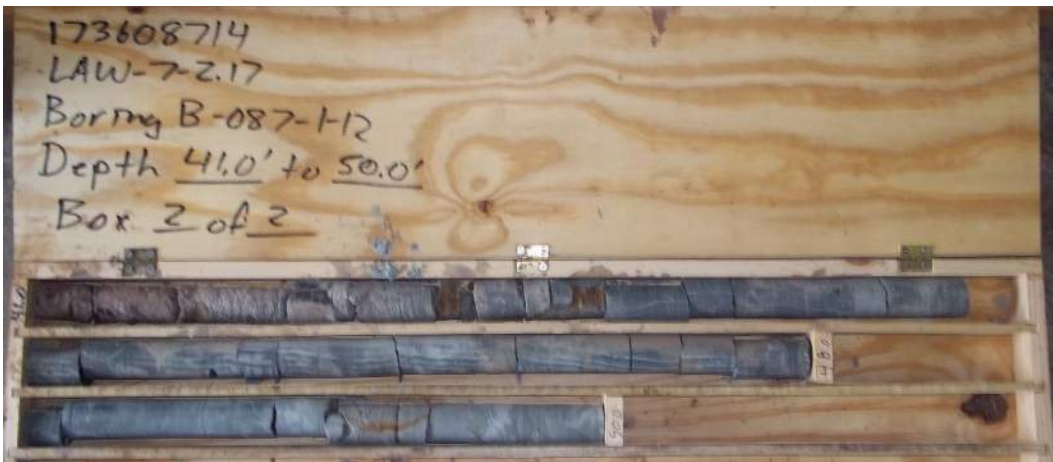
Figure 62 – Boring B-087-1-12, Box 2 of 2. Depth 41.0' to 50.0'.