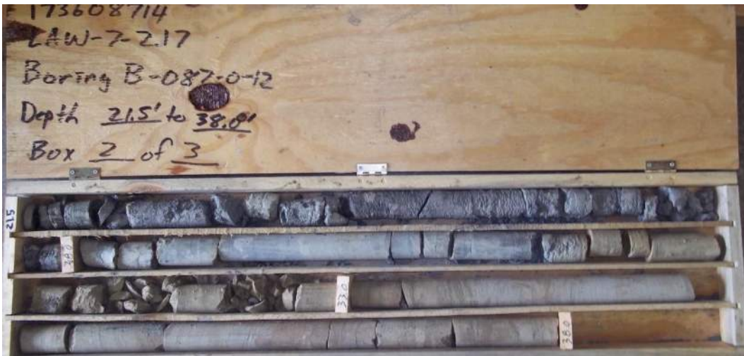
Figure 59 – Boring B-087-0-12, Box 2 of 3. Depth 21.5' to 38.0'.