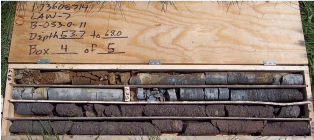
Figure 31 – Boring B-053-0-11, Box 4 of 5. Depth 53.7' to 68.0'.