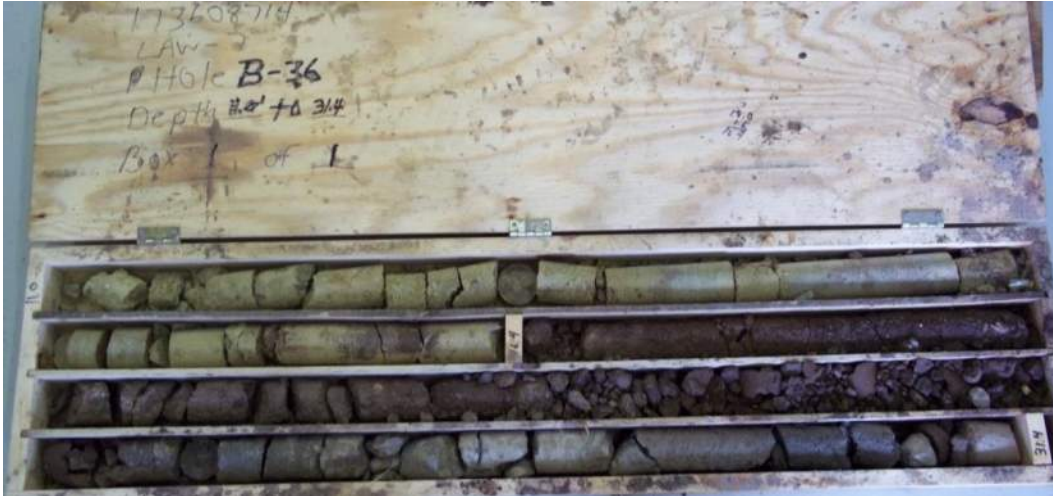
Figure 16 – Boring B-036-0-11, Box 1 of 1. Depth 11.0' to 31.4'.