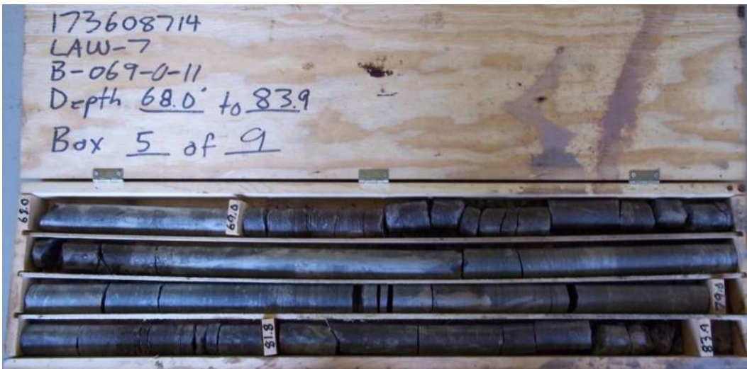
Figure 47 – Boring B-069-0-11, Box 5 of 9. Depth 68.0' to 83.9'.