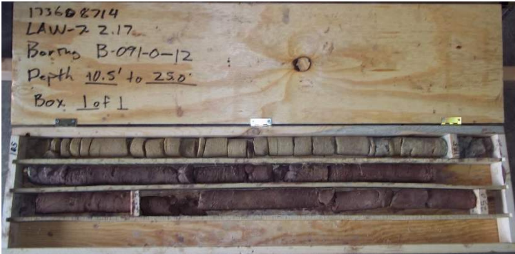
Figure 66 – Boring B-091-0-12, Box 1 of 1. Depth 10.5' to 25.0'.