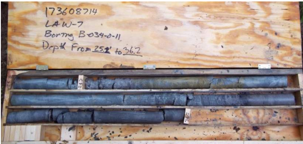
Figure 14 – Boring B-034-0-11, Box 1 of 1. Depth 25.2' to 36.2'.