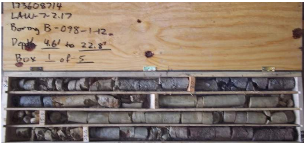
Figure 74 – Boring B-098-1-12, Box 1 of 5. Depth 4.6' to 22.8'.