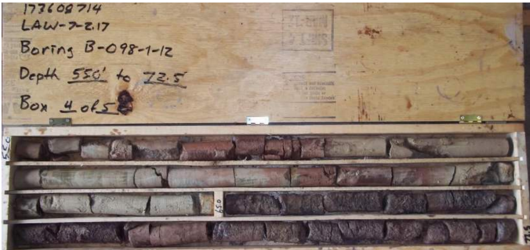
Figure 77 – Boring B-098-1-12, Box 4 of 5. Depth 55.0' to 72.5'.