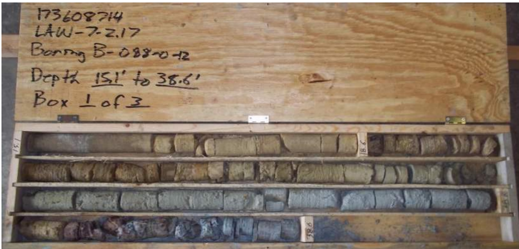
Figure 63 – Boring B-088-0-12, Box 1 of 3. Depth 15.1' to 38.6'.