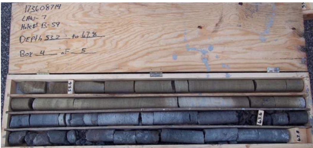
Figure 39 – Boring B-059-0-11, Box 4 of 5. Depth 53.2' to 67.8'.