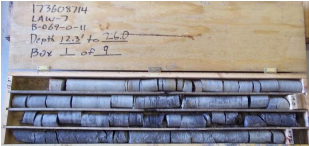
Figure 43 – Boring B-069-0-11, Box 1 of 9. Depth 12.3' to 26.0'.