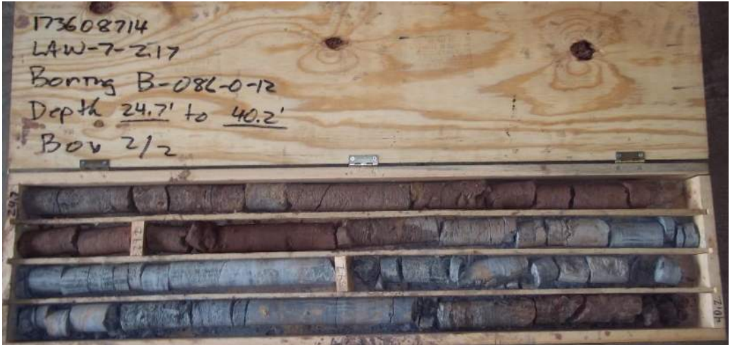
Figure 55 – Boring B-086-0-12, Box 2 of 2. Depth 24.7' to 40.2'.