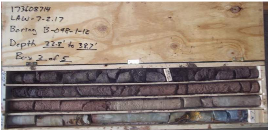
Figure 75 – Boring B-098-1-12, Box 2 of 5. Depth 22.8' to 38.7'.