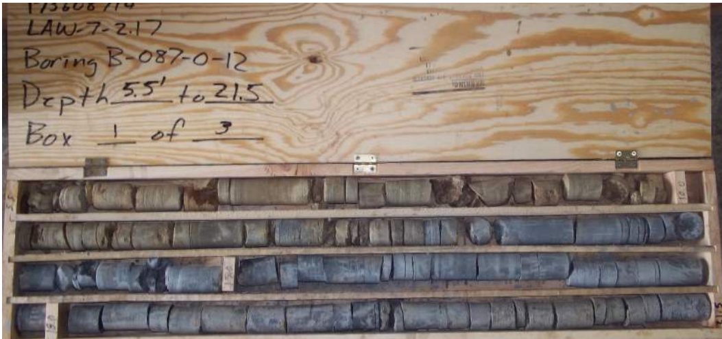
Figure 58 – Boring B-087-0-12, Box 1 of 3. Depth 5.5' to 21.5'.