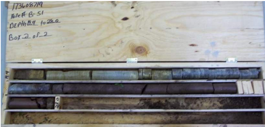
Figure 25 – Boring B-051-0-11, Box 2 of 2. Depth 19.4' to 28.0'.