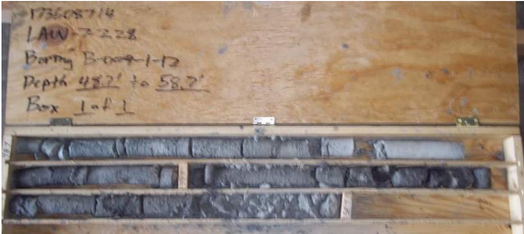
Figure 1 – Boring B-009-1-12, Box 1 of 1. Depth 48.7' to 58.7'.