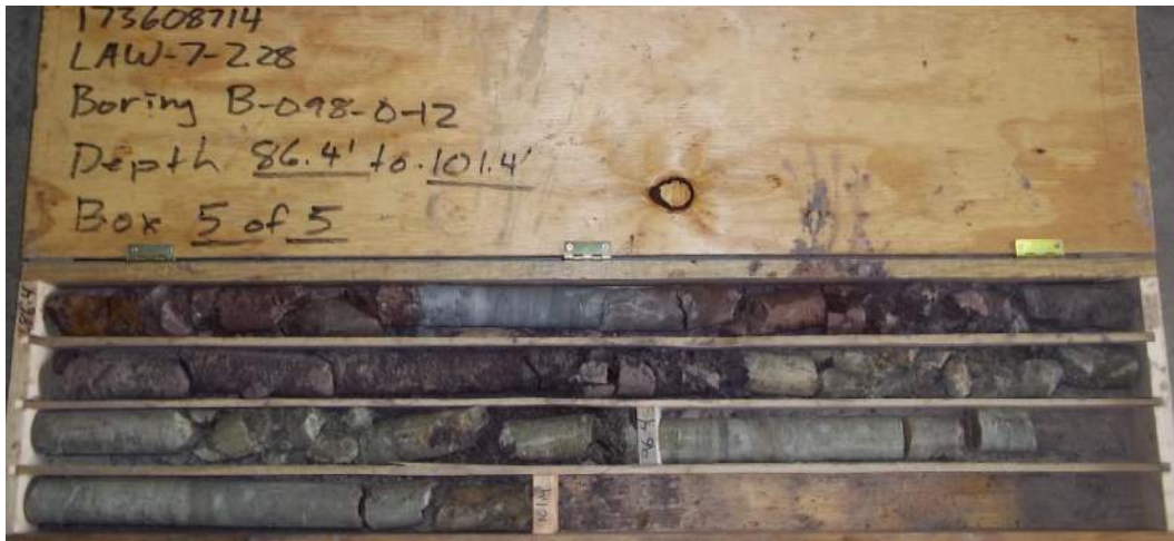
Figure 73 – Boring B-098-0-12, Box 5 of 5. Depth 86.4' to 101.4'.