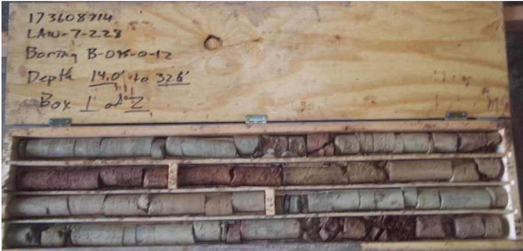
Figure 67 – Boring B-095-0-12, Box 1 of 2. Depth 14.0' to 32.6'.