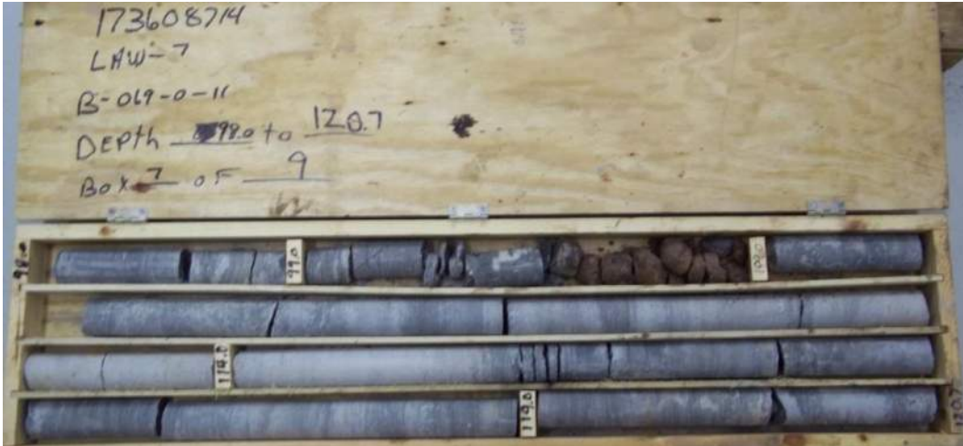
Figure 49 – Boring B-069-0-11, Box 7 of 9. Depth 98.0' to 120.7'.