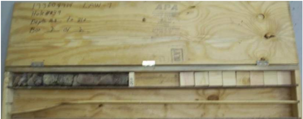
Figure 20 – Boring B-039-0-11, Box 2 of 2. Depth 18.8' to 21.0'.