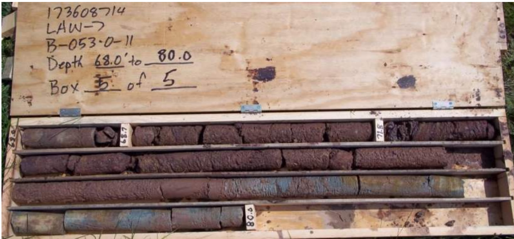
Figure 32 – Boring B-053-0-11, Box 5 of 5. Depth 68.0' to 80.0'.