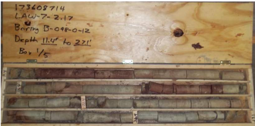
Figure 69 – Boring B-098-0-12, Box 1 of 5. Depth 11.4' to 27.1'.