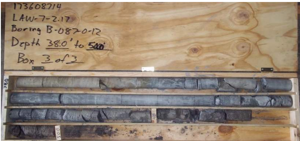
Figure 60 – Boring B-087-0-12, Box 3 of 3. Depth 38.0' to 50.0'.