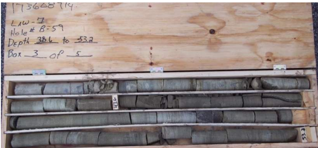
Figure 38 – Boring B-059-0-11, Box 3 of 5. Depth 38.6' to 53.2'.