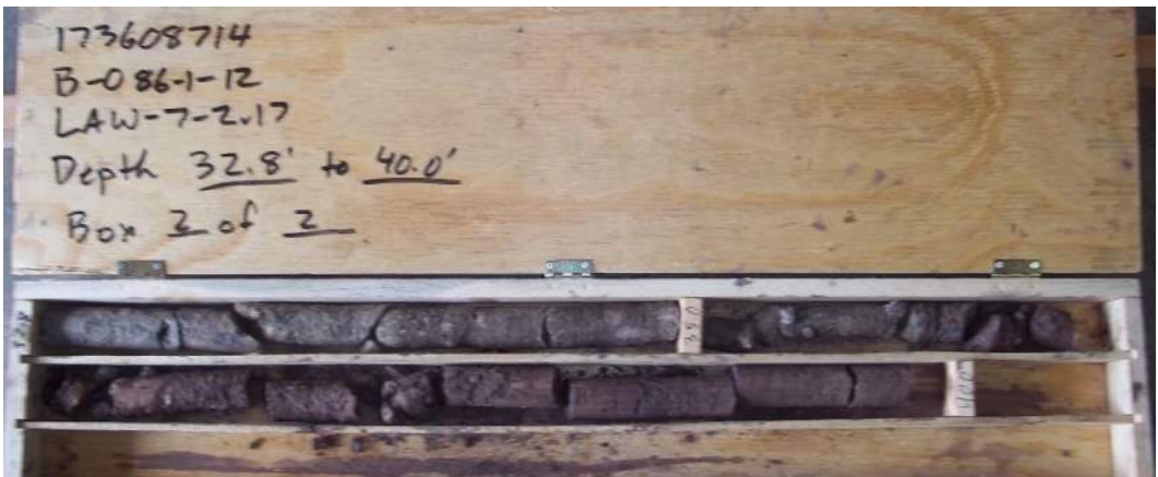
Figure 57 – Boring B-086-1-12, Box 2 of 2. Depth 32.8' to 40.0'.