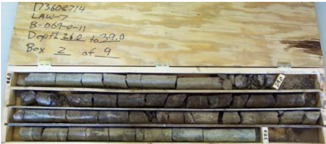
Figure 44 – Boring B-069-0-11, Box 2 of 9. Depth 26.0' to 39.0'.