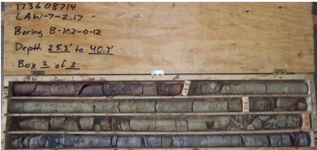
Figure 80 – Boring B-102-0-12, Box 2 of 3. Depth 25.3' to 40.3'.