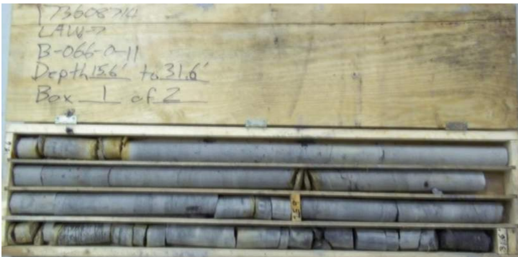
Figure 41 – Boring B-066-0-11, Box 1 of 2. Depth 15.6' to 31.6'.