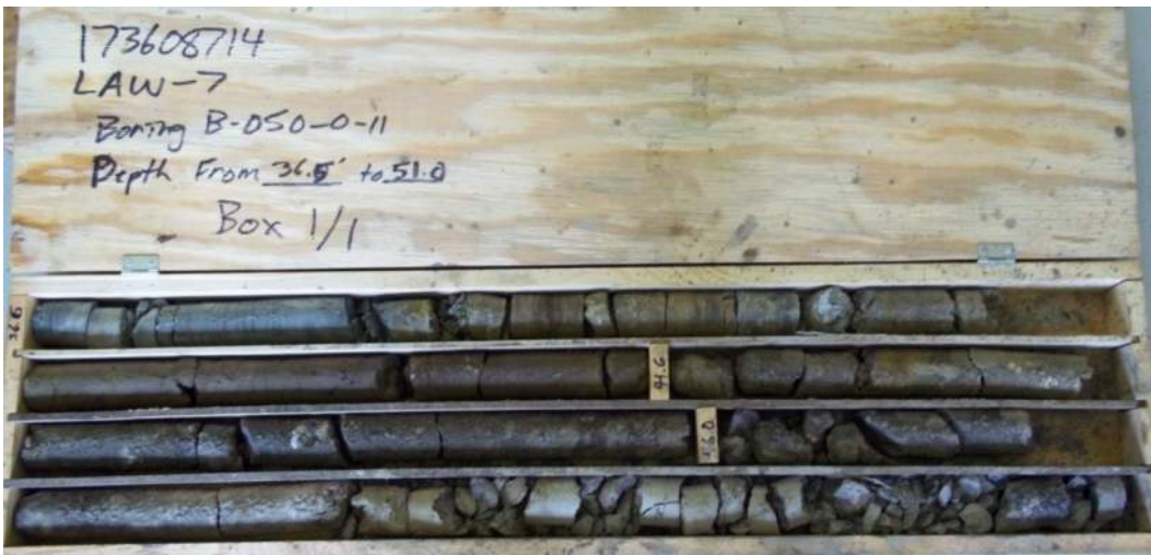
Figure 23 – Boring B-050-0-11, Box 1 of 1. Depth 36.5' to 51.0'.