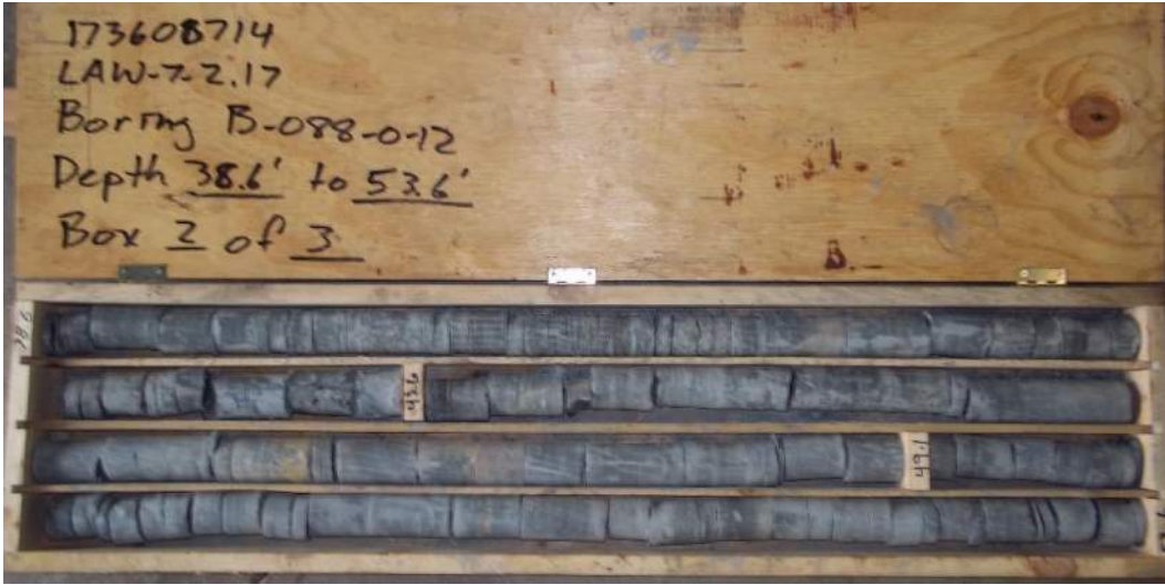
Figure 64 – Boring B-088-0-12, Box 2 of 3. Depth 38.6' to 53.6'.