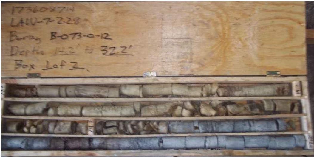
Figure 52 – Boring B-073-0-12, Box 1 of 2. Depth 14.2' to 32.2'.