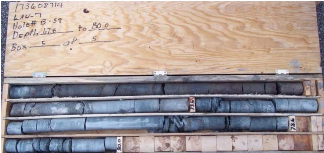
Figure 40 – Boring B-059-0-11, Box 5 of 5. Depth 67.8' to 80.0'.