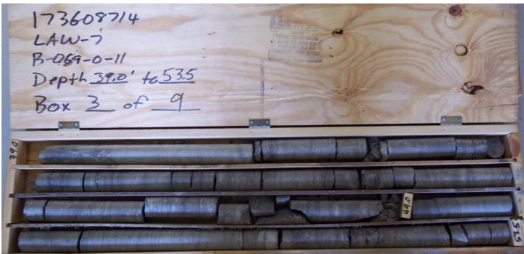
Figure 45 – Boring B-069-0-11, Box 3 of 9. Depth 39.0' to 53.5'.