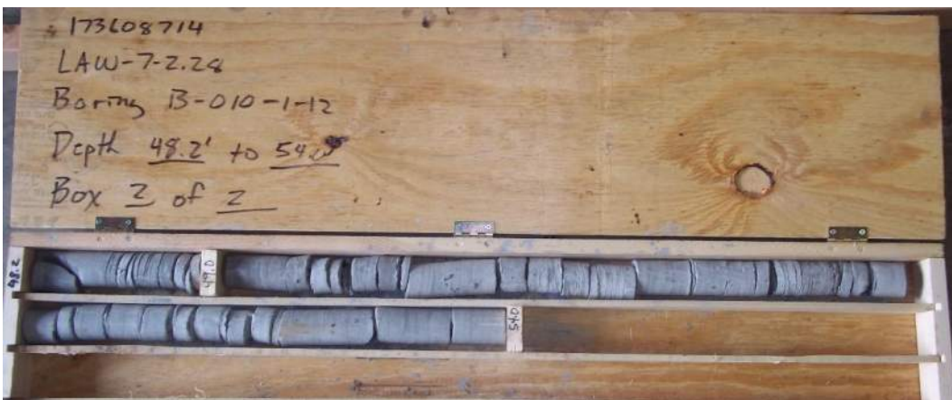
Figure 3 – Boring B-010-1-12, Box 2 of 2. Depth 48.2' to 54.0'.