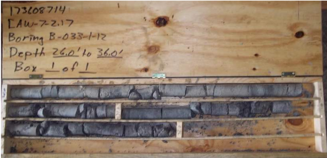
Figure 13 – Boring B-033-1-12, Box 1 of 1. Depth 26.0' to 36.0'.