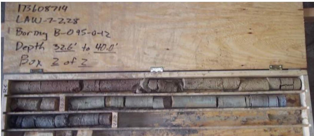
Figure 68 – Boring B-095-0-12, Box 2 of 2. Depth 32.6' to 40.0'.