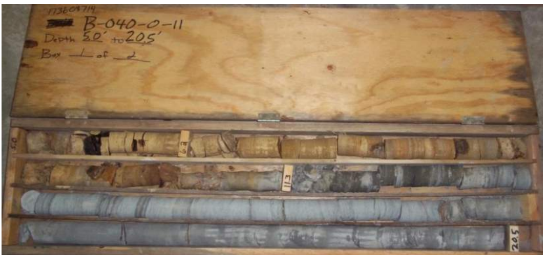
Figure 21 – Boring B-040-0-11, Box 1 of 2. Depth 5.0' to 20.5'.