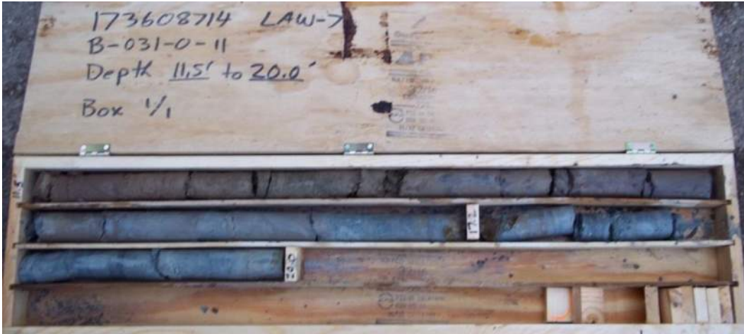
Figure 10 – Boring B-031-0-11, Box 1 of 1. Depth 11.5' to 20.0'.