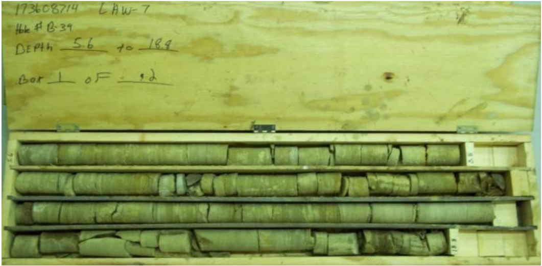
Figure 19 – Boring B-039-0-11, Box 1 of 2. Depth 5.6' to 18.8'.