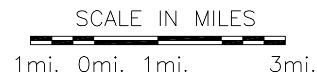
DETOUR & LOCATION MAP

LATITUDE: 40°53'20.99" North LONGITUDE: 84°39'20.87" West