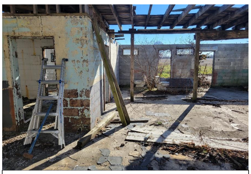
Photo 3 – View of central area of concrete structure looking south.