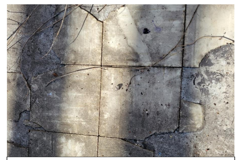
Photo 2 – View of asbestos-containing tan floor tile in concrete structure.