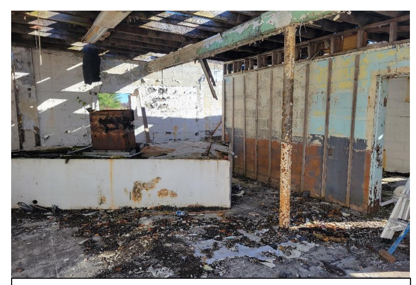
Photo 4 – View of central area of concrete structure looking northeast.