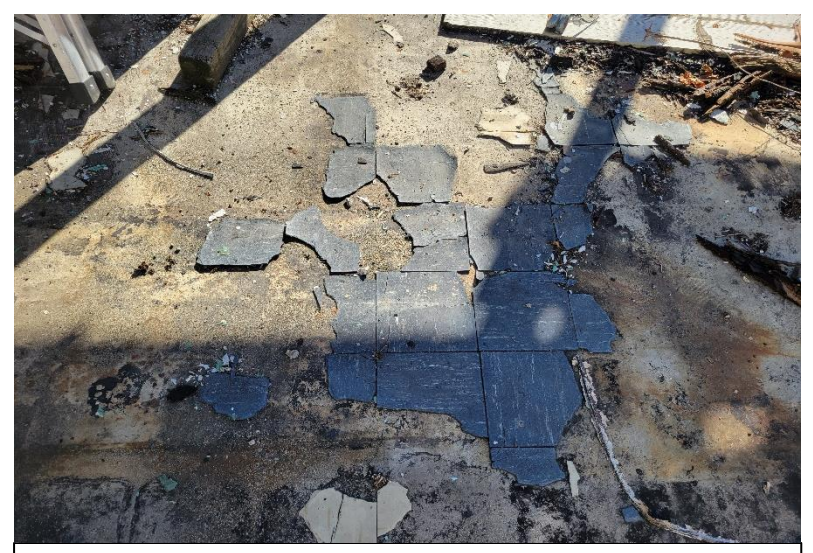
Photo 1 – View of asbestos-containing black floor tile in the concrete structure.