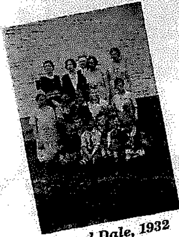
Rural Dale, 1932