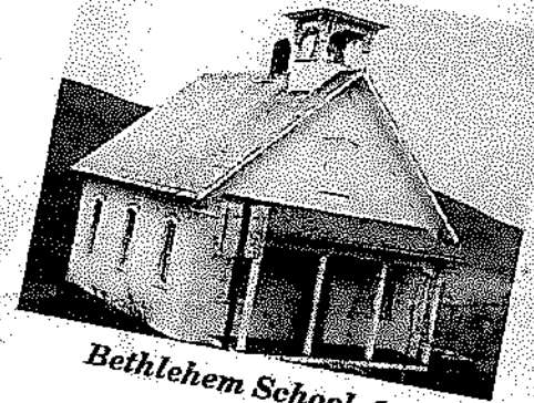
Bethlehem School, 1934