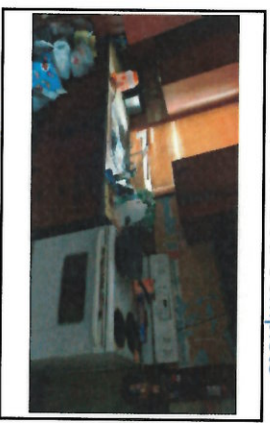
Kitchen, no electric