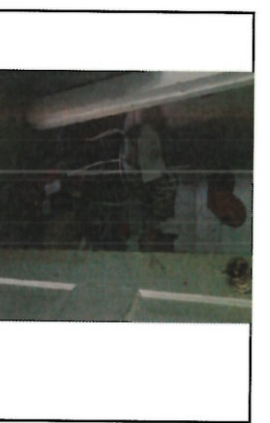
Wrought Iron Table and Stool