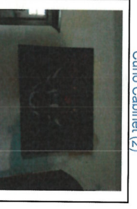
LR Wall Hanging