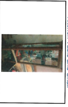
Curio Cabinet (1)