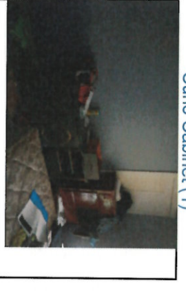
2nd BR Stereo and Dresser