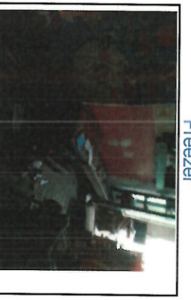
Wooden Bench and End Table