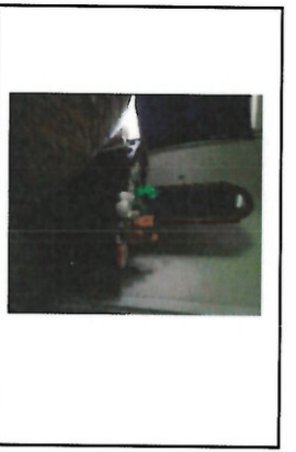
MBR Dresser and Mirror