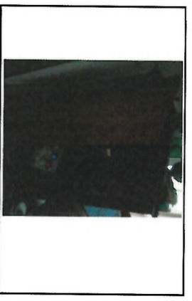
MBR Armoire and Contents