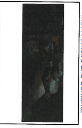
Kitchen Table and Chair