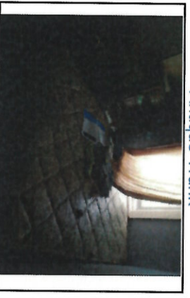
2nd BR Mattress & Box Spgs