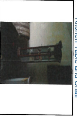
Curio Cabinet (2)