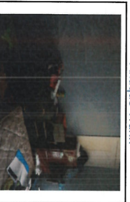
2nd BR Dressers