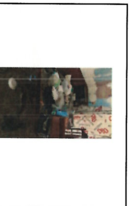
Kitchen table in kitchen