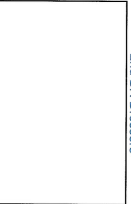
(Click here: Describe Photo)