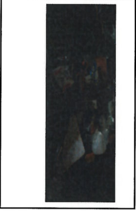
Kitchen Table and Chair