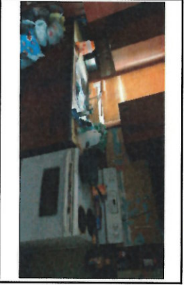
Kitchen, no electric