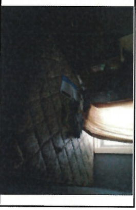
2nd BR Mattress & Box Spgs