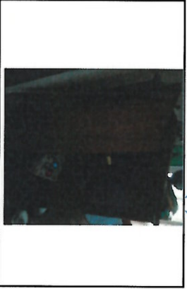
MBR Armoire & Contents