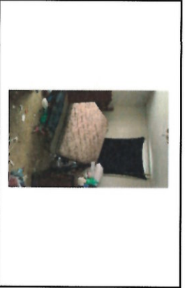
Bedroom, looks vandalized

County: MUS Route: 376 Section: 5.09 Parcel No: 010-1 PID No: 115989