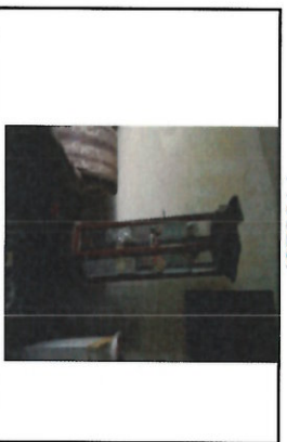
Curio Cabinet (2)