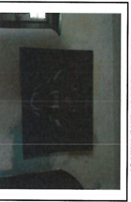
LR Wall Hanging