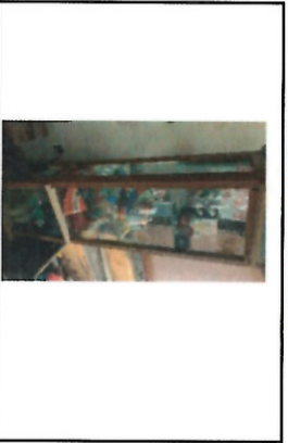
Curio Cabinet (1)