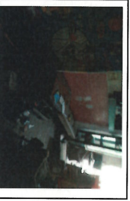
Wooden Bench and End Table