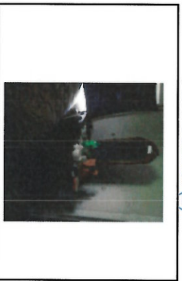
MBR Dresser and Mirror