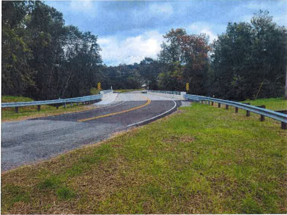
Newly Constructed Bridge with Sidewalk