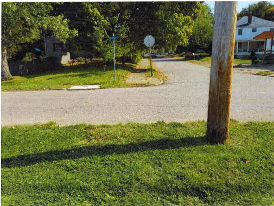
Existing Dead-End Sidewalk