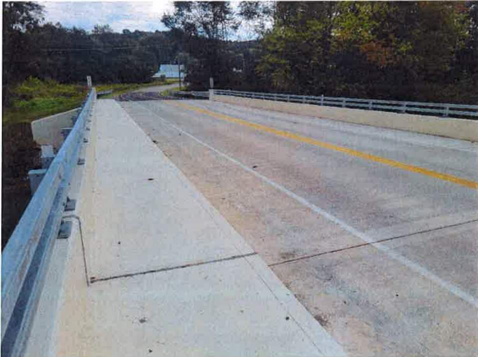
Newly Constructed Bridge with Sidewalk