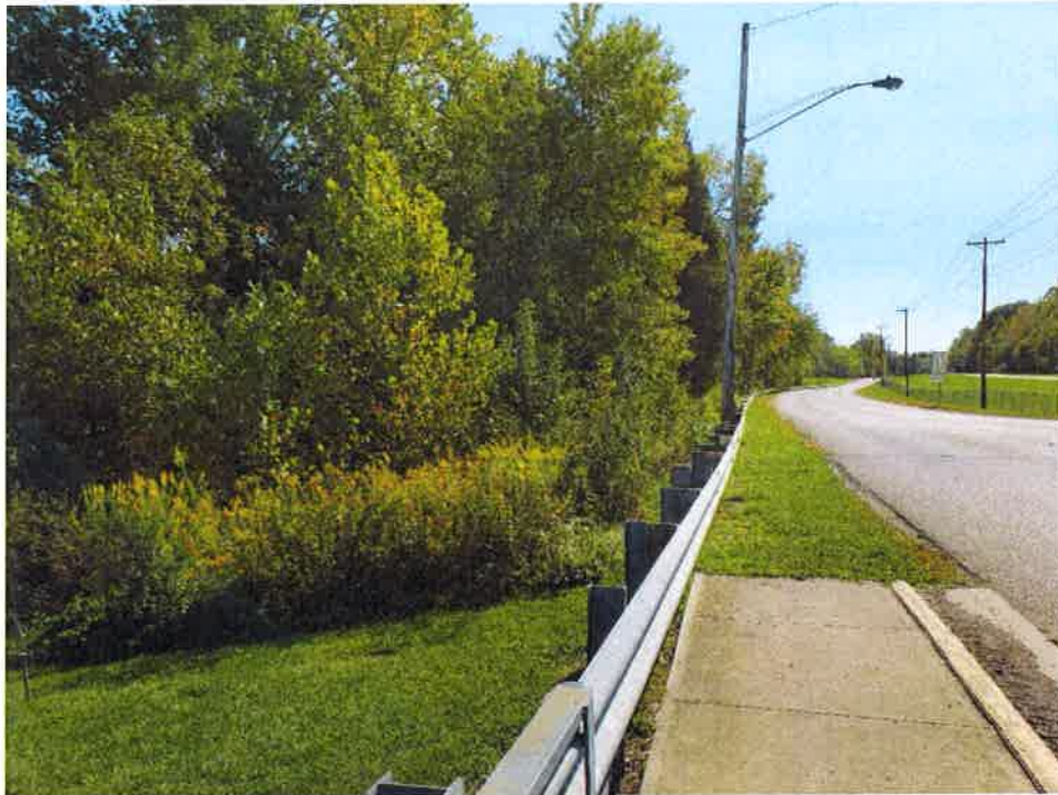
Existing Dead-End Sidewalk