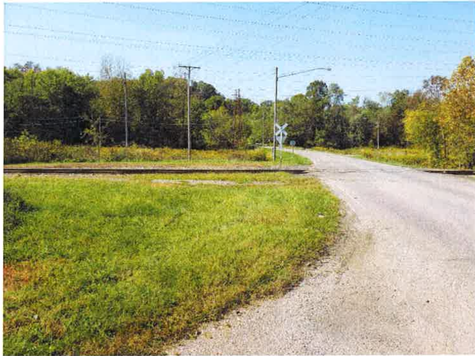
Railroad Track Crossing