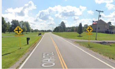
PIC-752-3.55 HSIP 2021 #116: SR 752 & CR 7 Date: 9/26/2023