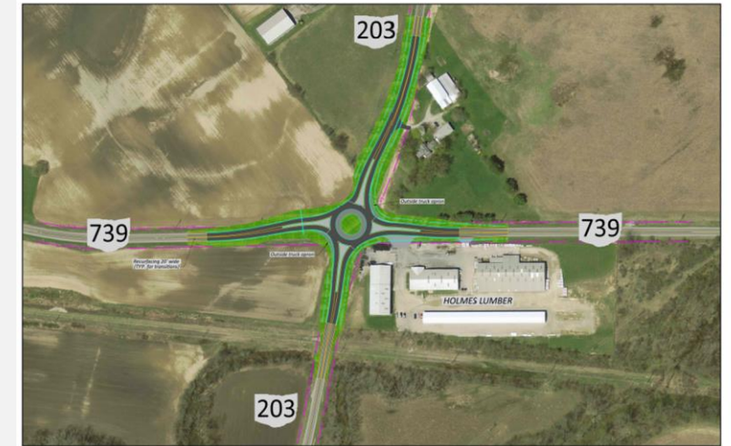
SR-739/SR-203 ROUNDABOUT CONCEPT PLAN