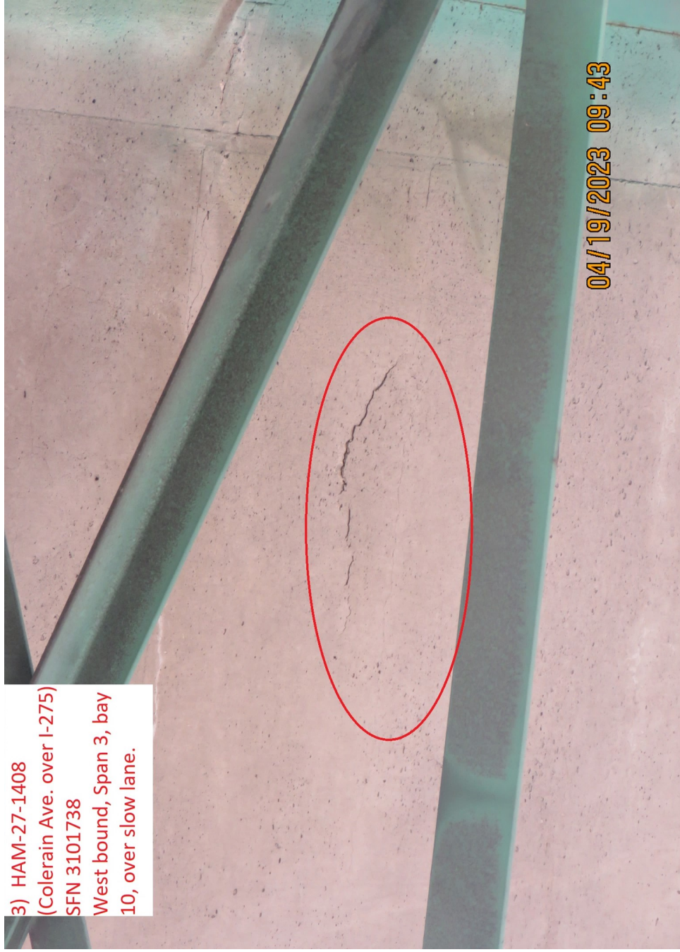
3) HAM-27-1408 (Colerain Ave. over I-275) SFN 3101738 West bound, Span 3, bay 10, over slow lane.