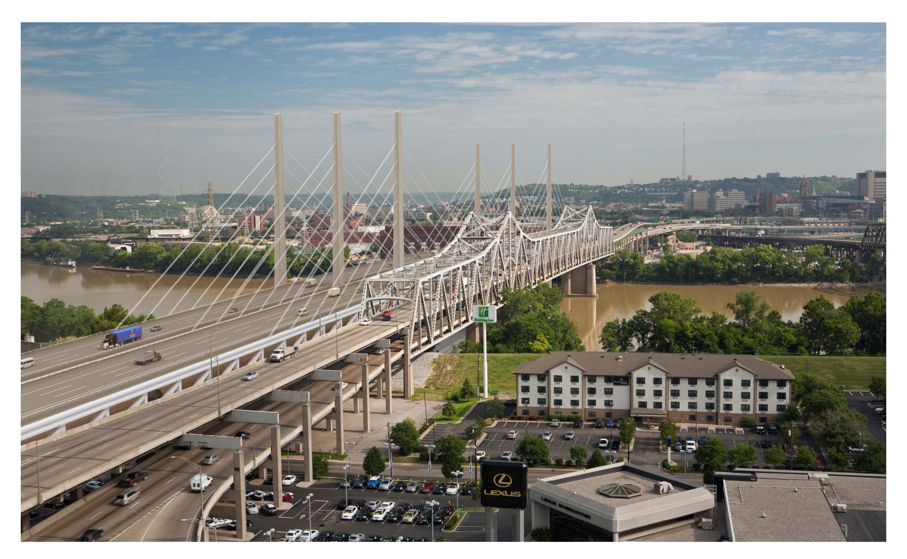
ALTERNATIVE 3 – TWO TOWER CABLE STAYED