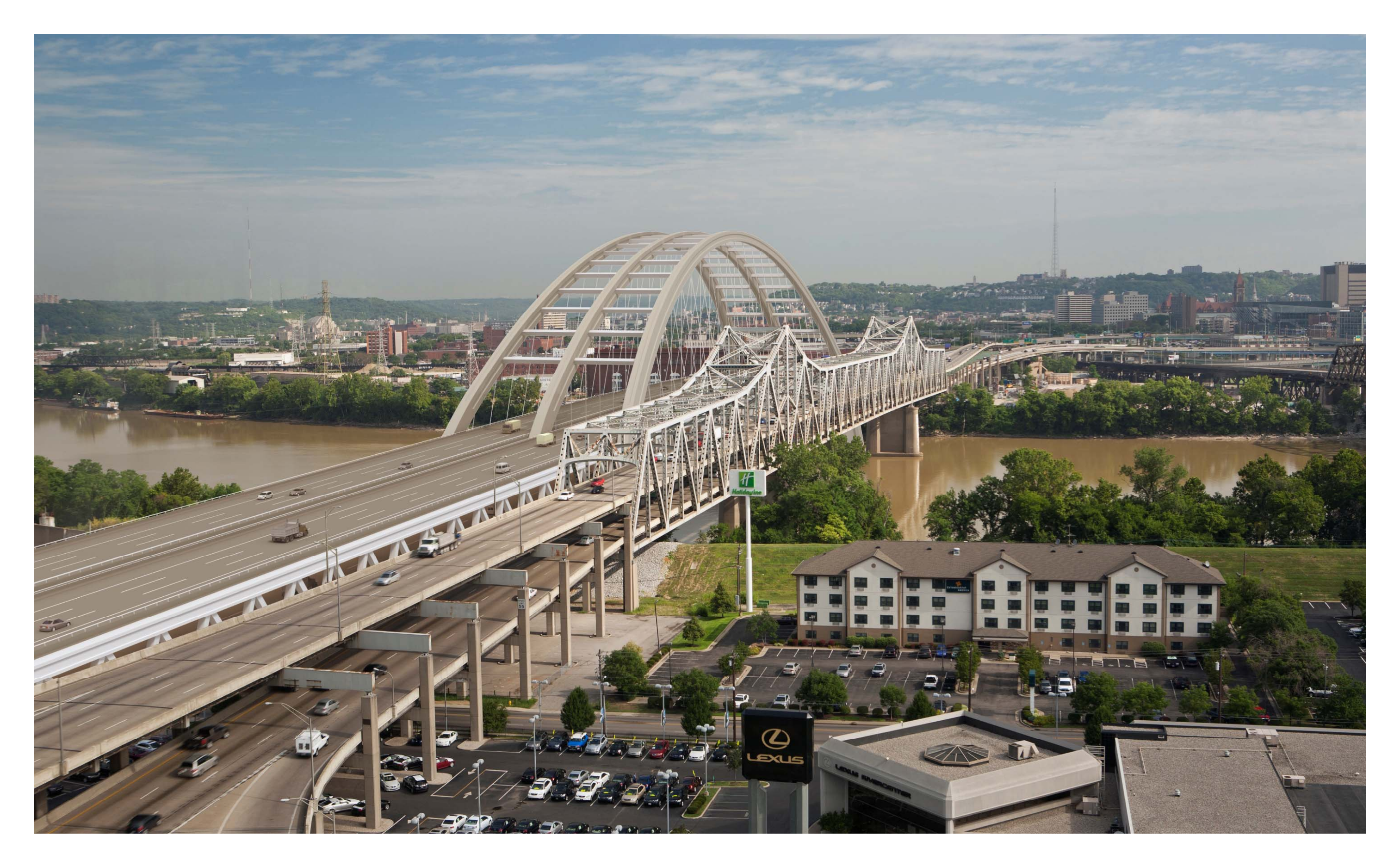
ALTERNATIVE 1 – TIED ARCH