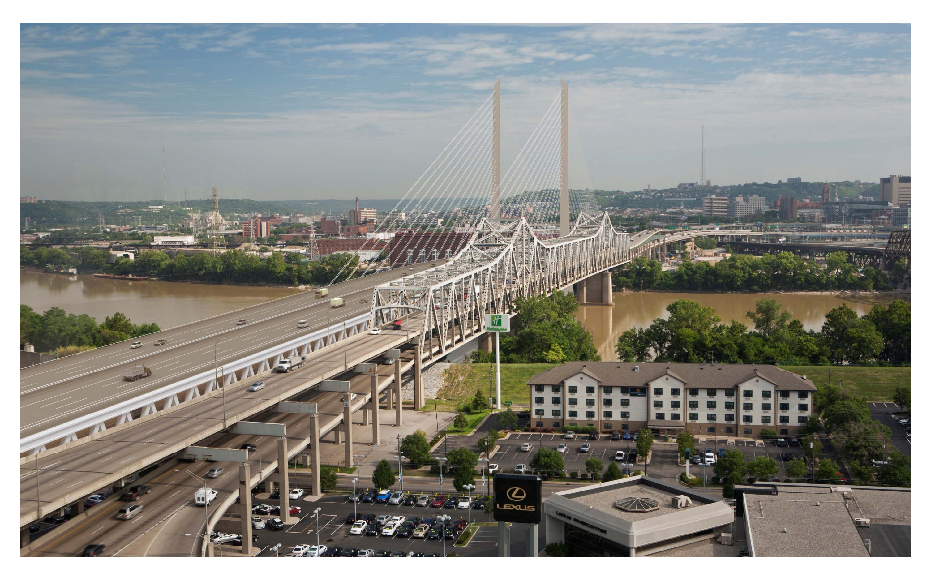
ALTERNATIVE 6 – ONE TOWER CABLE STAYED