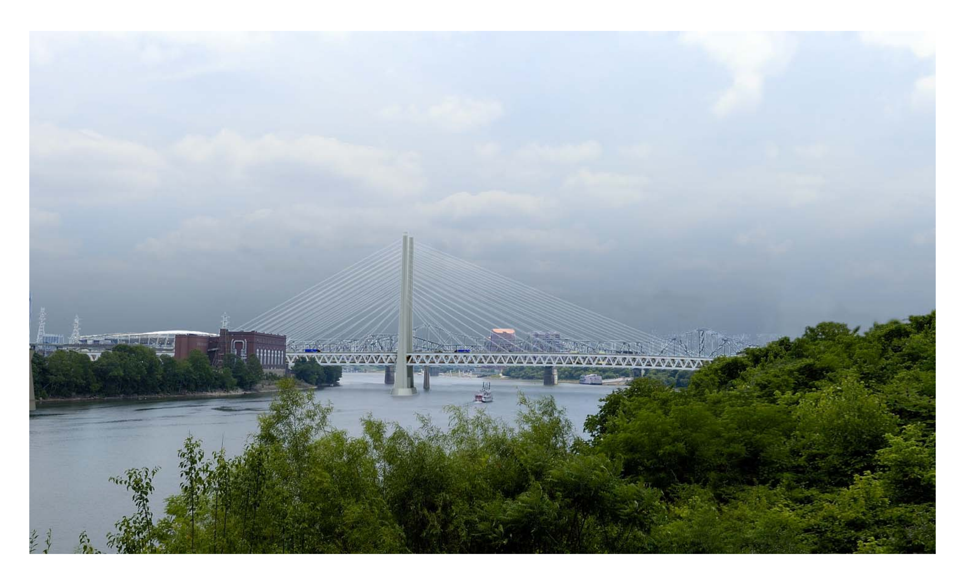
ALTERNATIVE 6 – ONE TOWER CABLE STAYED