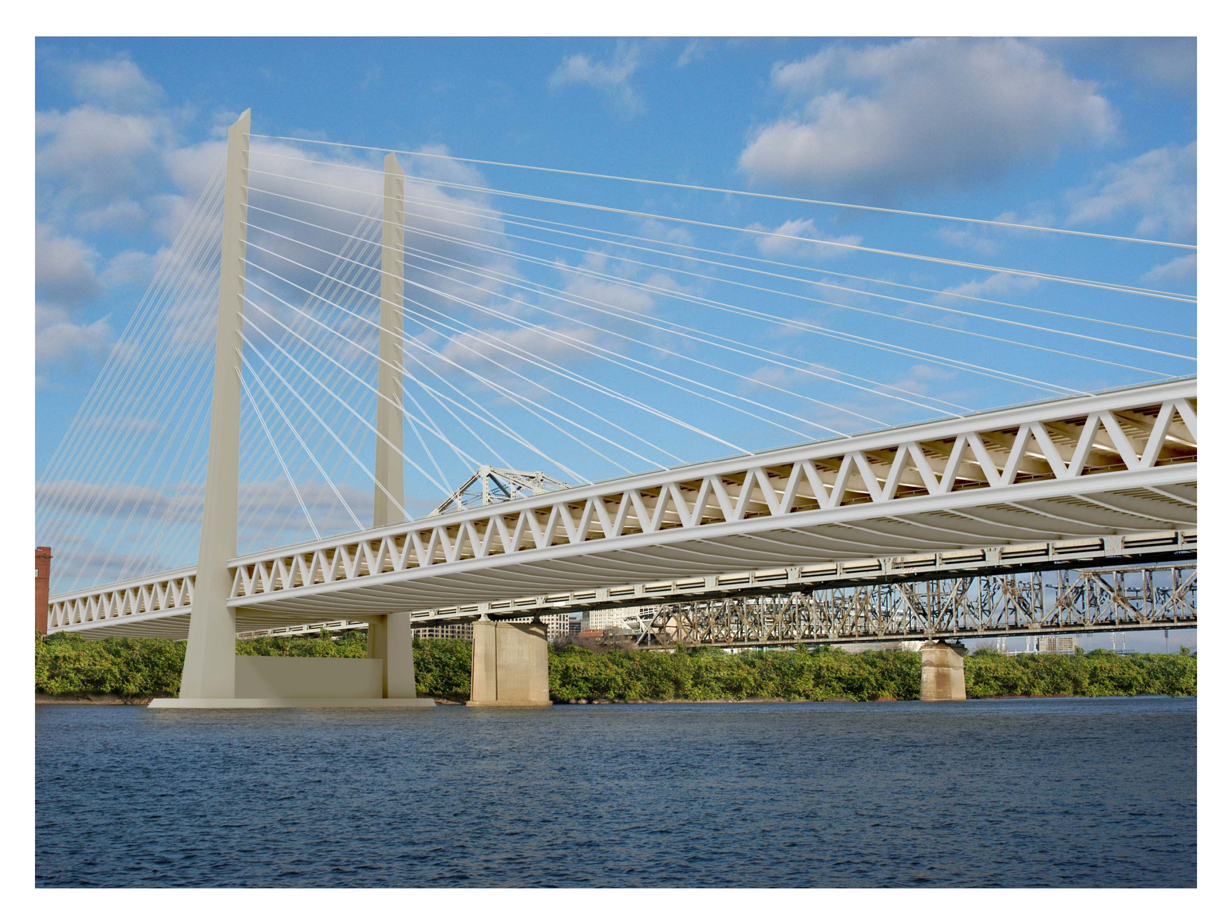
ALTERNATIVE 6 – ONE TOWER CABLE STAYED