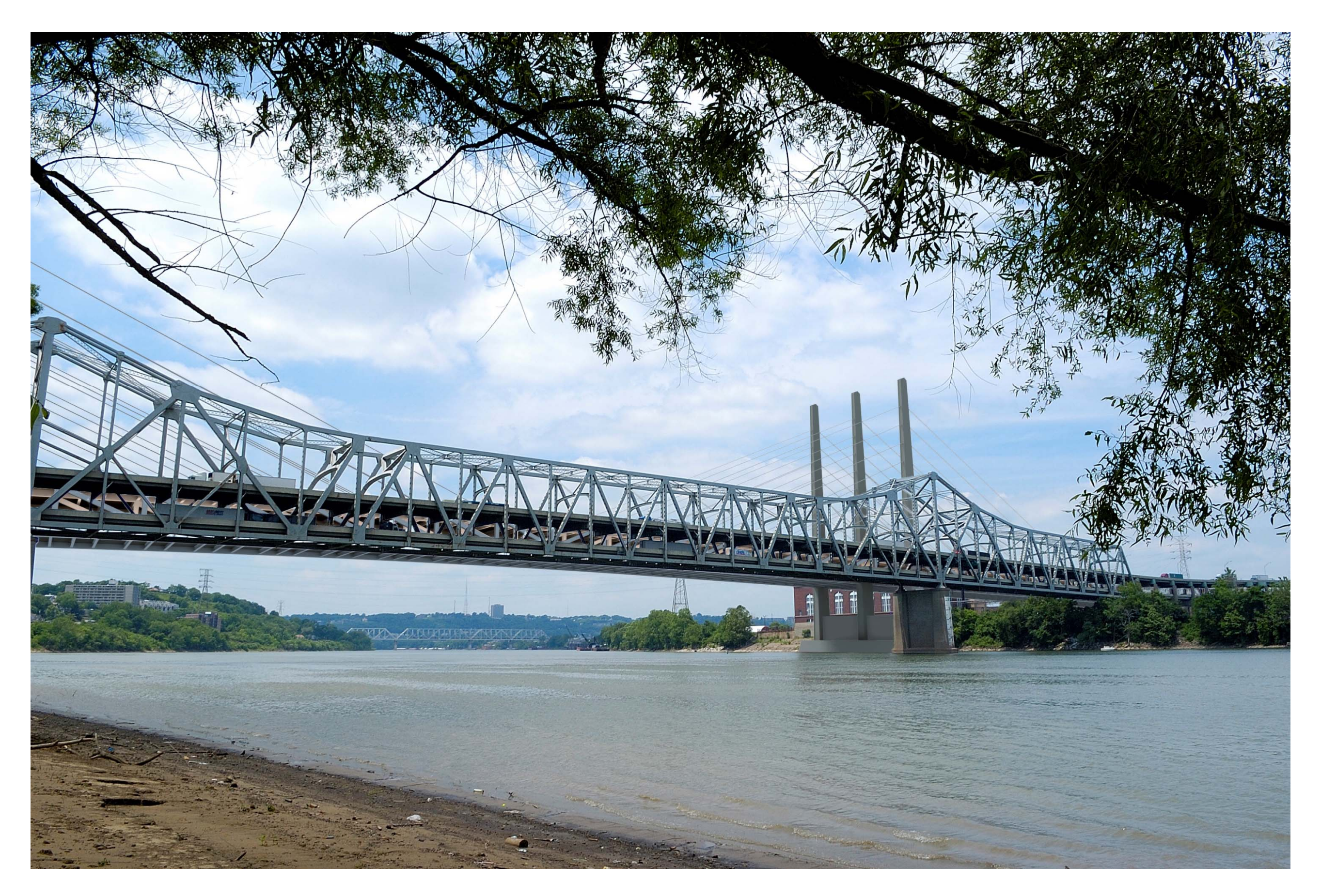
ALTERNATIVE 3 – TWO TOWER CABLE STAYED