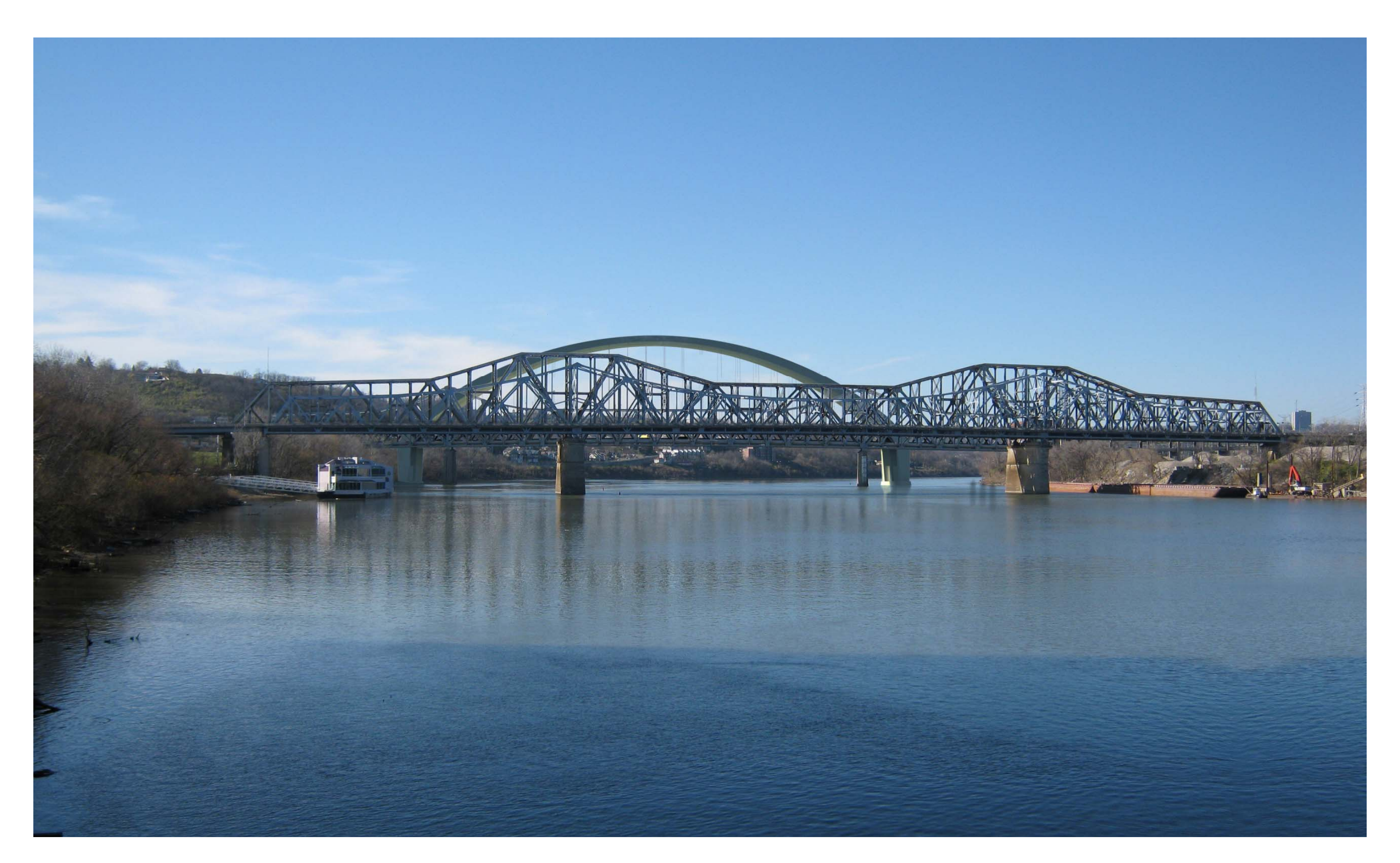
ALTERNATIVE 1 – TIED ARCH