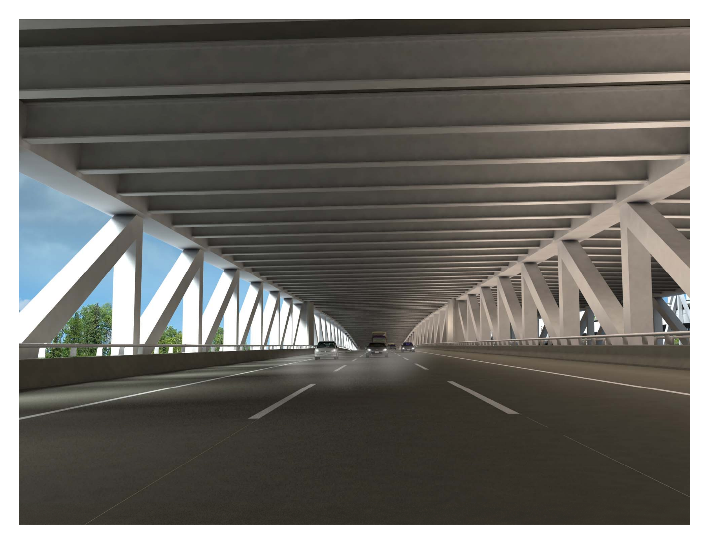
ALTERNATIVE 3 – TWO TOWER CABLE STAYED