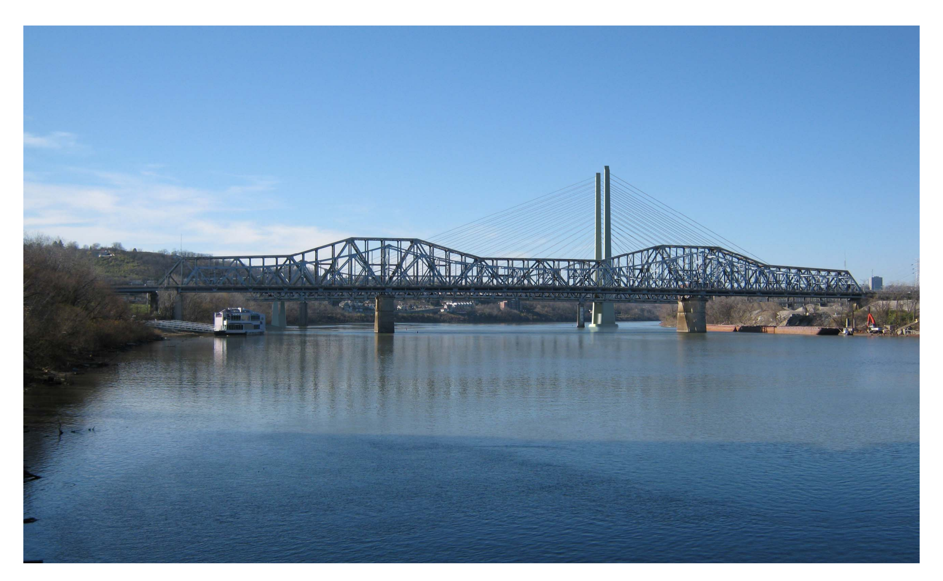
ALTERNATIVE 6 – ONE TOWER CABLE STAYED