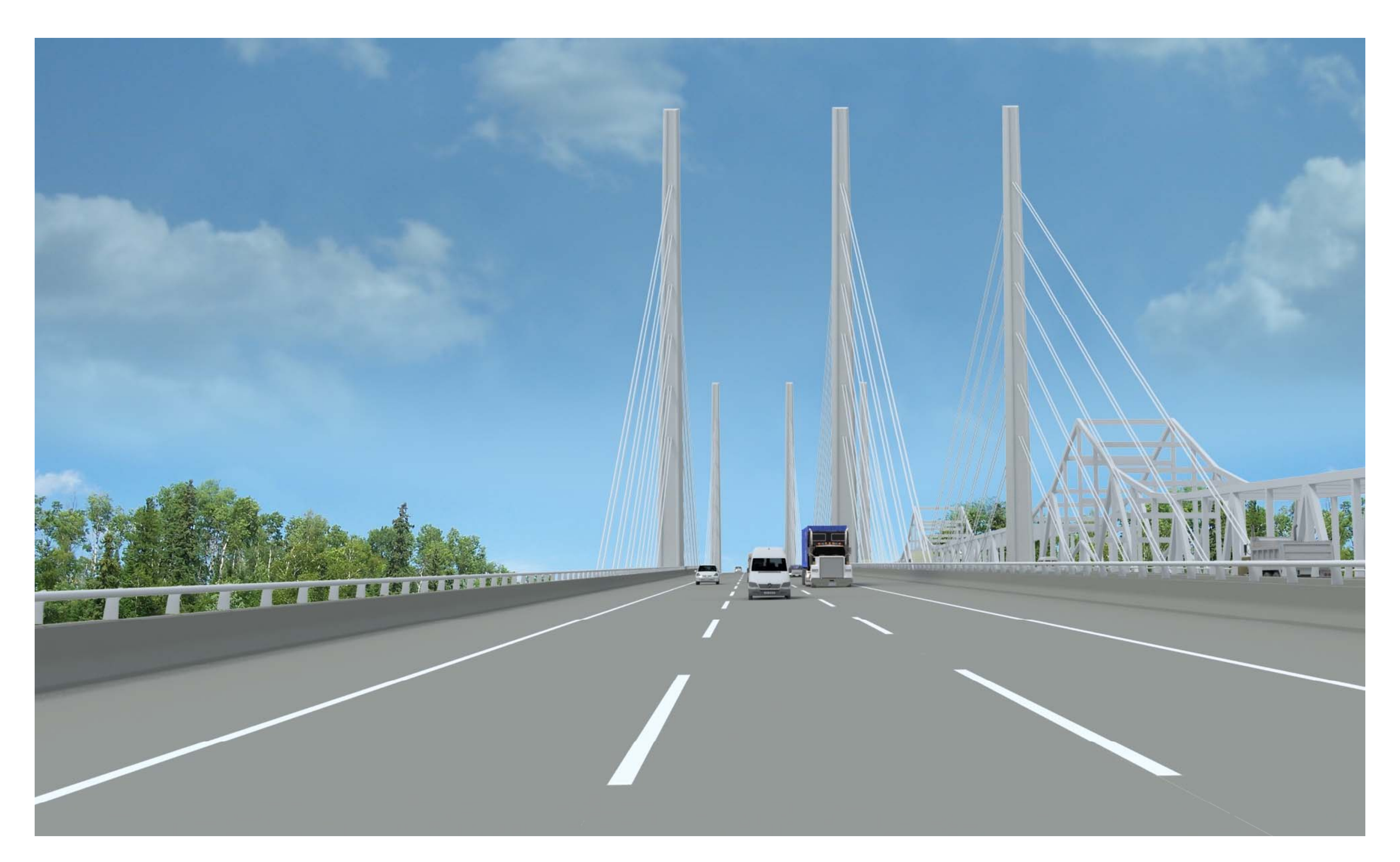
ALTERNATIVE 3 – TWO TOWER CABLE STAYED