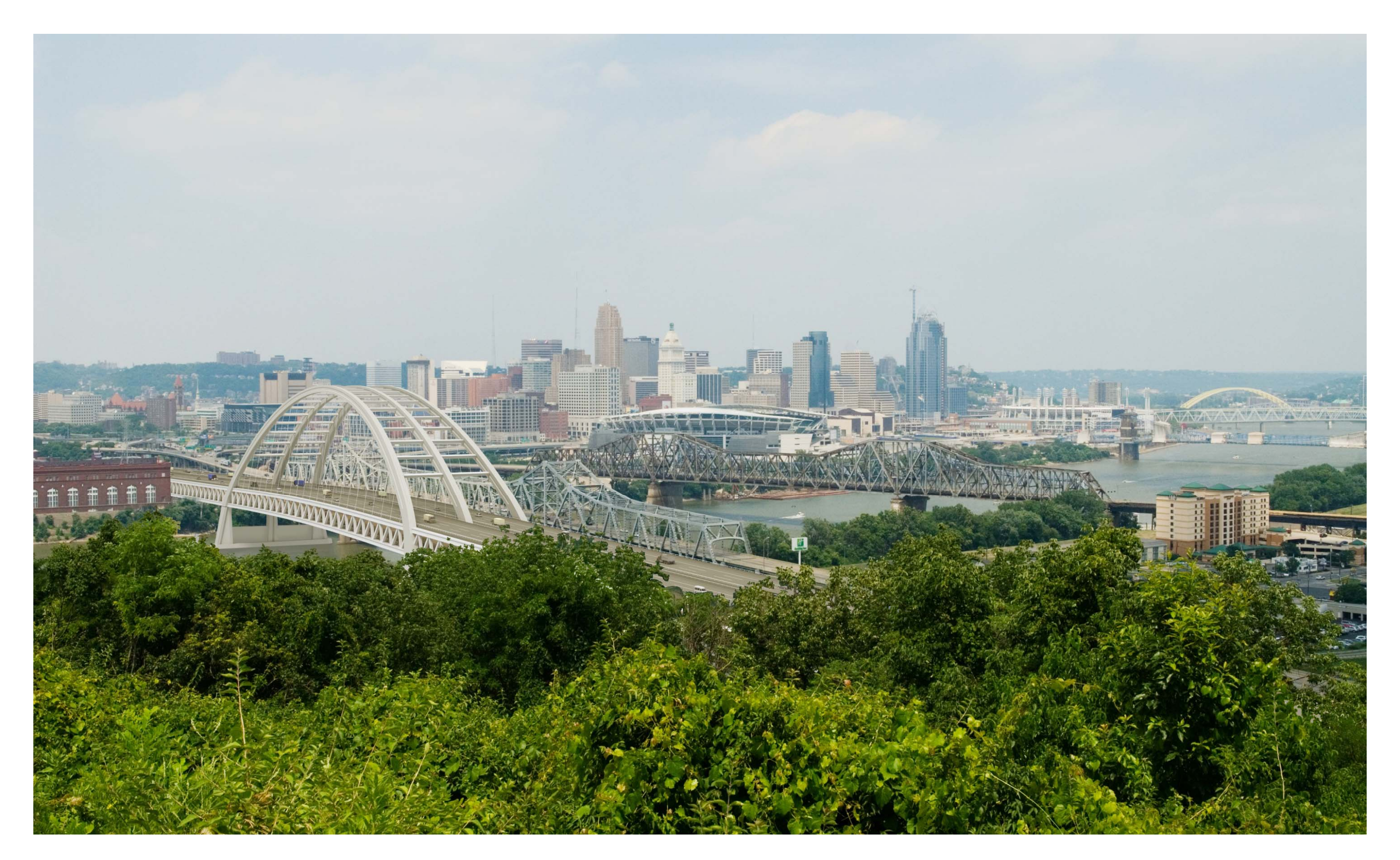
ALTERNATIVE 1 – TIED ARCH