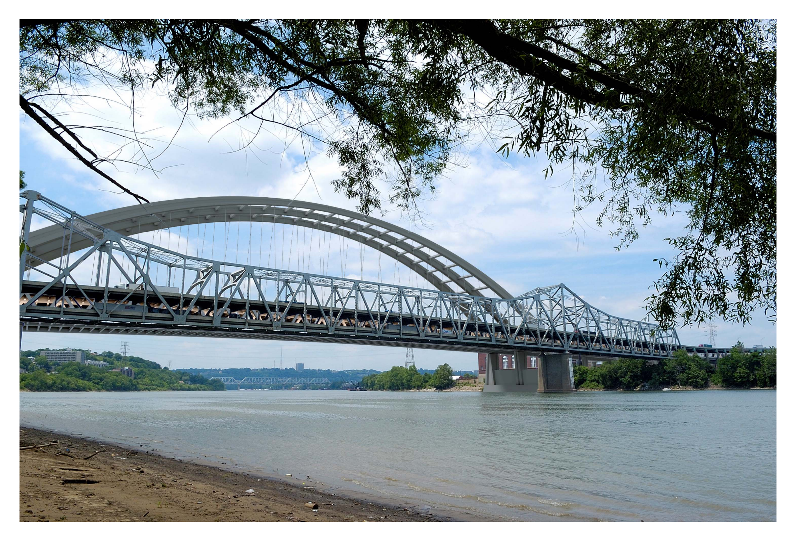
ALTERNATIVE 1 – TIED ARCH