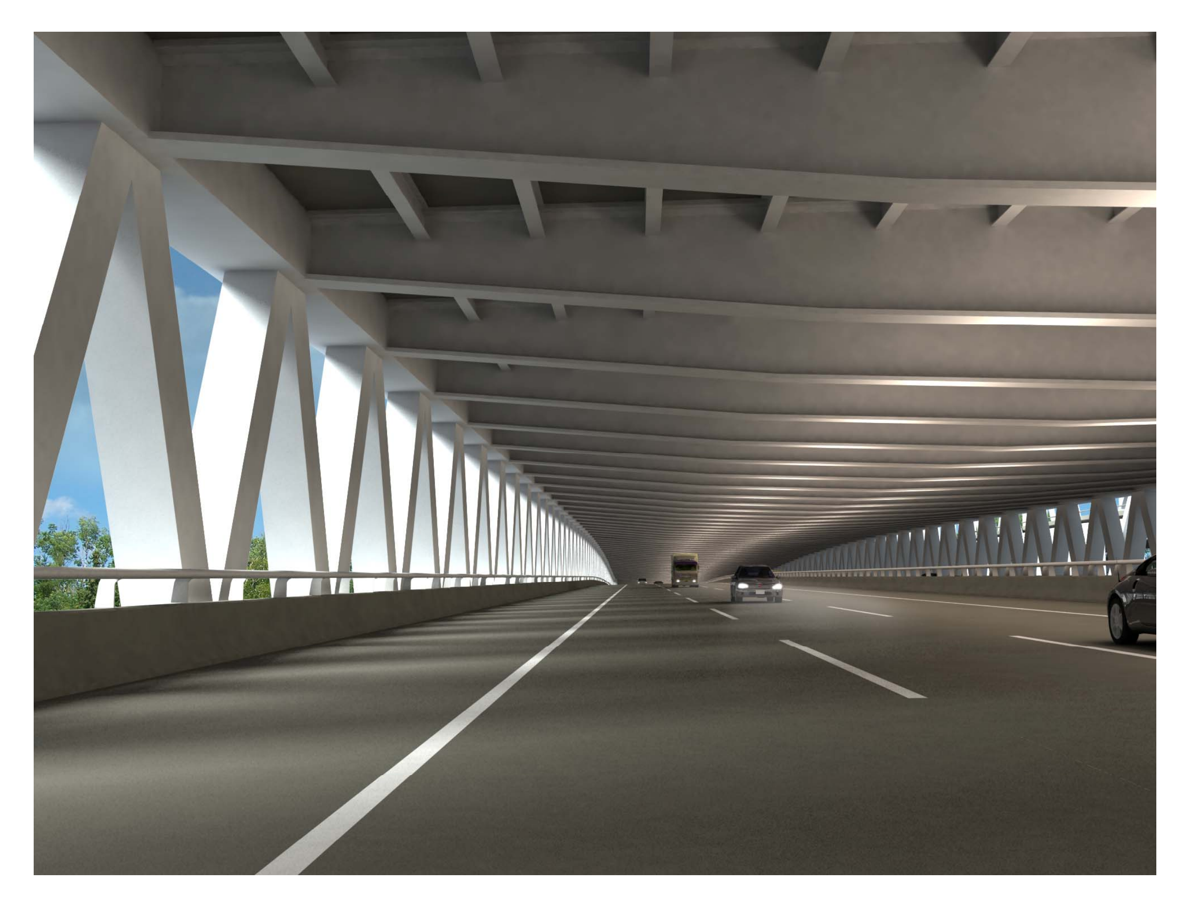
ALTERNATIVE 6 – ONE TOWER CABLE STAYED