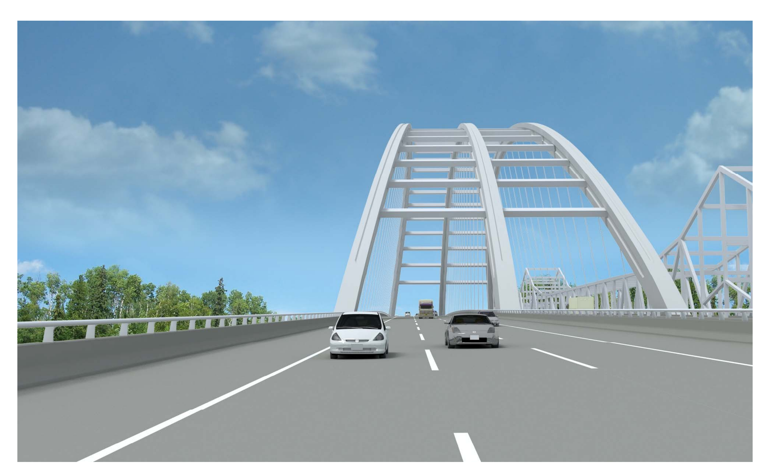
ALTERNATIVE 1 – TIED ARCH