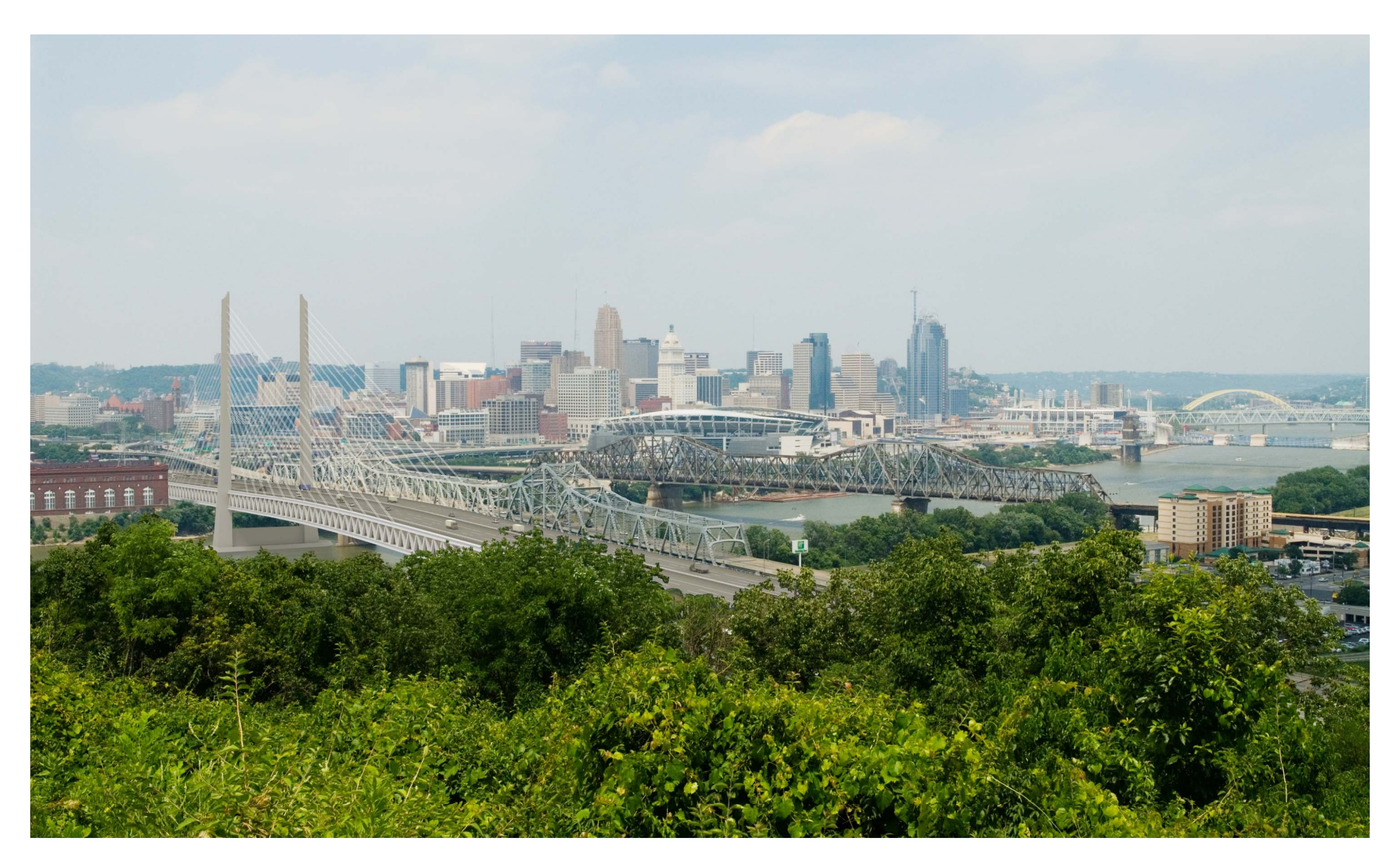
ALTERNATIVE 6 – ONE TOWER CABLE STAYED