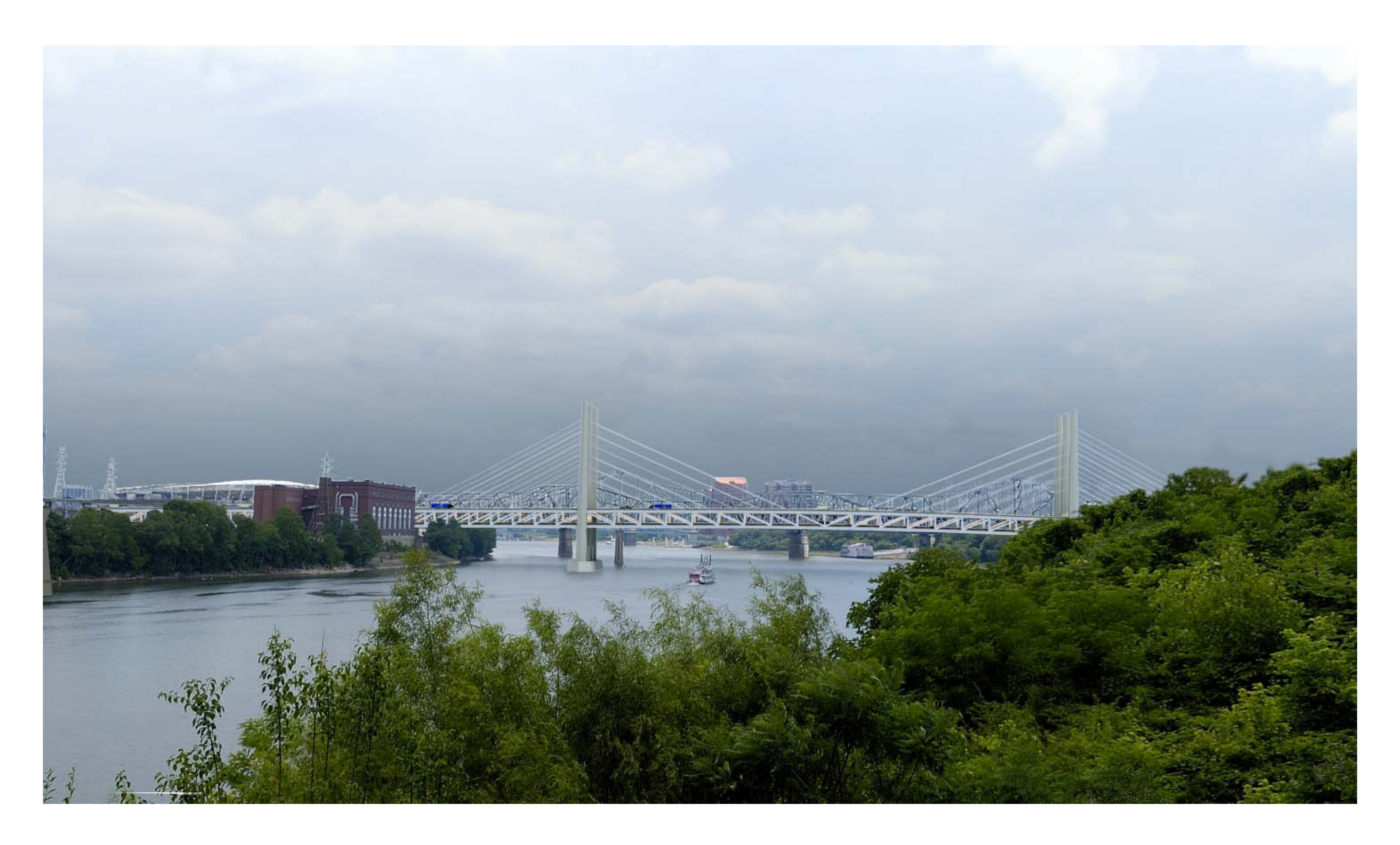
ALTERNATIVE 3 – TWO TOWER CABLE STAYED