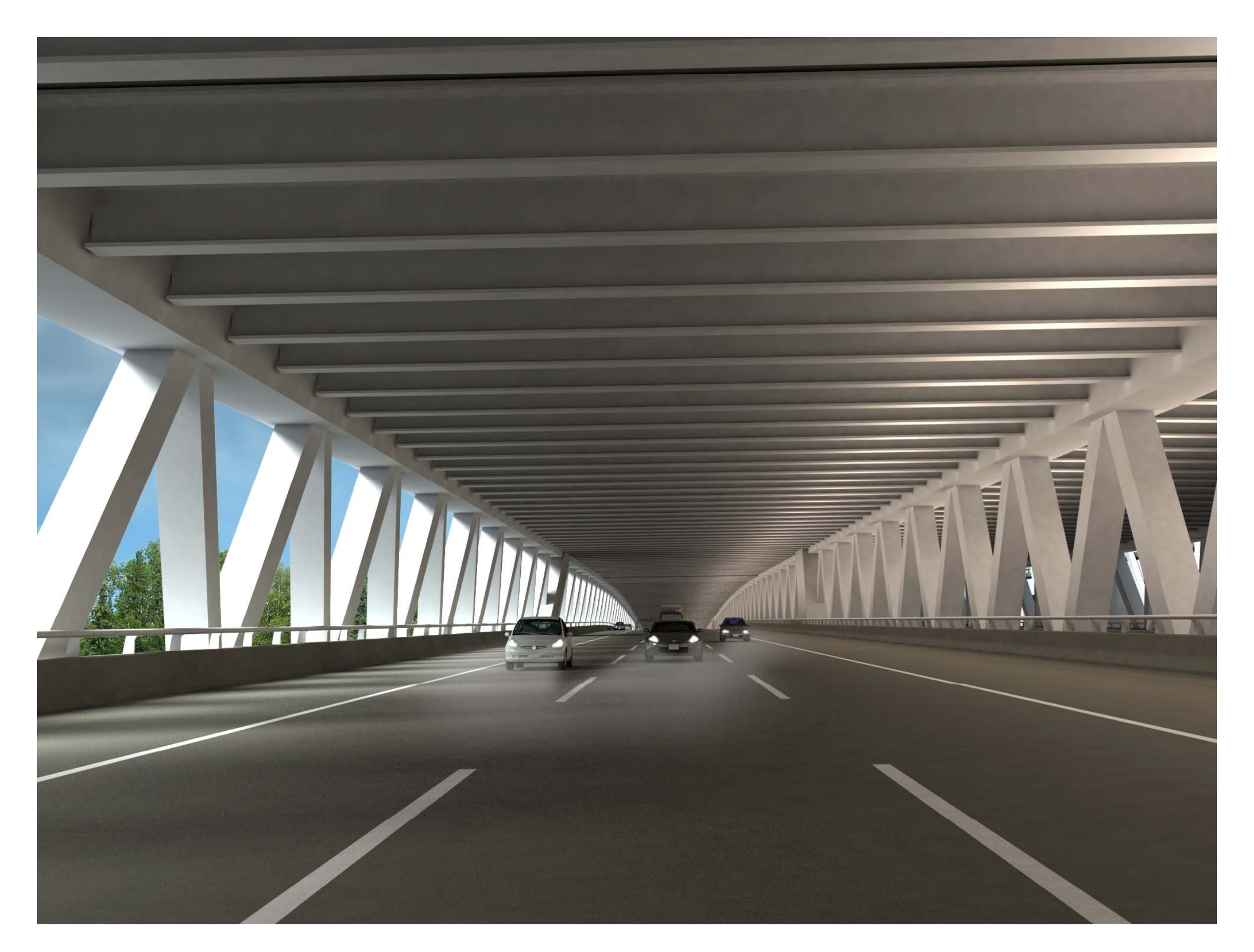
ALTERNATIVE 1 – TIED ARCH