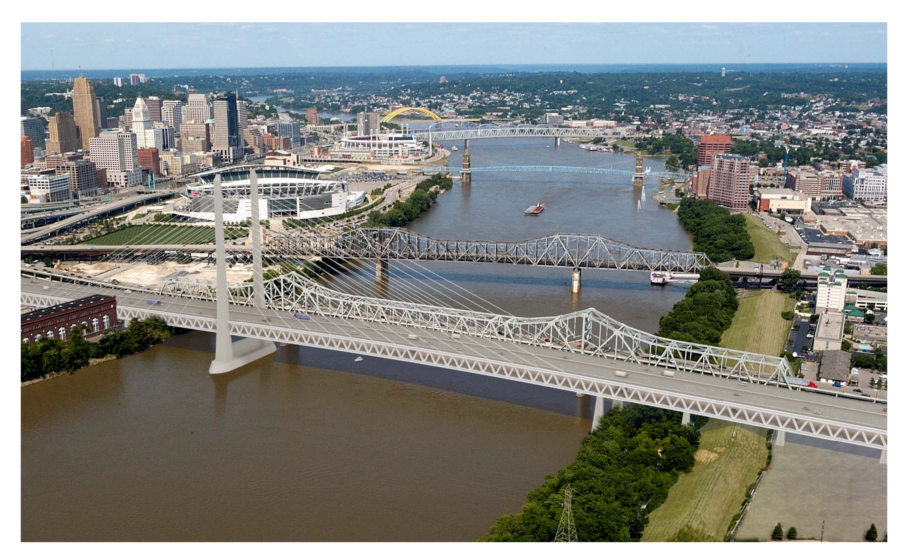
ALTERNATIVE 6 – ONE TOWER CABLE STAYED