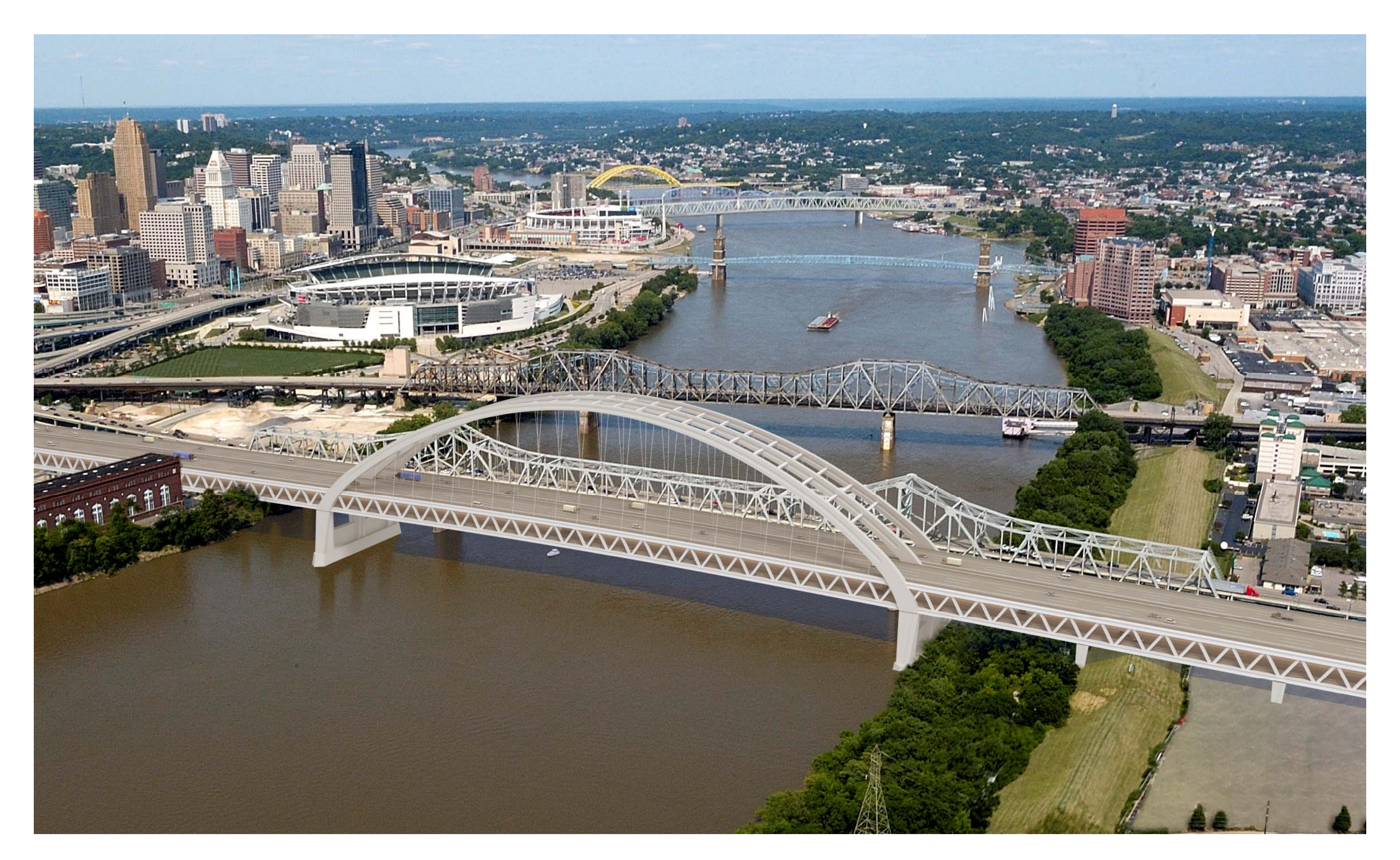
ALTERNATIVE 1 – TIED ARCH