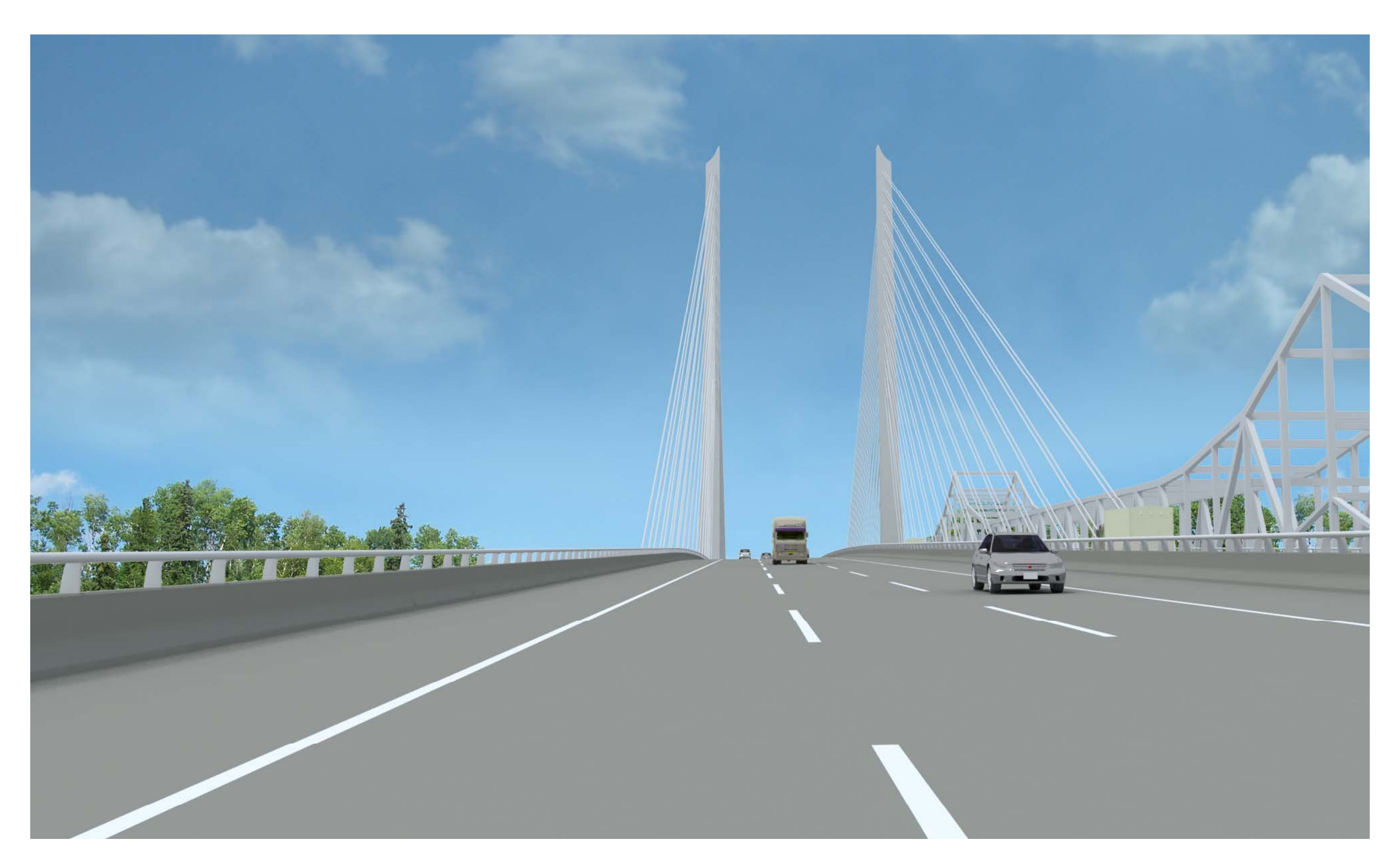
ALTERNATIVE 6 – ONE TOWER CABLE STAYED