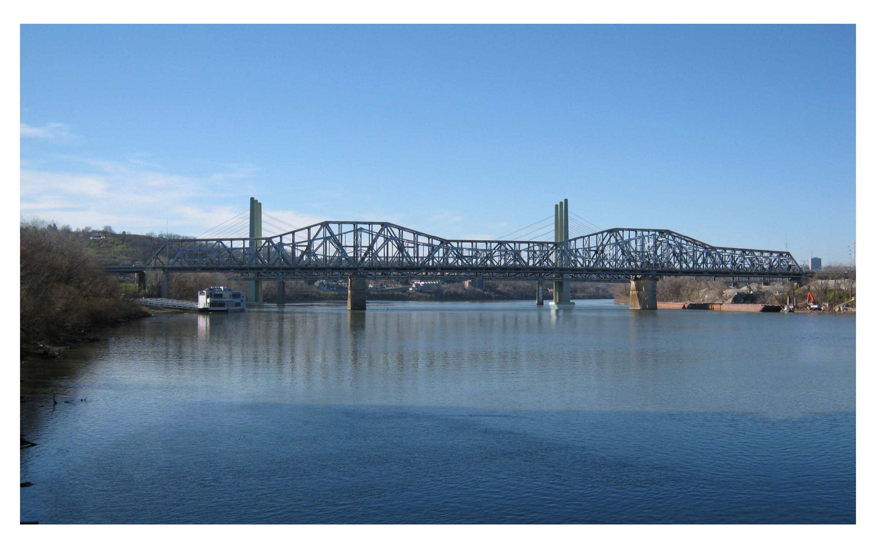
ALTERNATIVE 3 – TWO TOWER CABLE STAYED