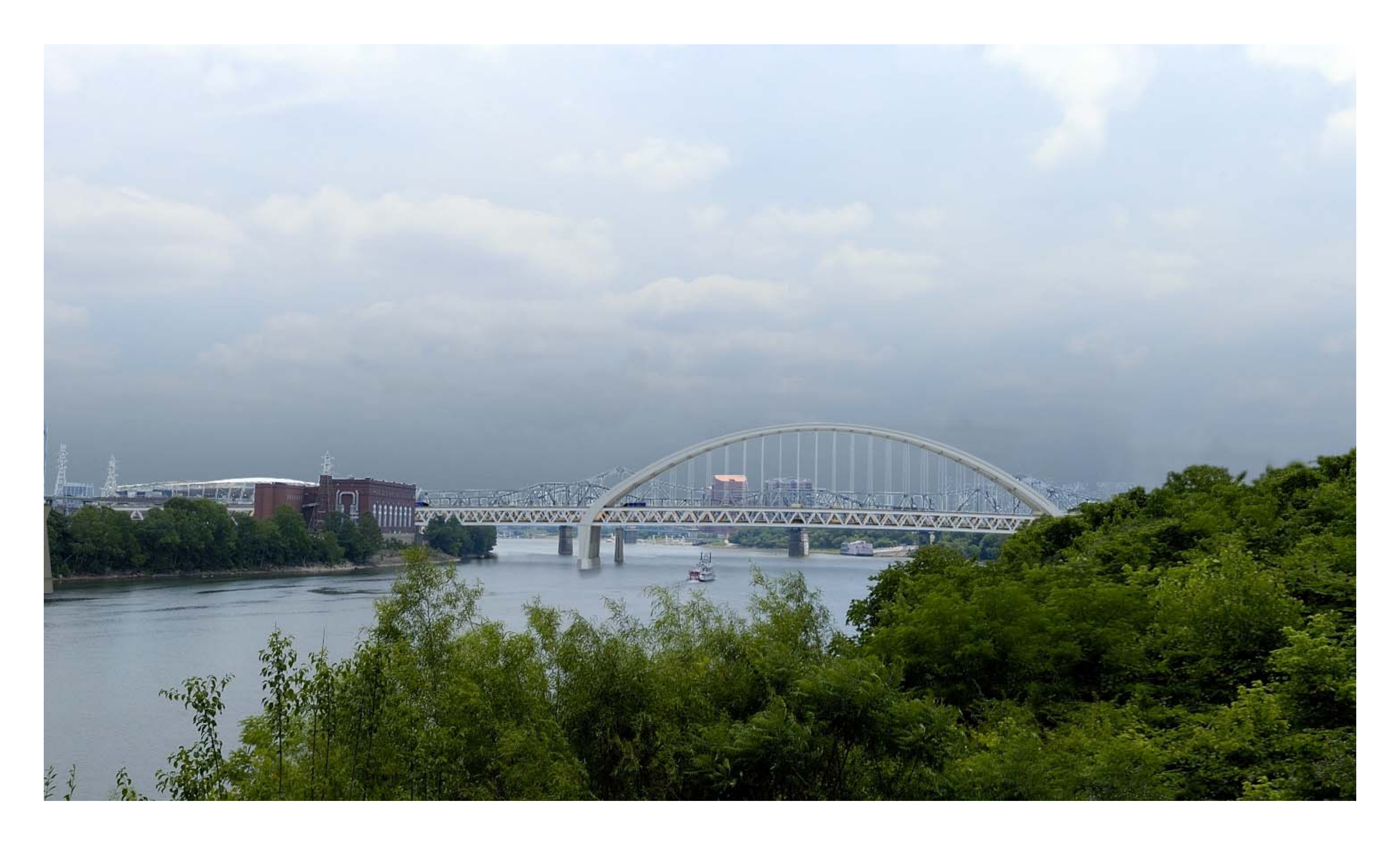
ALTERNATIVE 1 – TIED ARCH