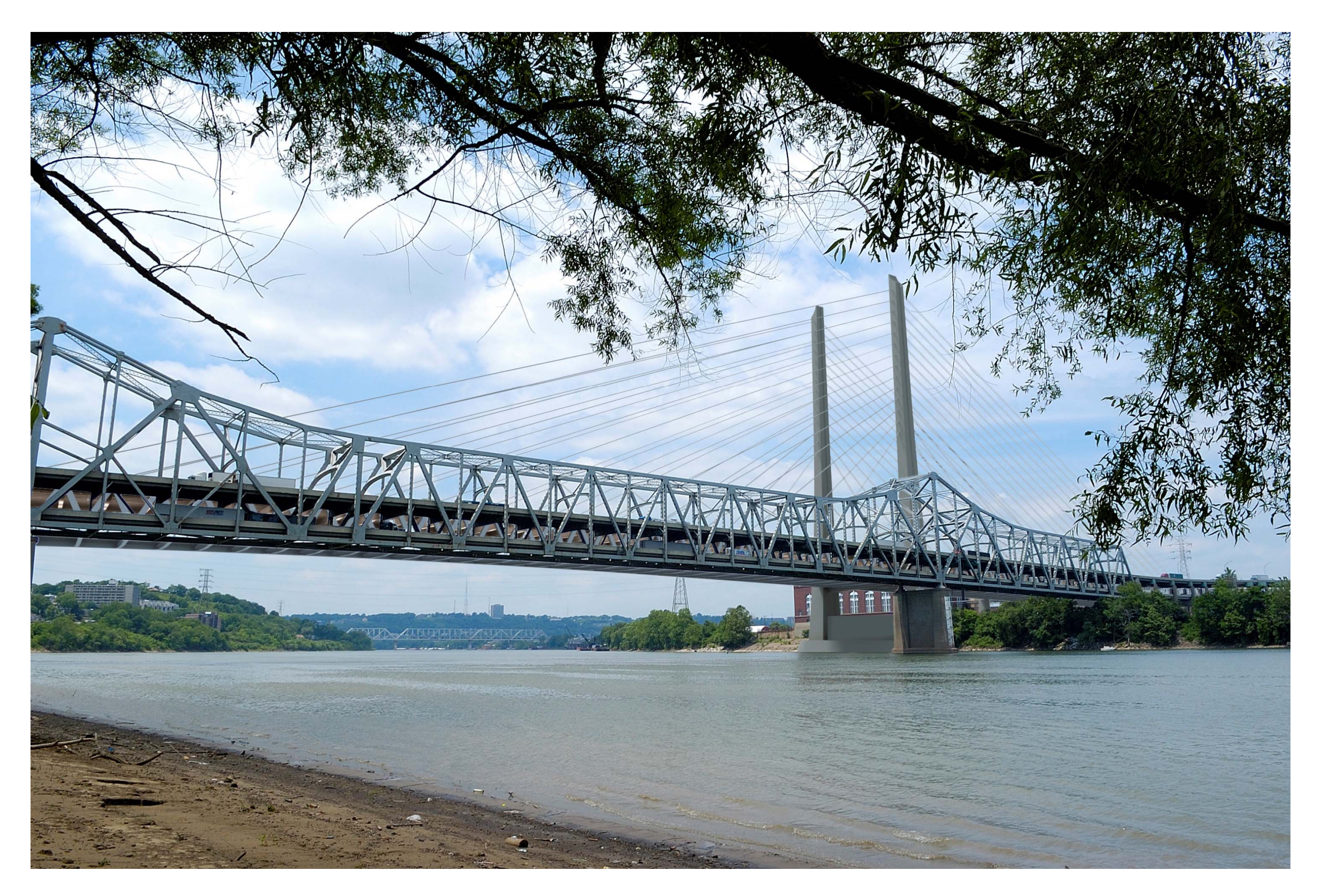
ALTERNATIVE 6 – ONE TOWER CABLE STAYED