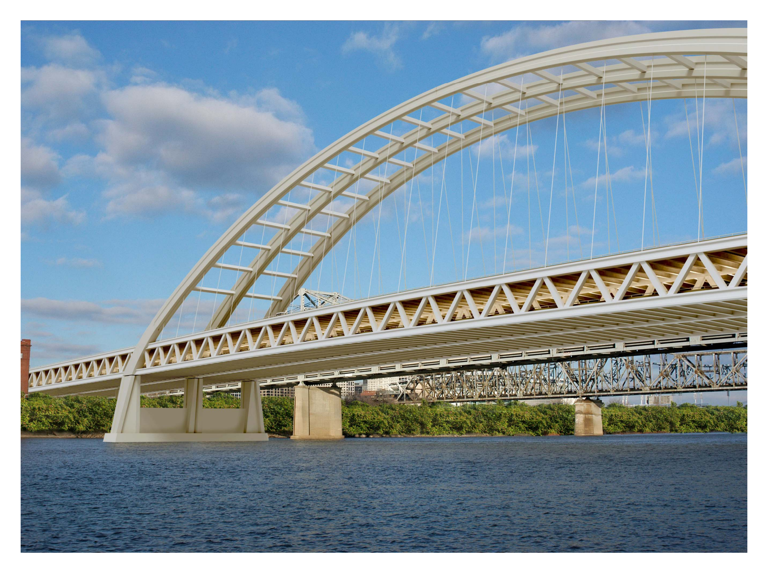
ALTERNATIVE 1 – TIED ARCH