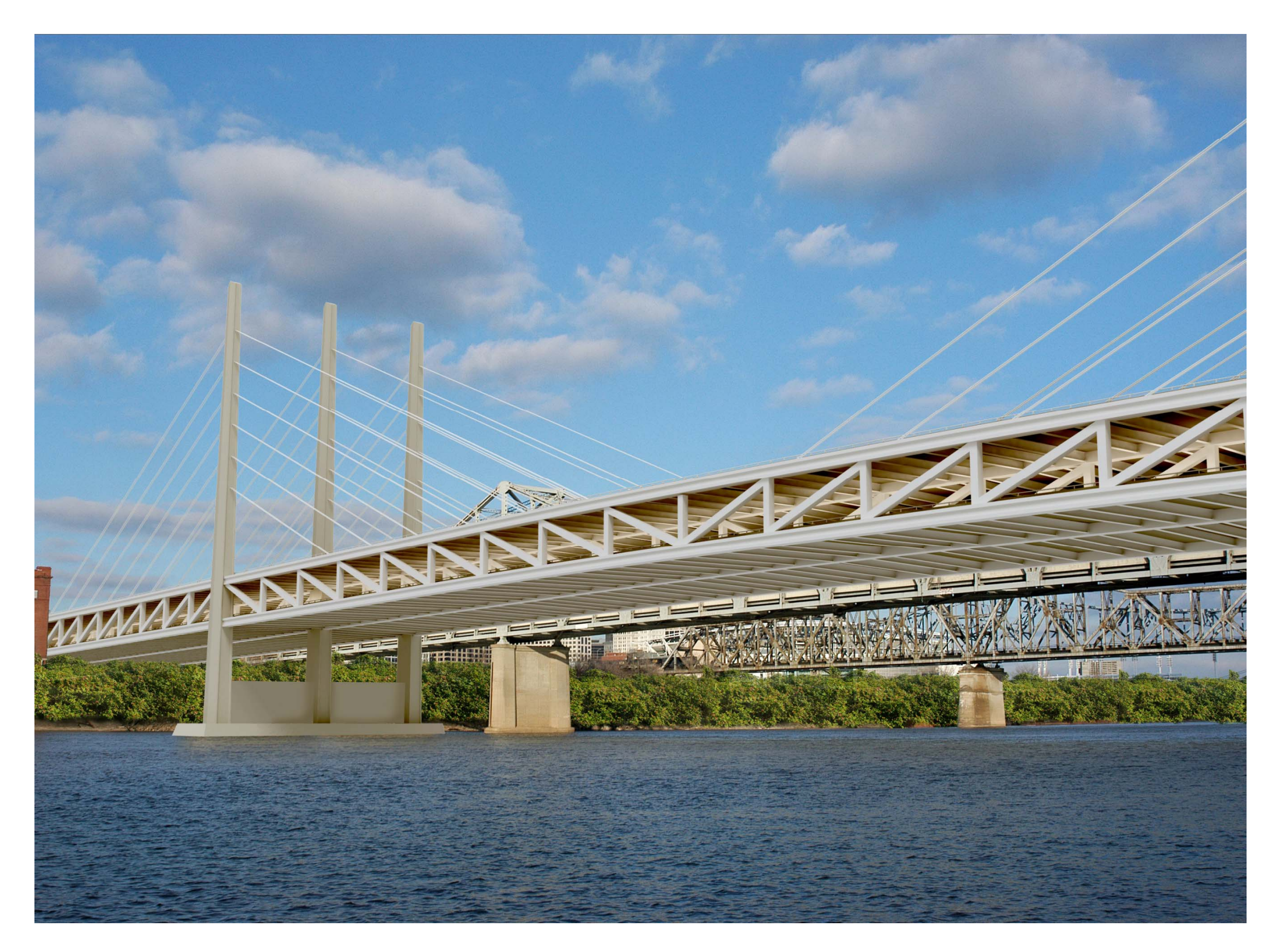
ALTERNATIVE 3 – TWO TOWER CABLE STAYED