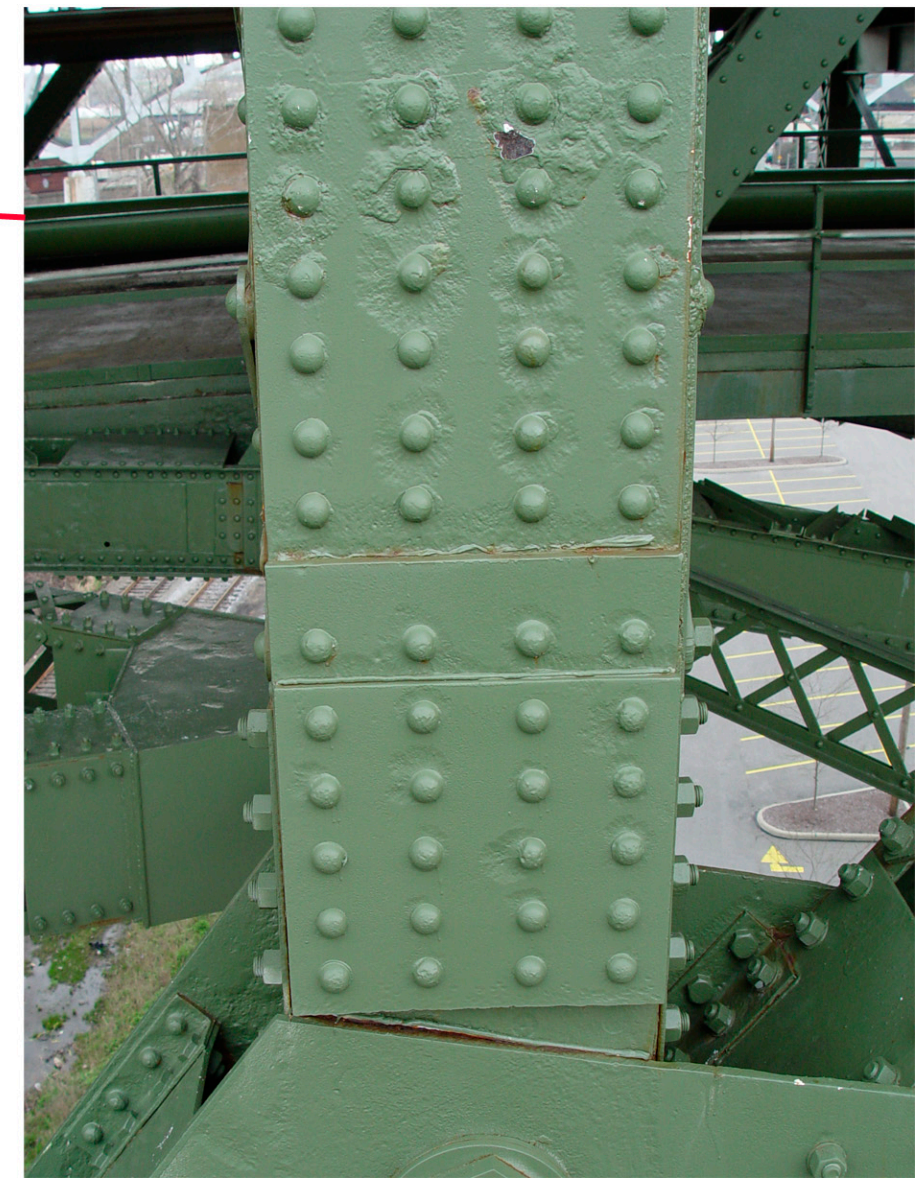
NOTE PITTING AND SCALING TO VERTICAL AT PIN CONNECTION. THIS IS TO TRUSS #1.