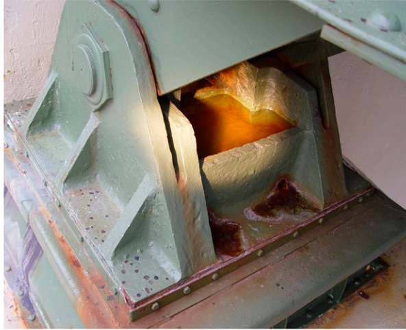
TYPICAL PHOTO OF WATER TRAPPED IN BEARING CHAMBER.