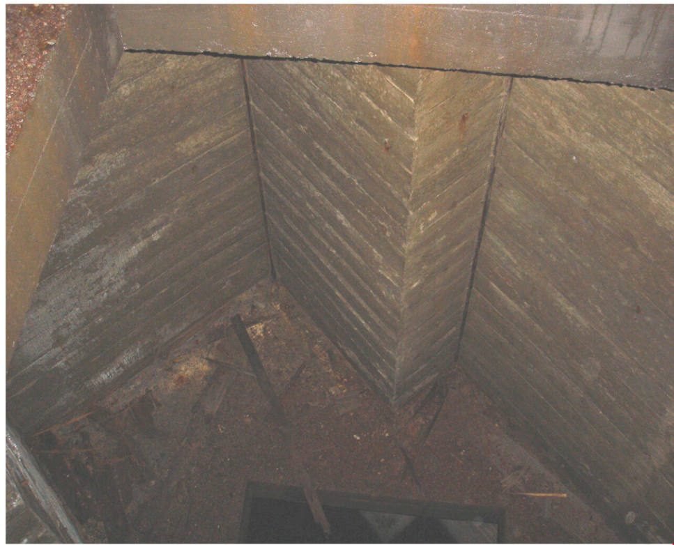
CONFINE SPACE ENTRY OF PIER TOWER. LOOKING DOWN INSIDE OF SOUTH LEG.