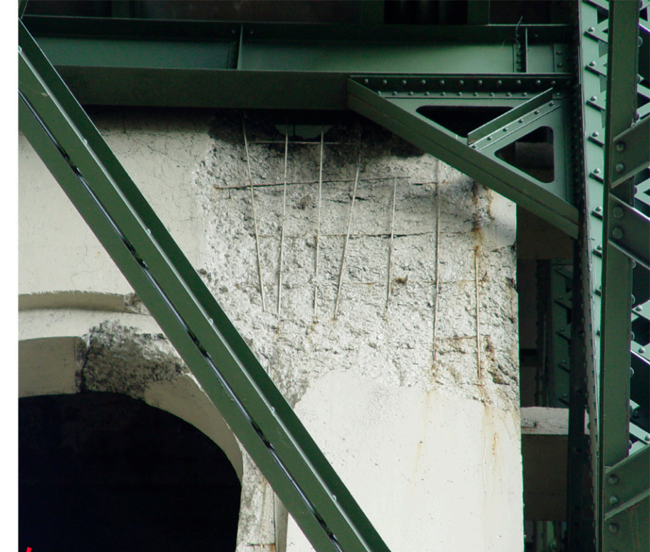
HEAVY SPALLING TO DECORATIVE PART OF PIER TOWER.