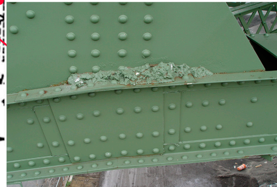
NOTE PAINTED OVER CONCRETE TO LEFT (NORTH) TRUSS.

PIER #7 TO PIER #10 CUY-10-1613 SFN-1801503