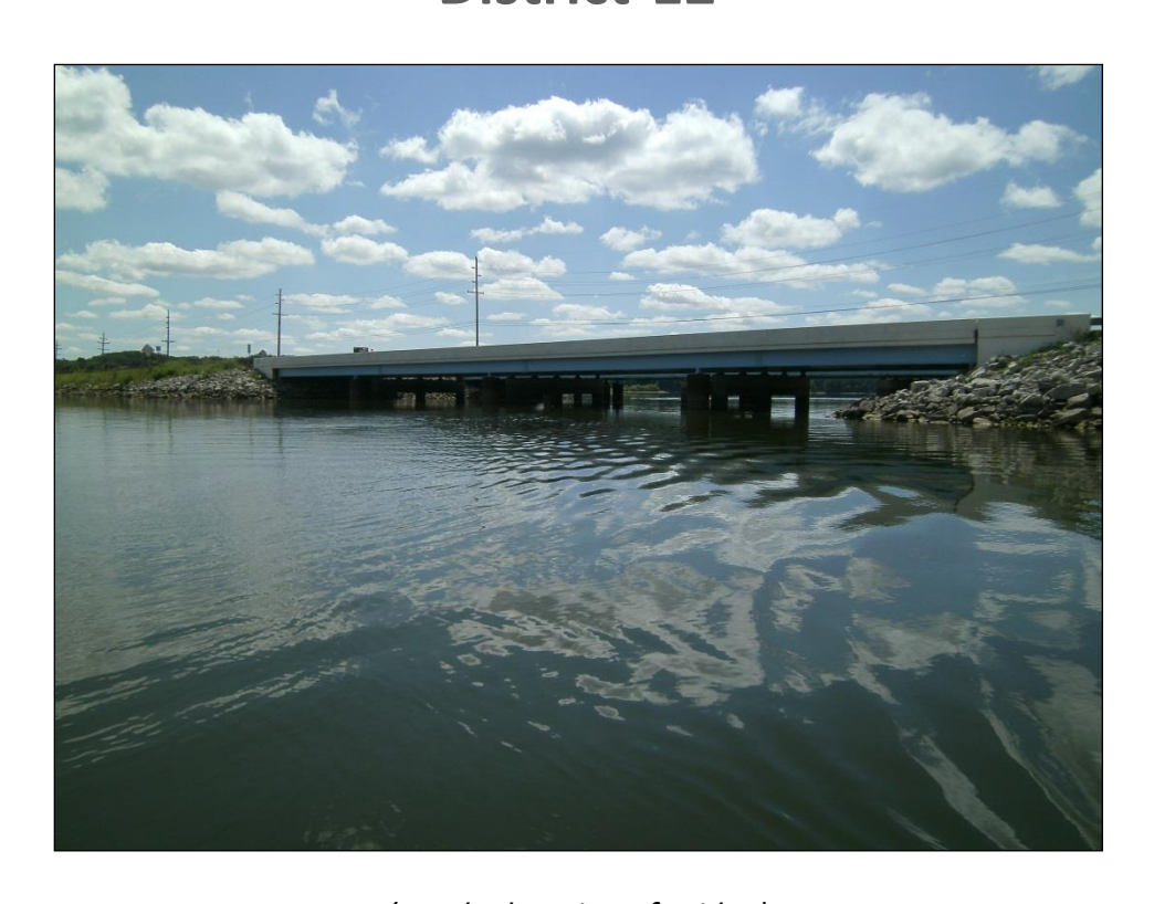
(North Elevation of Bridge)