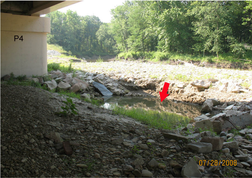
P7: THIS IS THE PATH OF THE BLUE LINE IN P5. NOTE THE SMALL POND THAT THE ARROW IS POINTING TO. POND IS AS DEEP AS 3 FT.