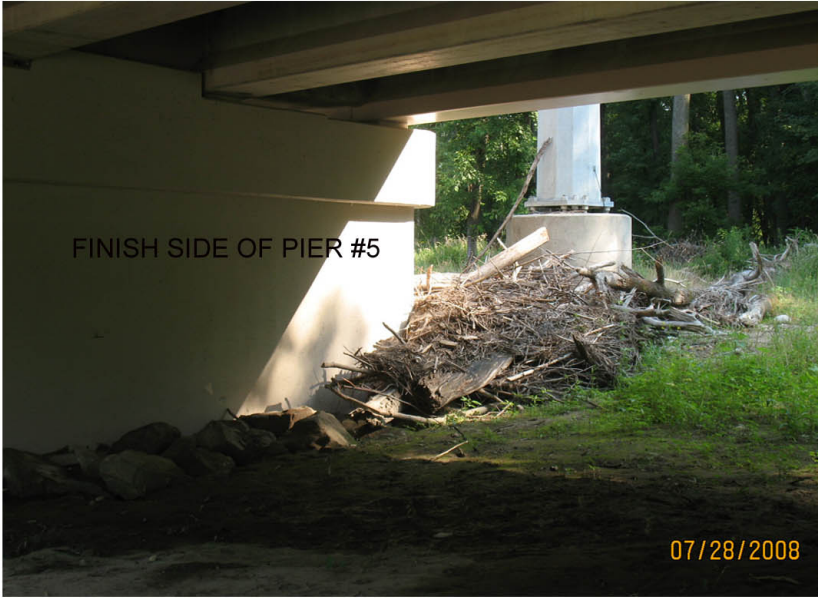
P4: NOTE LOG JAM BETWEEN PIER 5 AND UTIL POLE FOUNDATION. HIGH WATER FLOWS THRU HERE.