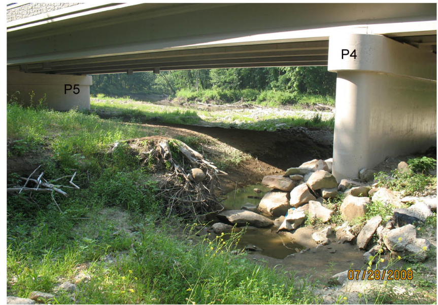
P6: THIS IS THE PATH OF THE RED LINE IN P5. NOTE SOME WASH OUT TO FINISH SIDE OF PIER #4.