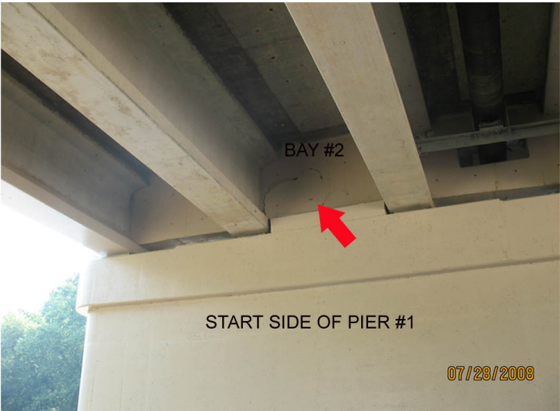
P1: 5 SF DELAM TO CONCRETE DIAPHRAGM.