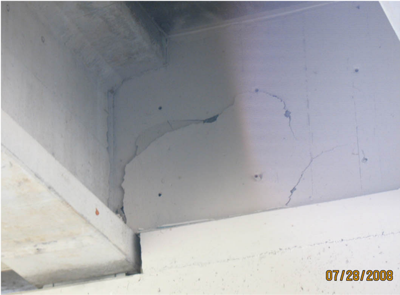
P2: CLOSE-UP OF P1.