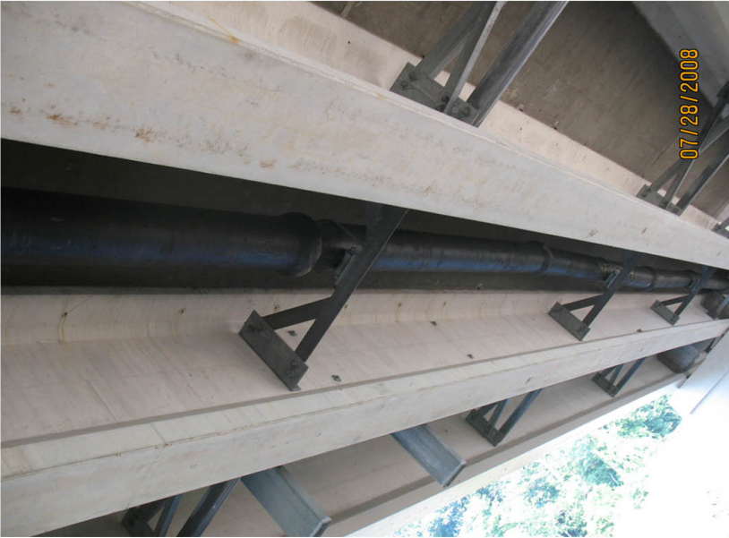
P3: TYPICAL MISALIGNMENT OF 16" PIPE IN BAY #3