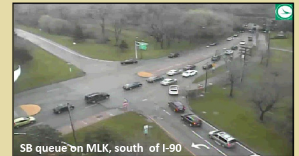
SB queue on MLK, south of I-90