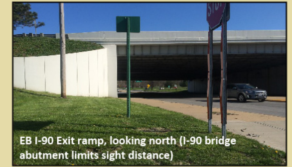
EB I-90 Exit ramp, looking north (I-90 bridge abutment limits sight distance)