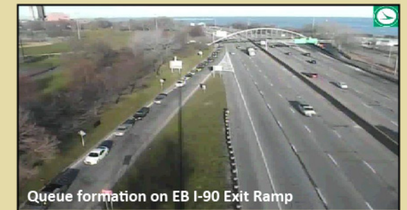
Queue formation on EB I-90 Exit Ramp