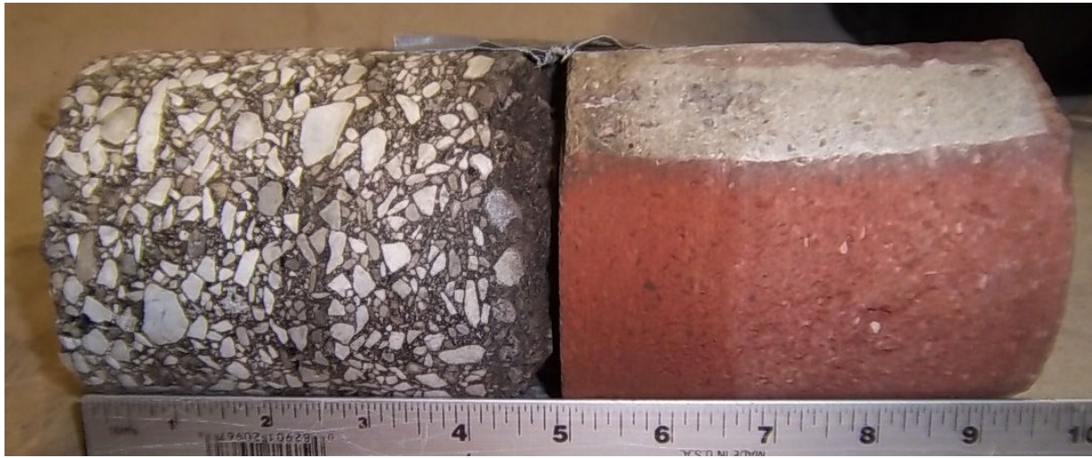
Core #11 Location: North Center of Intersection 5" Asphalt / 4 ½" Brick