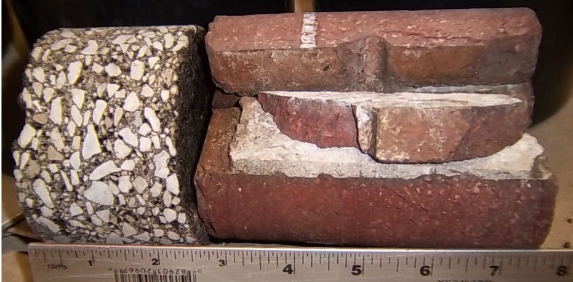
Core #25 Location: NW, West on Professor Ave. 2 1/2" Asphalt / 5" Brick

psi Information To Build On Engineering • Consulting • Testing