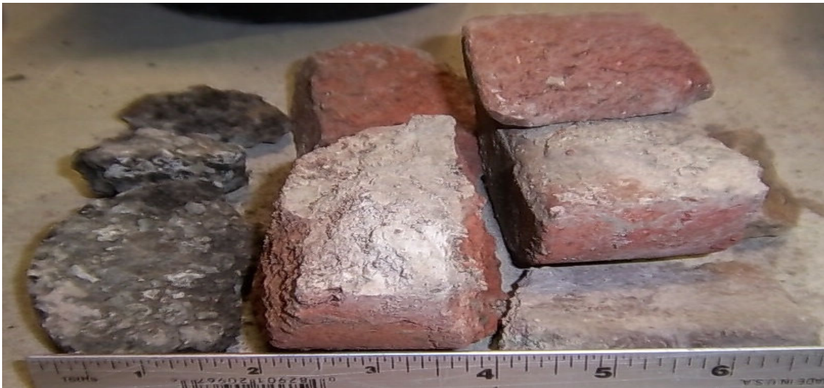
Core #22 Location: NE, North on College Ave. ½" Asphalt / 4" Brick