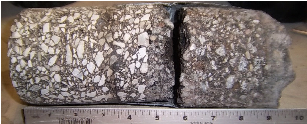
Core #12 Location: NE Center of Intersection 9 ½" Asphalt