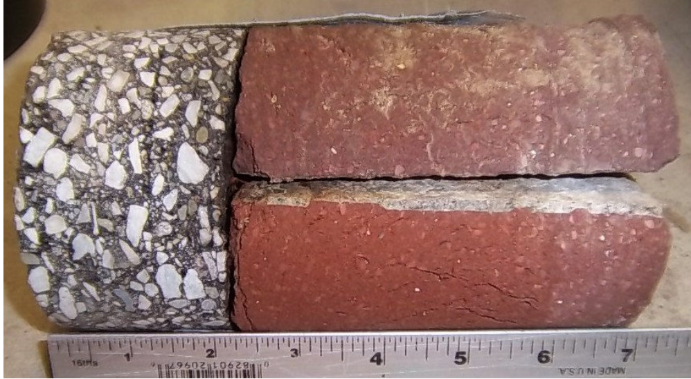
Core #23 Location: NW, North on Professor Ave. 2 ¼" Asphalt / 4 ¾" Brick