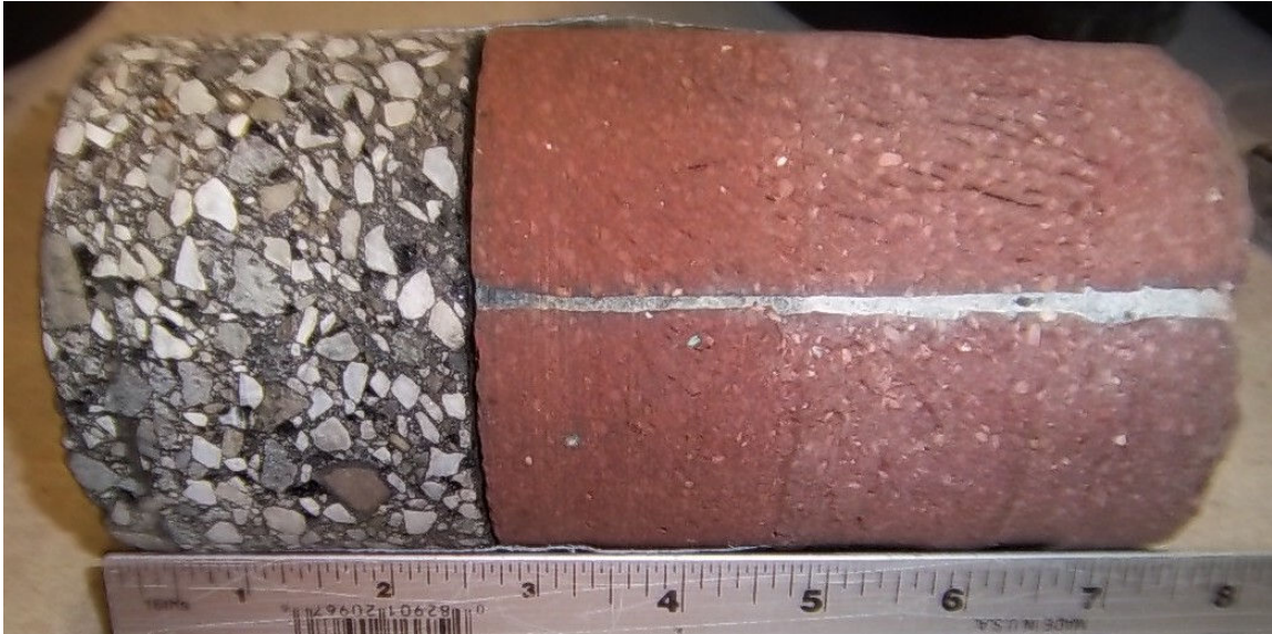
Core #17 Location: SE, South on Professor Ave. 2 ¾" Asphalt / 5" Brick