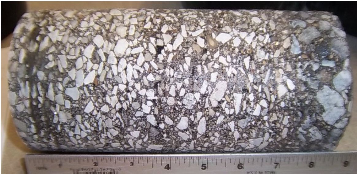
Core #24 Location: NW, Center on Professor Ave. 8 ½" Asphalt