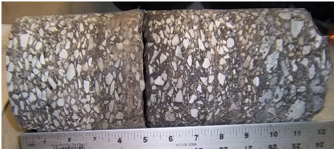
Core #13 Location: Center of Intersection 12" Asphalt