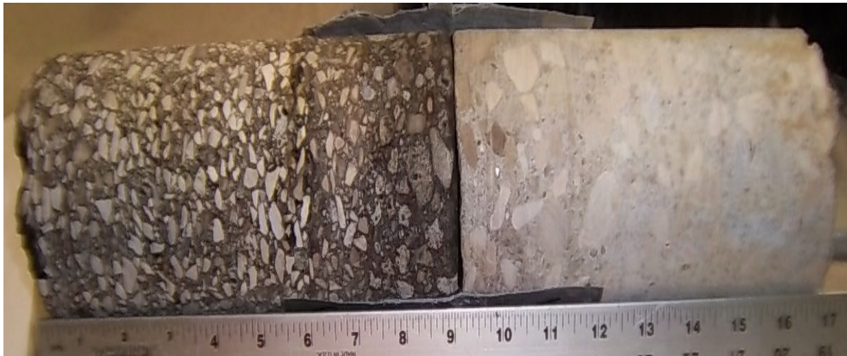
Core #18 Location: SE, Center on Professor Ave. 9 ¼" Asphalt / 7 ¾" Concrete