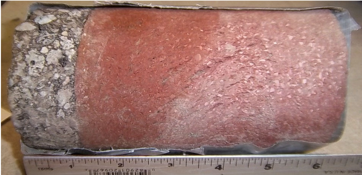
Core #21 Location: NE, Center on College Ave. 1" Asphalt / 5 ¼" Brick