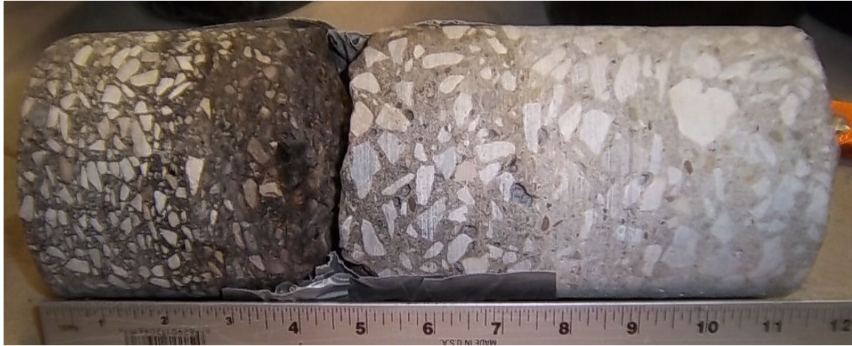
Core #10 Location: NW Center of Intersection 4 1/2" Asphalt / 7" Concrete