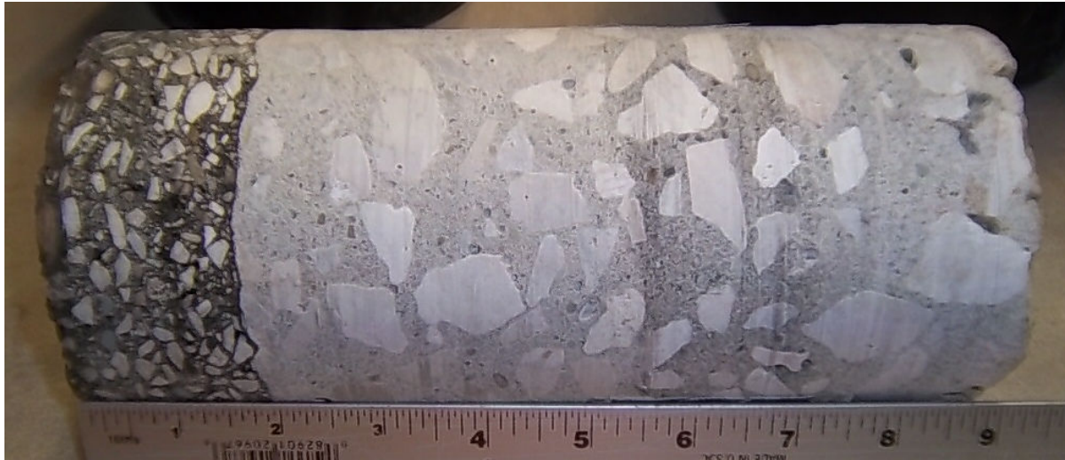
Core #19 Location: SE, East on Professor Ave. 2" Asphalt / 7" Concrete