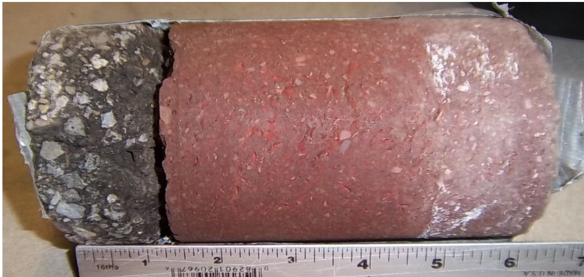
Core #20 Location: NE, East on College Ave. 1 1/4" Asphalt / 4 3/4" Brick