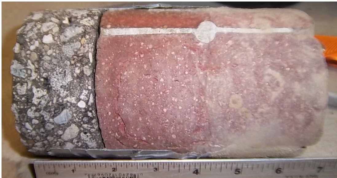
Core #16 Location: SW, South on College Ave. 1 3/4" Asphalt / 5 1/4" Brick