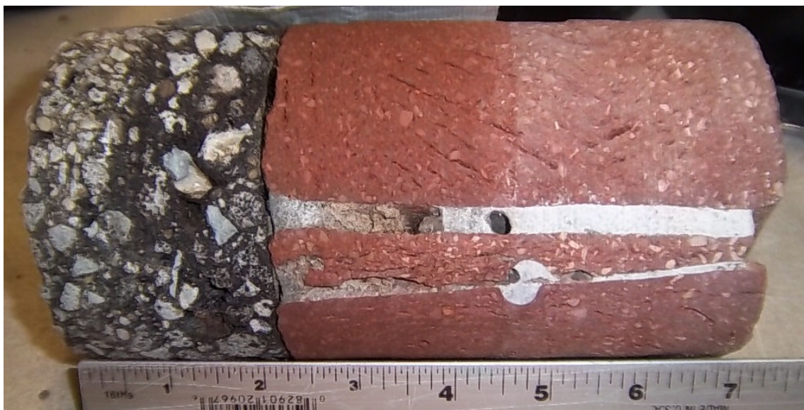
Core #14 Location: SW, West on College Ave 2 1/4" Asphalt / 4 3/4" Brick