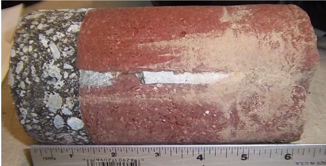
Core #15 Location: SW, Center on College Ave. 1 1/2" Asphalt / 4 3/4" Brick