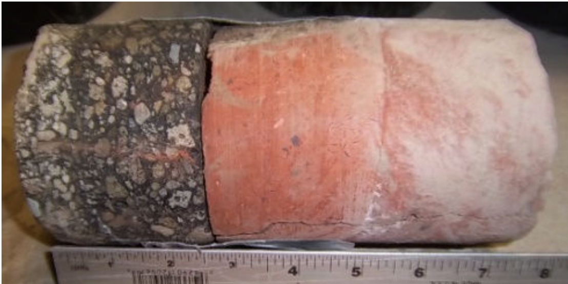
Core #8 Location: E Center on Jefferson 2 ½" Asphalt / 5" Brick