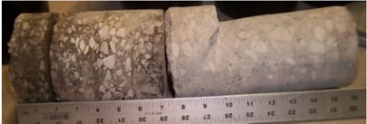
Core #5 Location: N Center on Professor 7 1/2" Asphalt / 8 1/2" Concrete