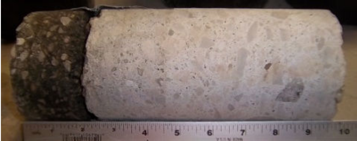
Core #7 Location: NE on Jefferson 2 ¼" Asphalt / 7 ½" Concrete (Reinforcing Steel at 6 ¼")