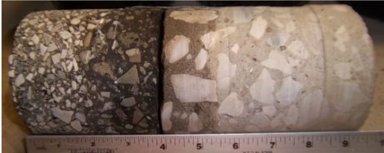
Core #3 Location: NE Center of Intersection 4" Asphalt / 5 ¼" Concrete