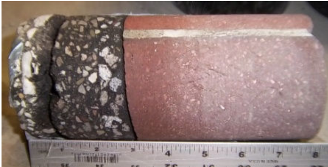
Core #6 Location: NW on Professor 3" Asphalt / 5" Brick