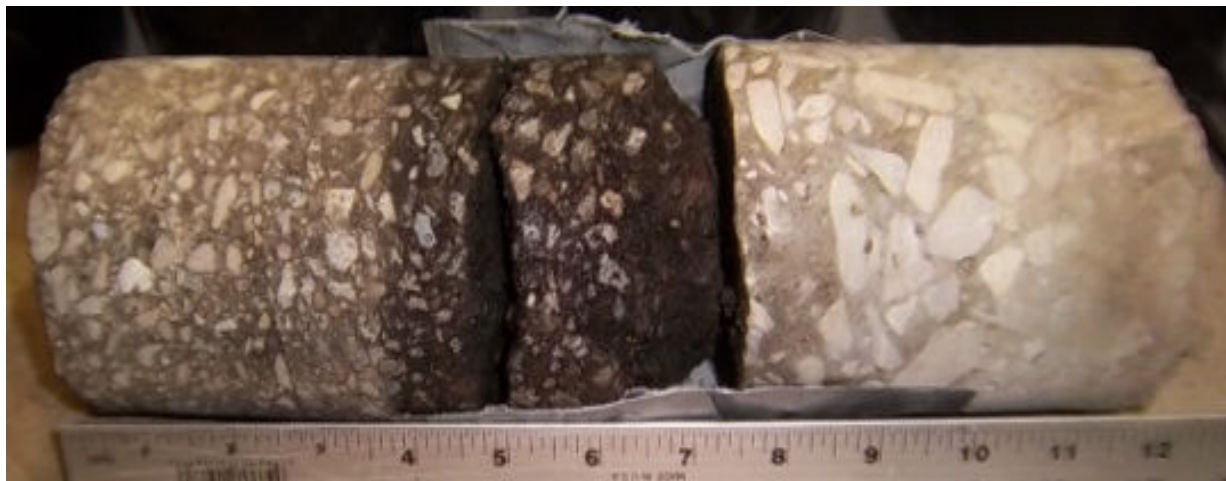
Core #2 Location: NW Center of Intersection 7 1/2" Asphalt / 4 1/2" Concrete