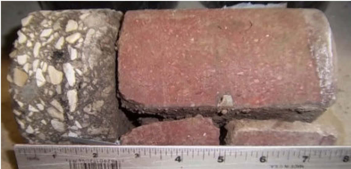
Core #4 Location: NE on Professor 2 ½" Asphalt / 5" Brick