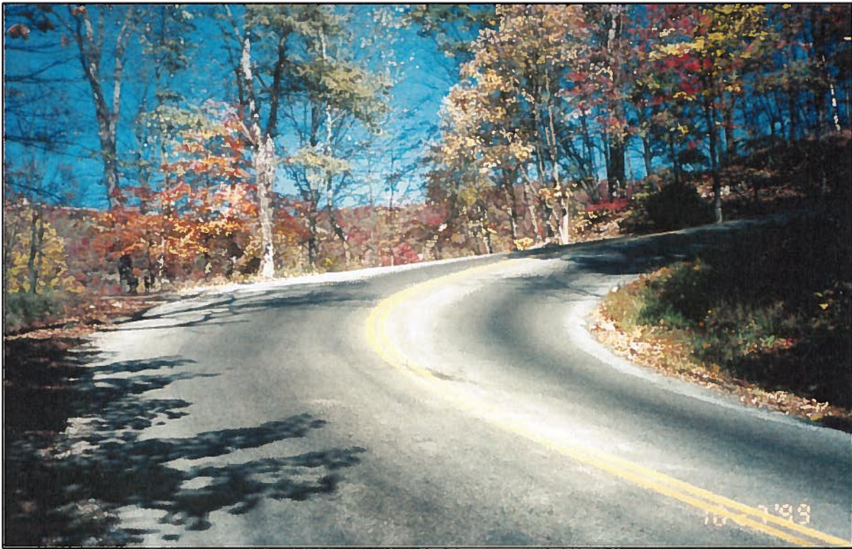
Rosemount Road - Excessive horizontal curves and steep grades make this route undesirable for truck traffic and impassable in severe weather.