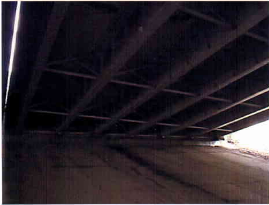
Photograph 03 View Looking West at the Underside of the West Bound Lanes of the Interstate 90 Bridge over East 14 th Street (CUY-90-1651L)