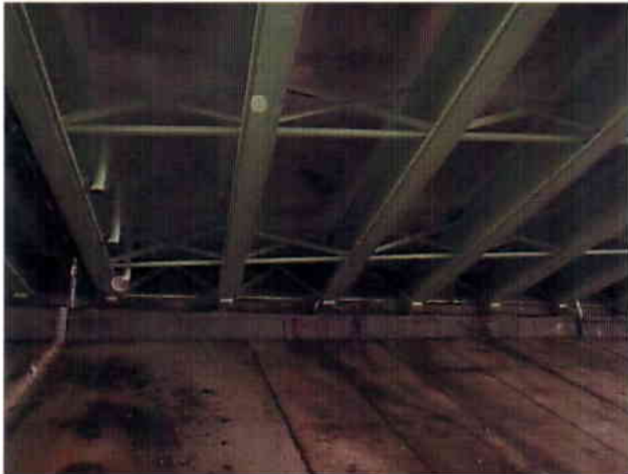
Photograph 20 View Looking West at the Underside of the West Bound Lanes of the Interstate 90 Bridge over East 9 th Street (CUY-90-1628L)