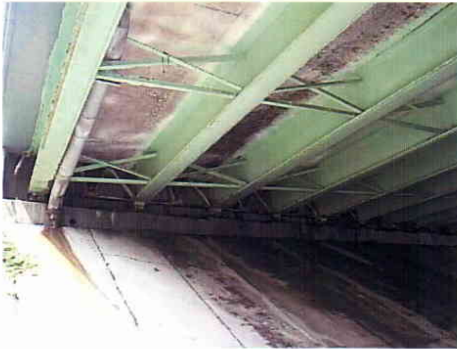
Photograph 25 View Looking West at the Underside of the East Bound Lanes of the Interstate 90 Bridge over East 9 th Street (CUY-90-1628R)