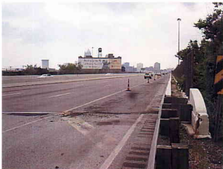
Photograph 28 View Looking North at the Top of the East Bound Lanes of the Interstate 90 Innerbelt Bridge over the Cuyahoga River (CUY-90-15.24)