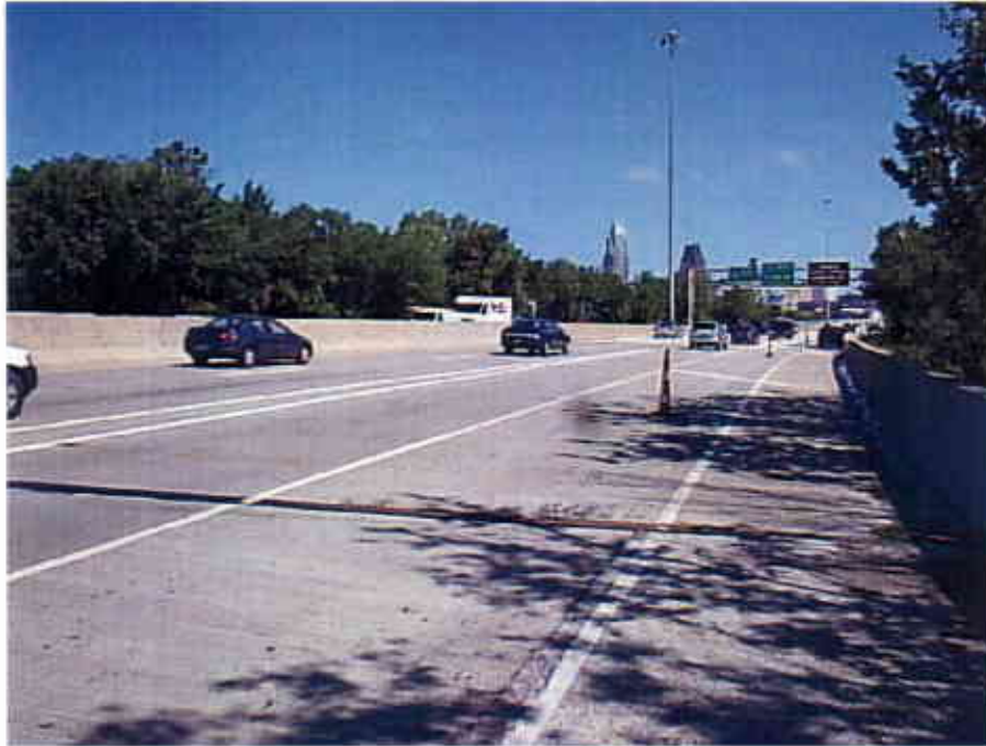
Photograph 41 View Looking North at the Top of the East Bound Lanes of the Interstate 90 Bridge over Kenilworth Avenue (CUY-90-1506)