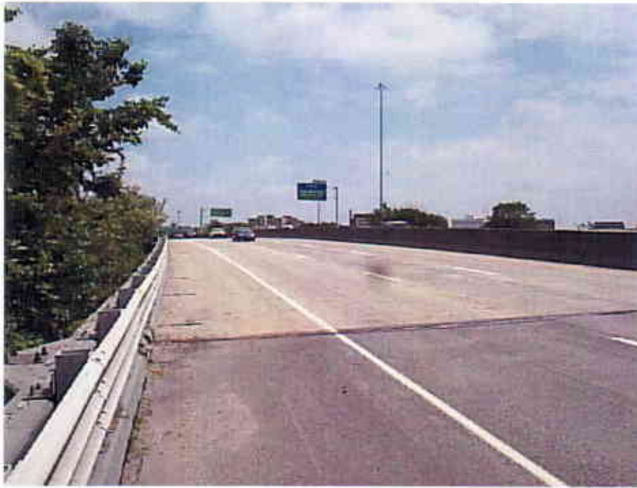
Photograph 13 View Looking East at the Top of the West Bound Lanes of the Interstate 90 Bridge over Ramps E-10 and E-8 (CUY-90-1640)