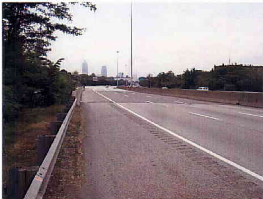
Photograph 42 View Looking North at the Top of the West Bound Lanes of the Interstate 90 Bridge over Starkweather Avenue (CUY-90-1490L)