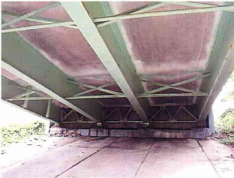
Photograph 18 View Looking East at the Underside of the West Bound On Ramp of the Interstate 90 Bridge over East 9 th Street (CUY-90-1628EW)