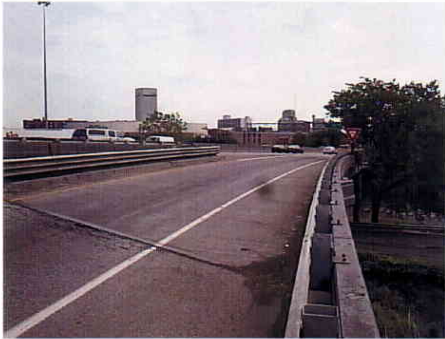
Photograph 01 View Looking East at the Top of the East Bound Lanes of the Interstate 90 Bridge over East 14 th Street (CUY-90-1651R)