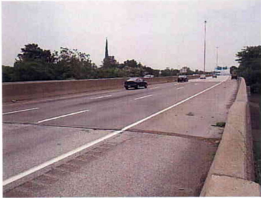
Photograph 43 View Looking South at the Top of the West Bound Lanes of the Interstate 90 Bridge over Starkweather Avenue (CUY-90-1490L)