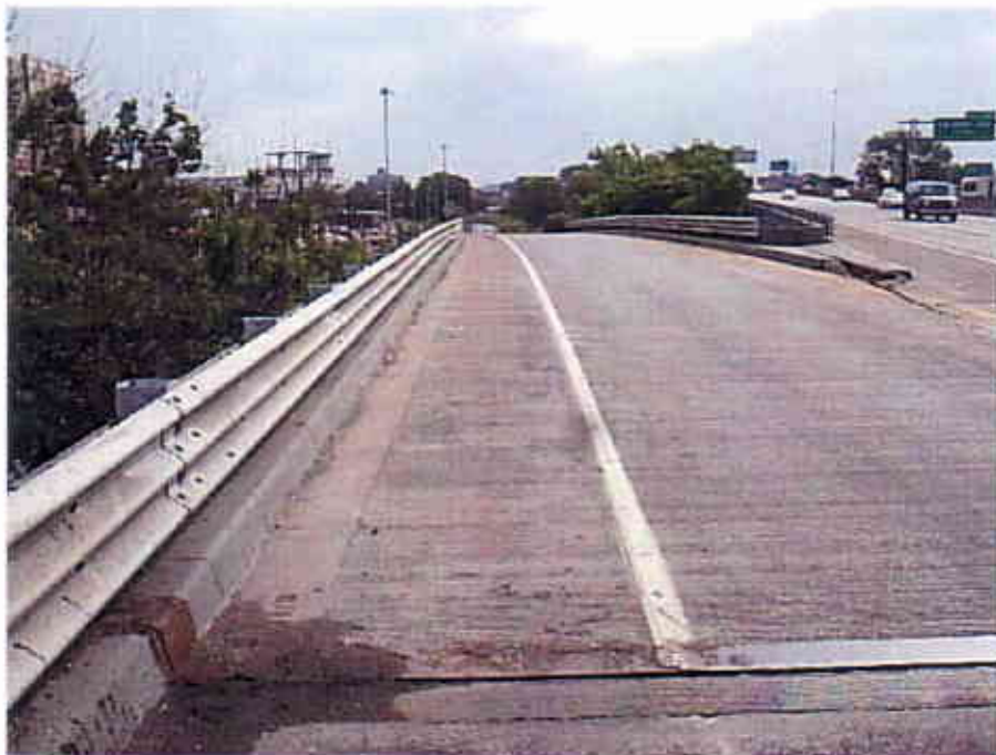
Photograph 16 View Looking East at the Top of the West Bound On Ramp of the Interstate 90 Bridge over East 9 th Street (CUY-90-1628EW)