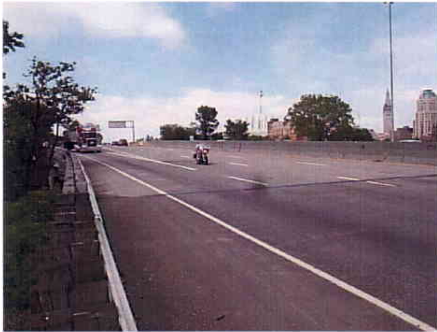
Photograph 07 View Looking West at the Top of the East Bound Lanes of the Interstate 90 Bridge over East 14 th Street (CUY-90-1651R)