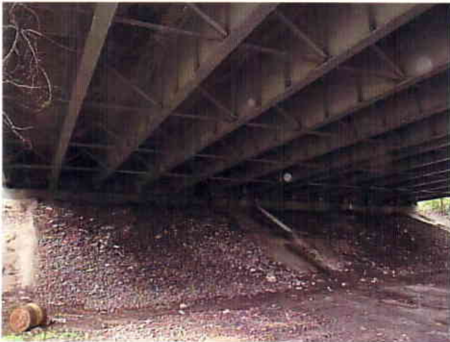
Photograph 14 View Looking West at the Underside of the East and West Bound Lanes of the Interstate 90 Bridge over Ramps E-10 and E-8 (CUY-90-1640)