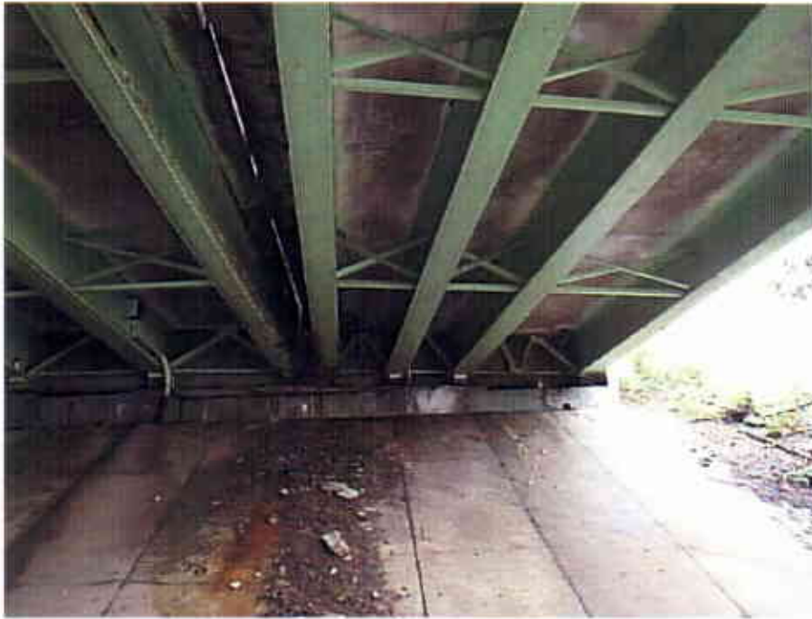
Photograph 17 View Looking West at the Underside of the West Bound On Ramp of the Interstate 90 Bridge over East 9 th Street (CUY-90-1628EW)