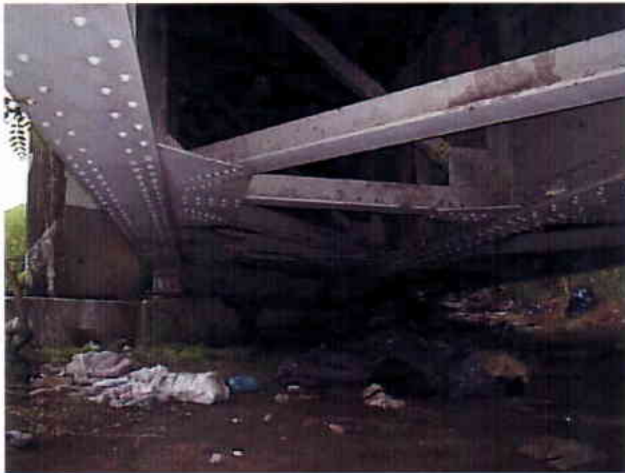
Photograph 30 View Looking West at the Underside of the East Bound Off Ramp Lane of the Interstate 90 Innerbelt Bridge over the Cuyahoga River (CUY-90-15.24)