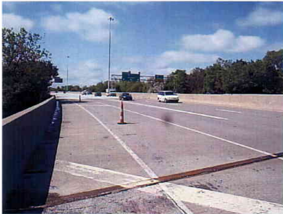
Photograph 36 View Looking South at the Top of the East Bound Lanes of the Interstate 90 Bridge over Kenilworth Avenue (CUY-90-1506)