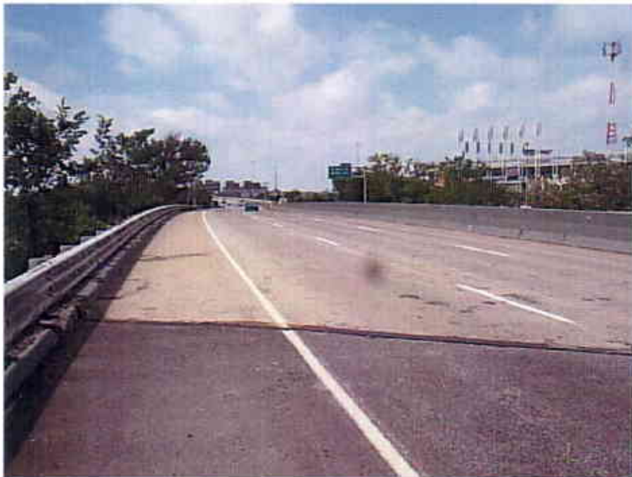
Photograph 10 View Looking West at the Top of the East Bound Lanes of the Interstate 90 Bridge over Ramps E-10 and E-8 (CUY-90-1640)