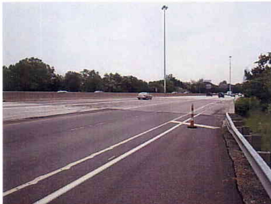
Photograph 46 View Looking North at the Top of the East Bound Lanes of the Interstate 90 Bridge over Starkweather Avenue (CUY-90-1490R)