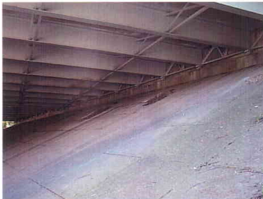
Photograph 40 View Looking South at the Underside of the East and West Bound Lanes of the Interstate 90 Bridge over Kenilworth Avenue (CUY-90-1506)