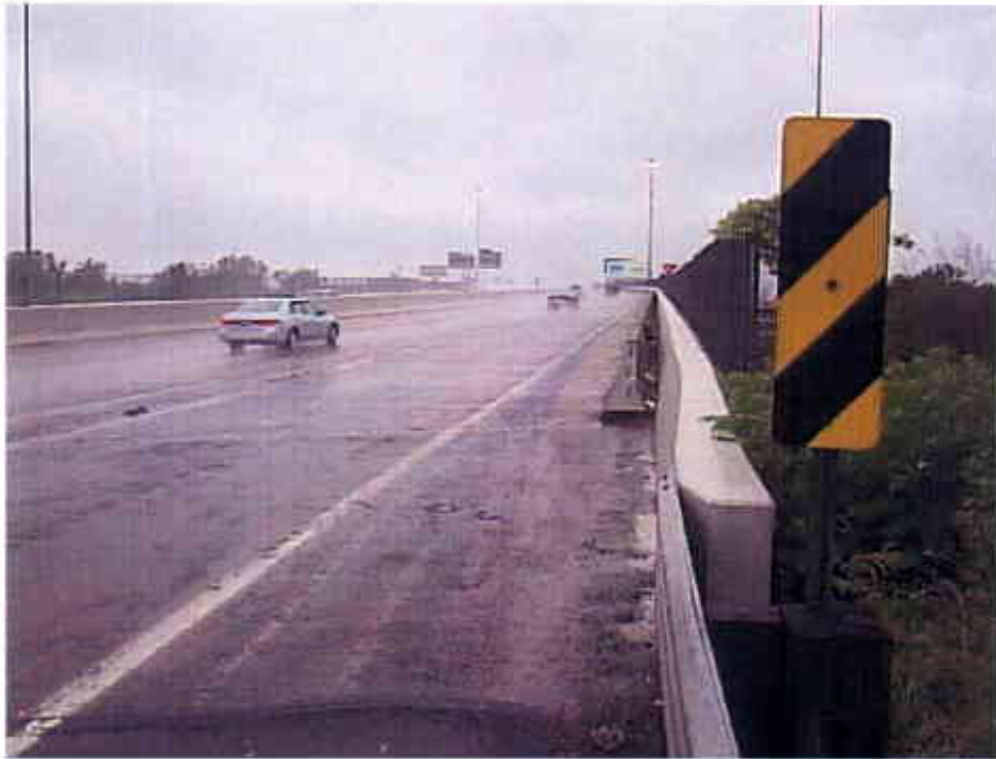
Photograph 33 View Looking West at the Top of the West Bound Lanes of the Interstate 90 Innerbelt Bridge over the Cuyahoga River (CUY-90-15.24)