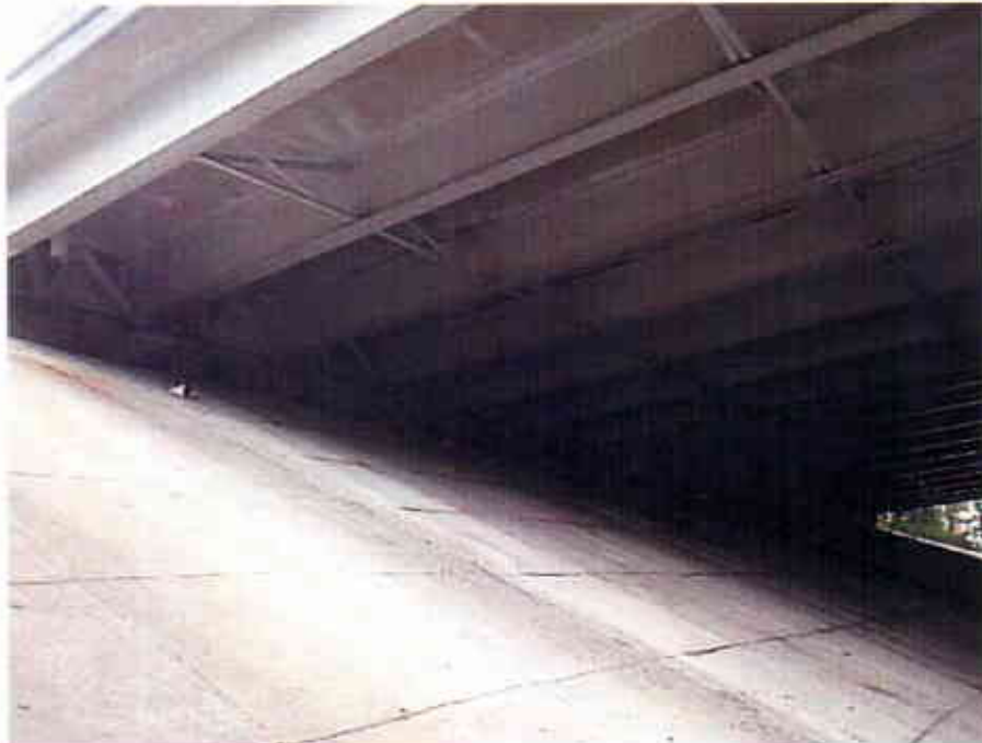
Photograph 44 View Looking North at the Underside of the East and West Bound Lanes of the Interstate 90 Bridge over Starkweather Avenue (CUY-90-1490L)