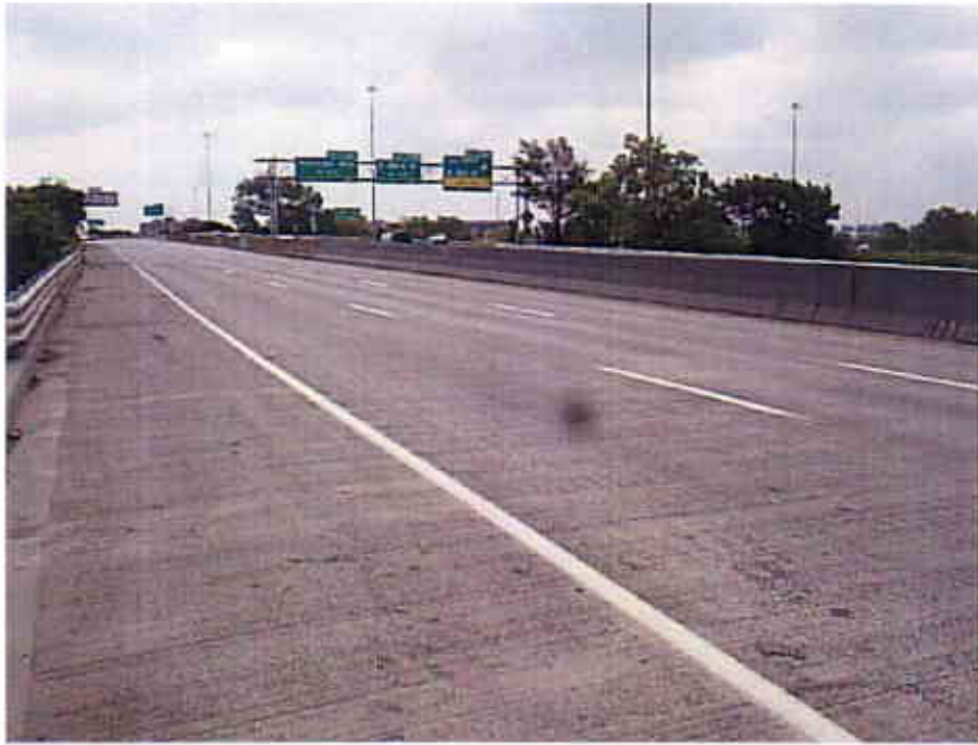
Photograph 19 View Looking West at the Top of the West Bound Lanes of the Interstate 90 Bridge over East 9 th Street (CUY-90-1628L)