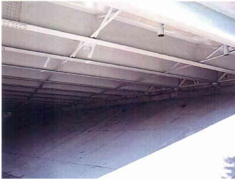
Photograph 37 View Looking North at the Underside of the East and West Bound Lanes of the Interstate 90 Bridge over Kenilworth Avenue (CUY-90-1506)