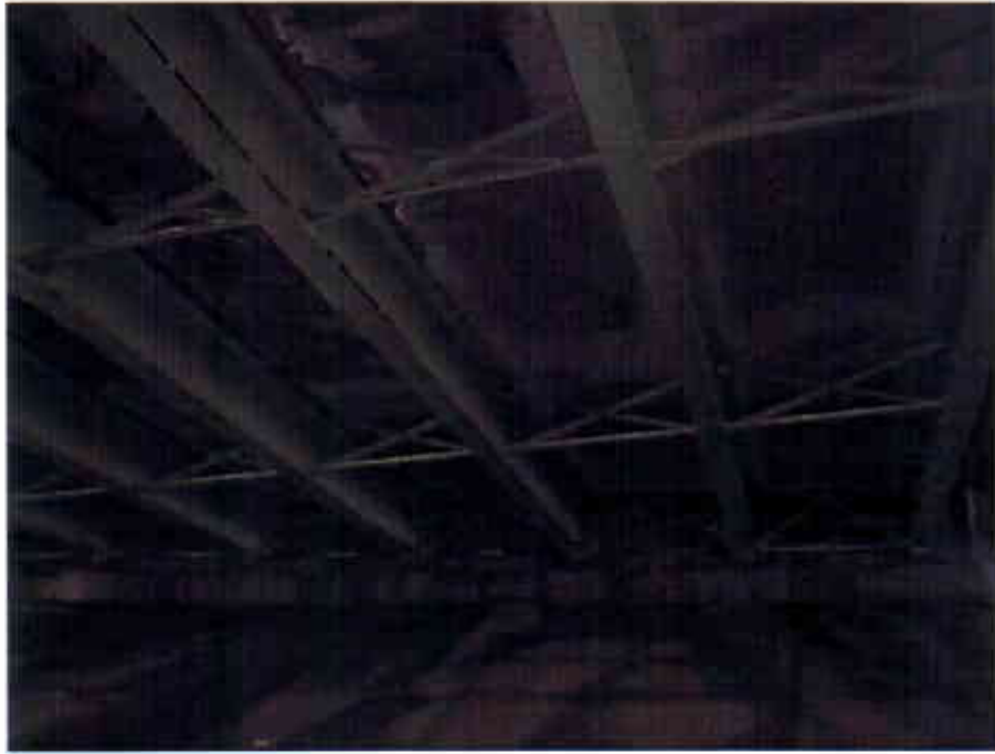
Photograph 21 View Looking East at the Underside of the West Bound Lanes of the Interstate 90 Bridge over East 9 th Street (CUY-90-1628L)