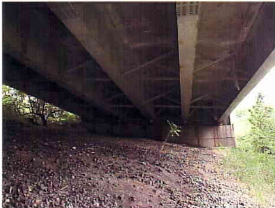
Photograph 50 View Looking West at the Underside of the East Bound Lanes of the Interstate 90 Bridge Ramp WN under I-71 Mainline Bridge (CUY-90-1463R)