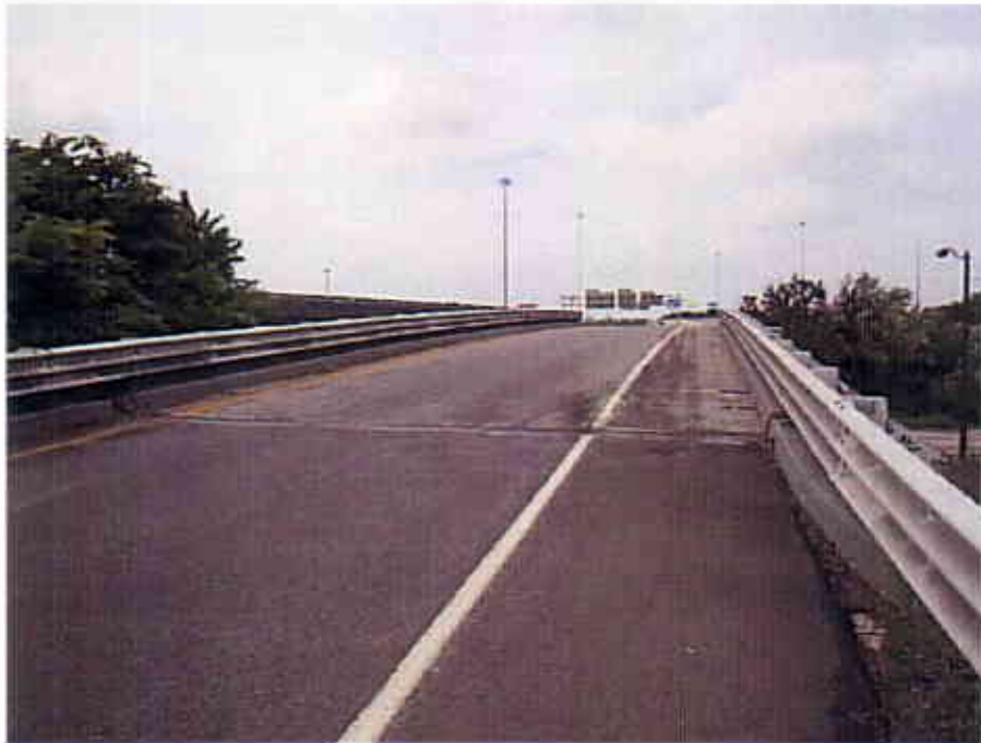
Photograph 15 View Looking West at the Top of the West Bound On Ramp of the Interstate 90 Bridge over East 9 th Street (CUY-90-1628EW)