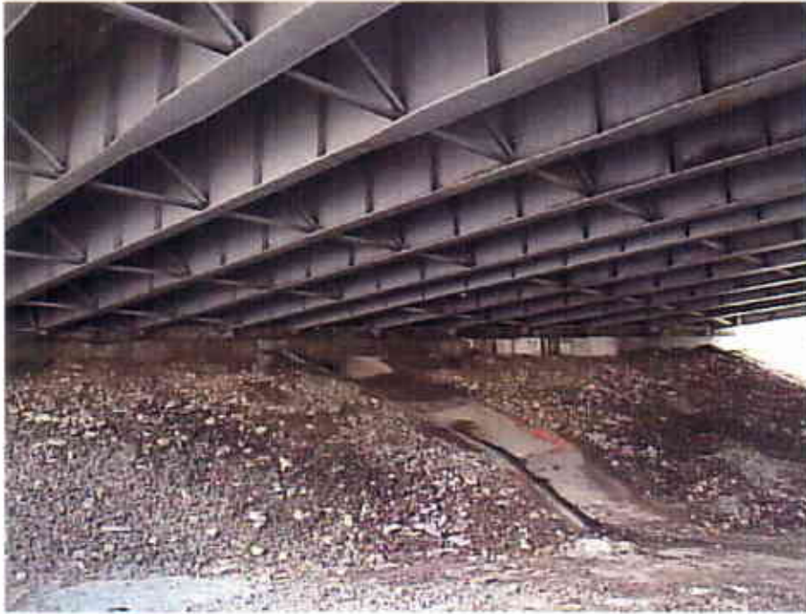
Photograph 11 View Looking East at the Underside of the East and West Bound Lanes of the Interstate 90 Bridge over Ramps E-10 and E-8 (CUY-90-1640)