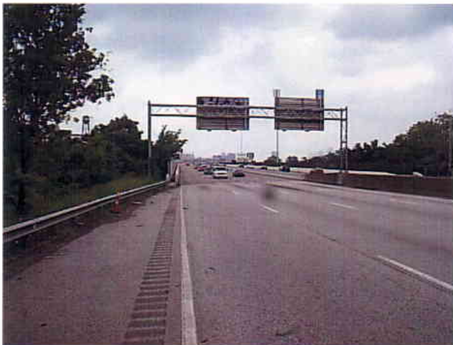
Photograph 26 View Looking North at the Top of the West Bound Lanes of the Interstate 90 Innerbelt Bridge over the Cuyahoga River (CUY-90-15.24)