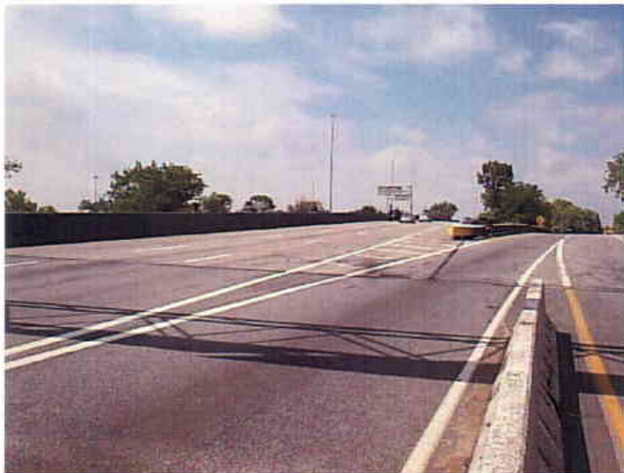
Photograph 08 View Looking West at the Top of the West Bound Lanes of the Interstate 90 Bridge over East 14 th Street (CUY-90-1651L)