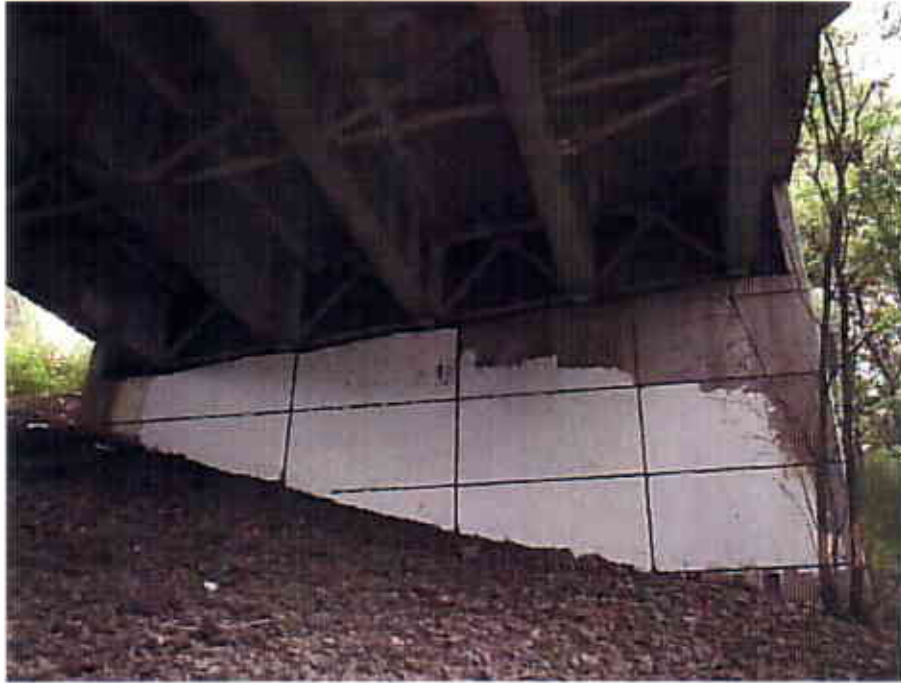
Photograph 49 View Looking North at the Underside of the East Bound Lanes of the Interstate 90 Bridge Ramp WN under I-71 Mainline Bridge (CUY-90-1463R)