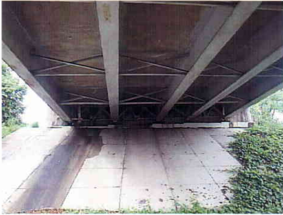
Photograph 35 View Looking South at the Underside of the West Bound Off Ramp Lane of the Interstate 90 Innerbelt Bridge over the Cuyahoga River (CUY-90-15.24)