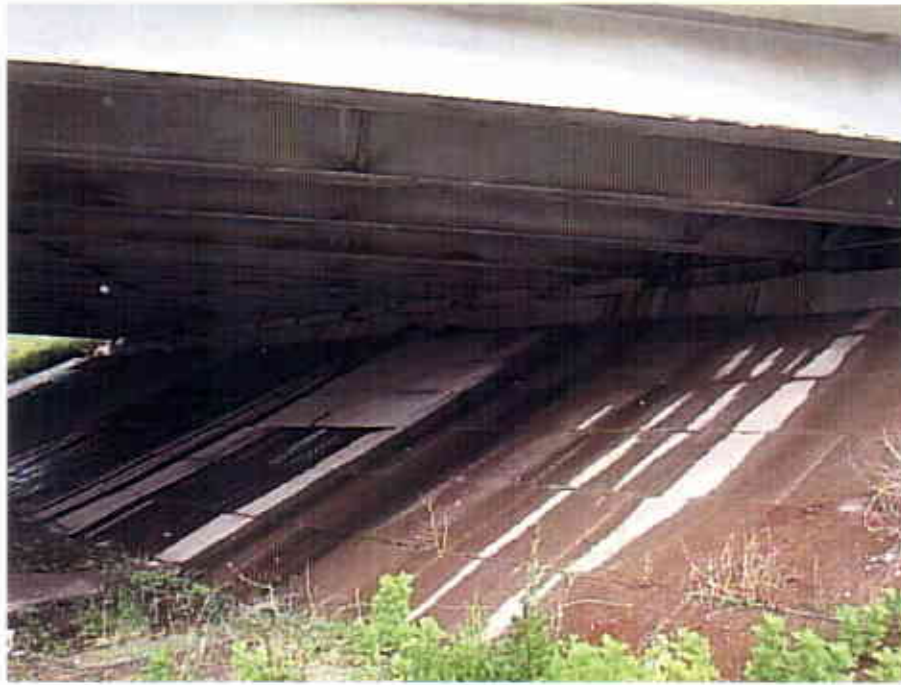
Photograph 31 View Looking West at the Underside of the East and West Bound Lanes of the Interstate 90 Innerbelt Bridge over the Cuyahoga River (CUY-90-15.24)