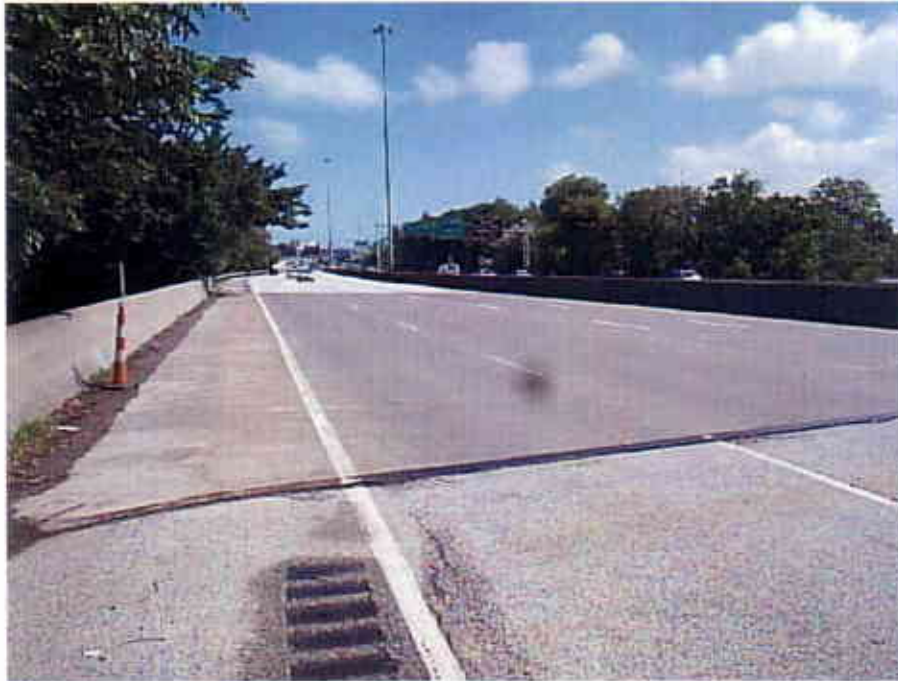
Photograph 39 View Looking North at the Top of the West Bound Lanes of the Interstate 90 Bridge over Kenilworth Avenue (CUY-90-1506)