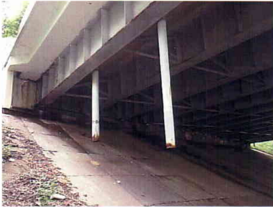
Photograph 27 View Looking South at the Underside of the East and West Bound Lanes of the Interstate 90 Innerbelt Bridge over the Cuyahoga River (CUY-90-15.24)