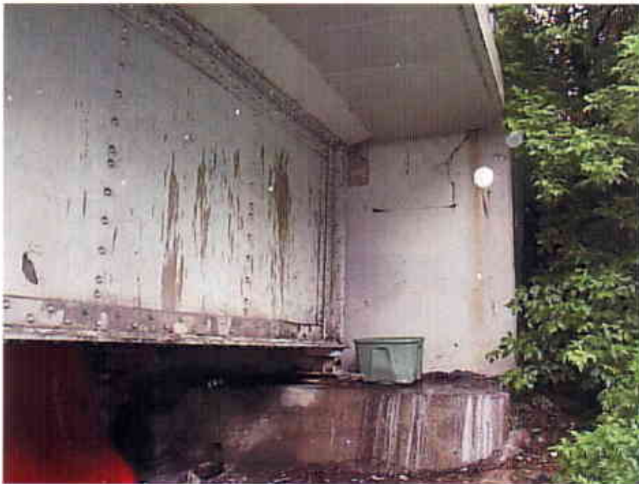
Photograph 34 View Looking North at the Underside of the West Bound On Ramp Lane of the Interstate 90 Innerbelt Bridge over the Cuyahoga River (CUY-90-15.24)