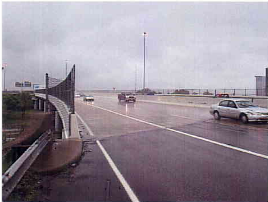
Photograph 32 View Looking West at the Top of the East Bound Lanes of the Interstate 90 Innerbelt Bridge over the Cuyahoga River (CUY-90-15.24)