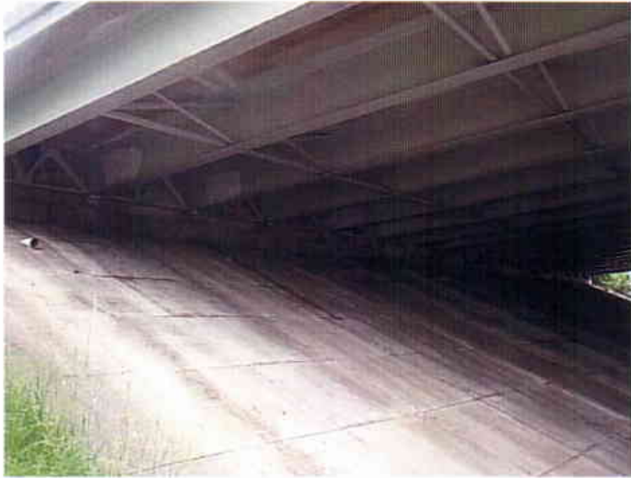
Photograph 47 View Looking South at the Underside of the East and West Bound Lanes of the Interstate 90 Bridge over Starkweather Avenue (CUY-90-1490R)