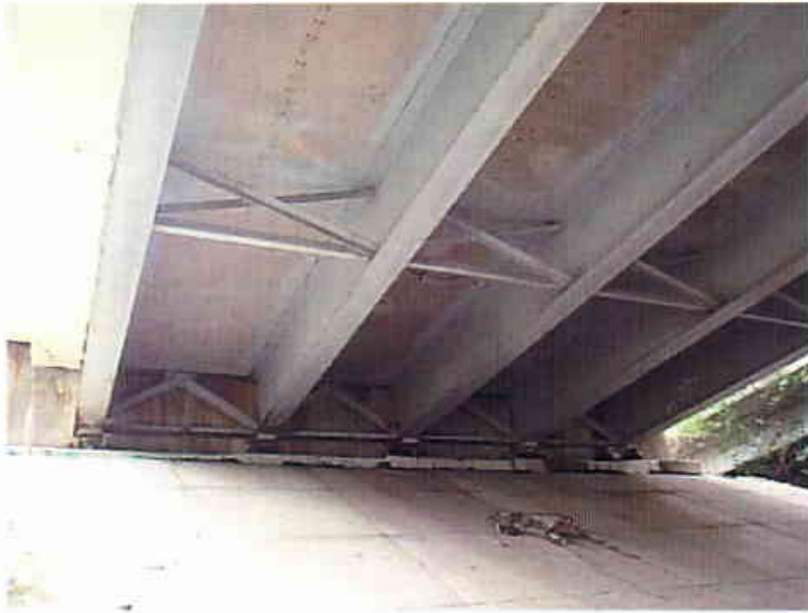
Photograph 29 View Looking South at the Underside of the East Bound On Ramp Lane of the Interstate 90 Innerbelt Bridge over the Cuyahoga River (CUY-90-15.24)