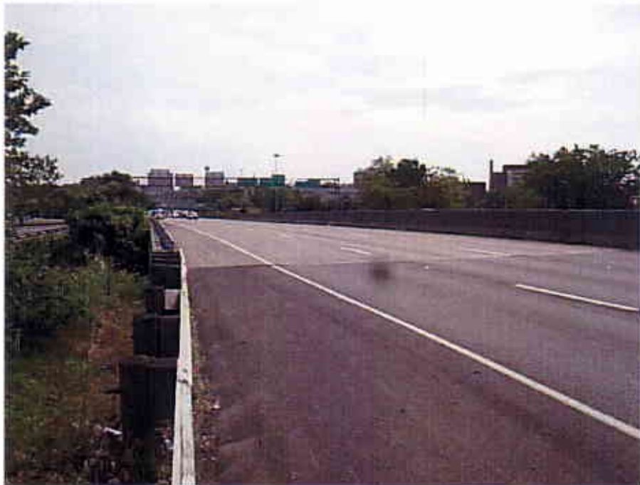
Photograph 02 View Looking East at the Top of the West Bound Lanes of the Interstate 90 Bridge over East 14 th Street (CUY-90-1651L)