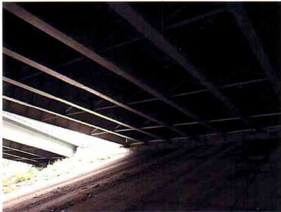
Photograph 04 View Looking West at the Underside of the East Bound Lanes of the Interstate 90 Bridge over East 14 th Street (CUY-90-1651R)