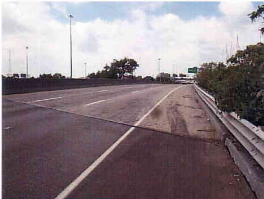
Photograph 12 View Looking West at the Top of the West Bound Lanes of the Interstate 90 Bridge over Ramps E-10 and E-8 (CUY-90-1640)