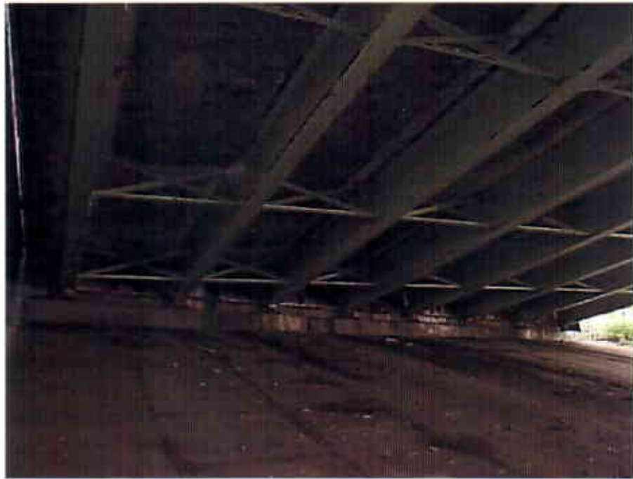
Photograph 22 View Looking East at the Underside of the East Bound Lanes of the Interstate 90 Bridge over East 9 th Street (CUY-90-1628R)