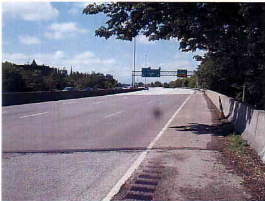
Photograph 38 View Looking South at the Top of the West Bound Lanes of the Interstate 90 Bridge over Kenilworth Avenue (CUY-90-1506)