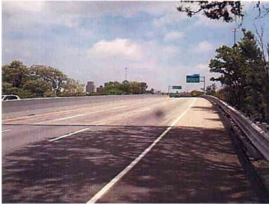
Photograph 09 View Looking East at the Top of the East Bound Lanes of the Interstate 90 Bridge over Ramps E-10 and E-8 (CUY-90-1640)