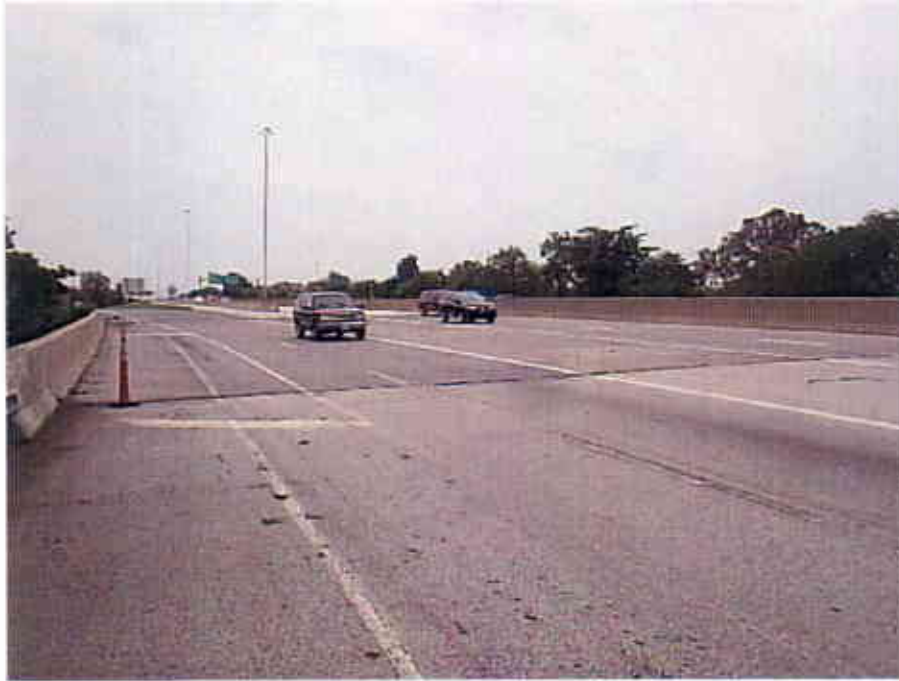
Photograph 45 View Looking South at the Top of the East Bound Lanes of the Interstate 90 Bridge over Starkweather Avenue (CUY-90-1490R)