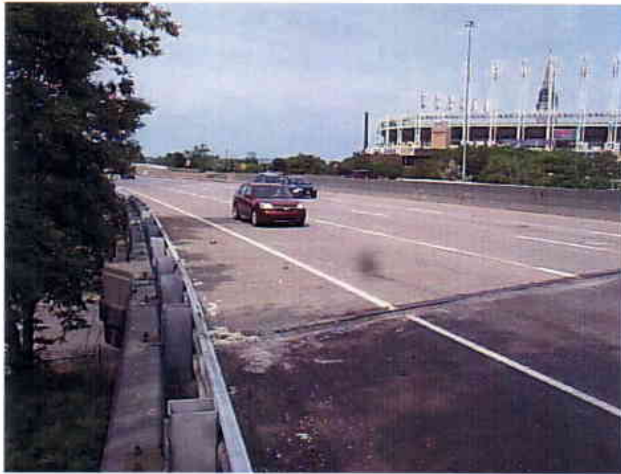
Photograph 23 View Looking West at the Top of the East Bound Lanes of the Interstate 90 Bridge over East 9 th Street (CUY-90-1628R)