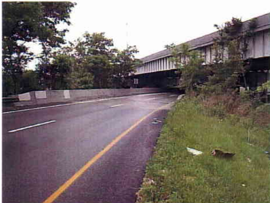
Photograph 48 View Looking South at the Top of the East Bound Lanes of the Interstate 90 Bridge Ramp WN under I-71 Mainline Bridge (CUY-90-1463R)