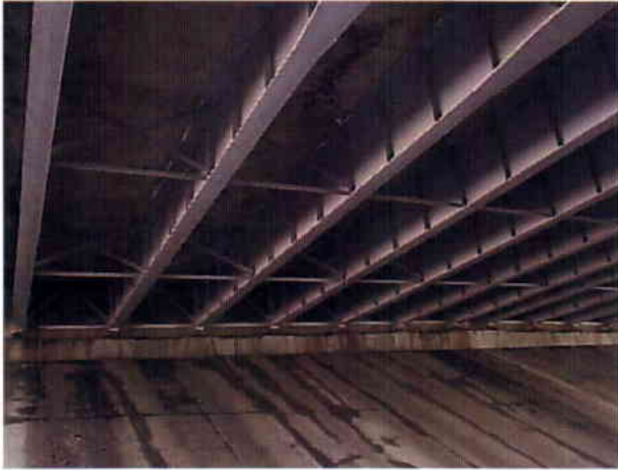
Photograph 05 View Looking East at the Underside of the West Bound Lanes of the Interstate 90 Bridge over East 14 th Street (CUY-90-1651L)