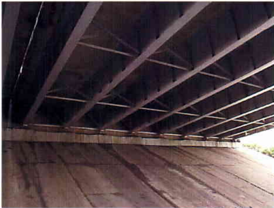
Photograph 06 View Looking East at the Underside of the East Bound Lanes of the Interstate 90 Bridge over East 14 th Street (CUY-90-1651R)