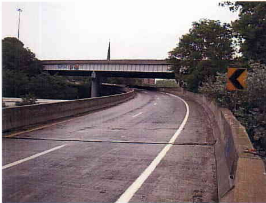
Photograph 51 View Looking Northwest at the Top of the East Bound Lanes of the Interstate 90 Bridge Ramp WN under I-71 Mainline Bridge (CUY-90-1463R)