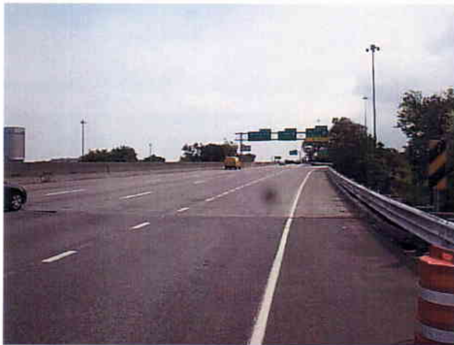
Photograph 24 View Looking East at the Top of the East Bound Lanes of the Interstate 90 Bridge over East 9 th Street (CUY-90-1628R)